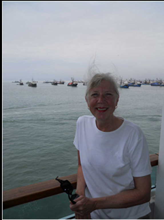
balcony view of Lima