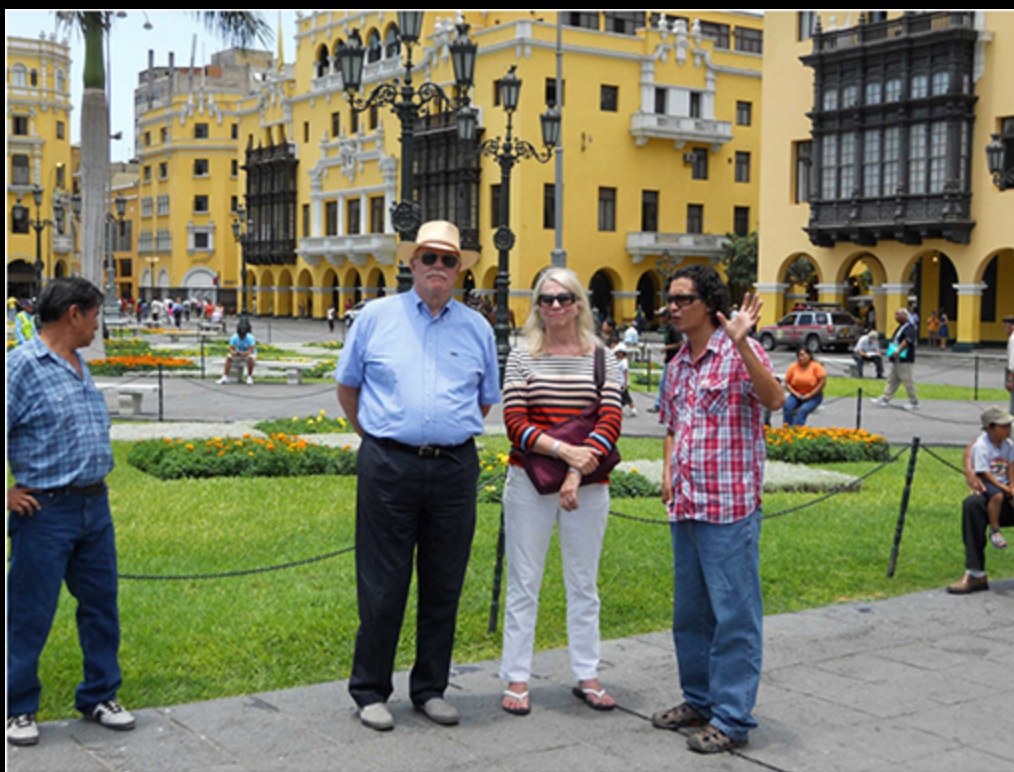
Our tour Lima guide