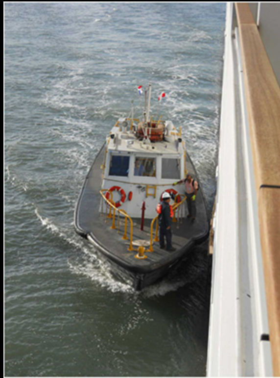
Panama canal pilot boarding