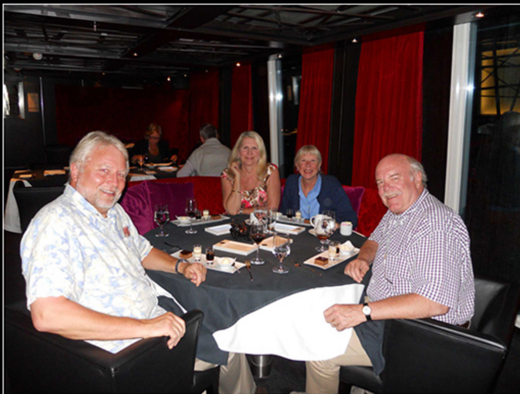
dinner in Restaurant 2