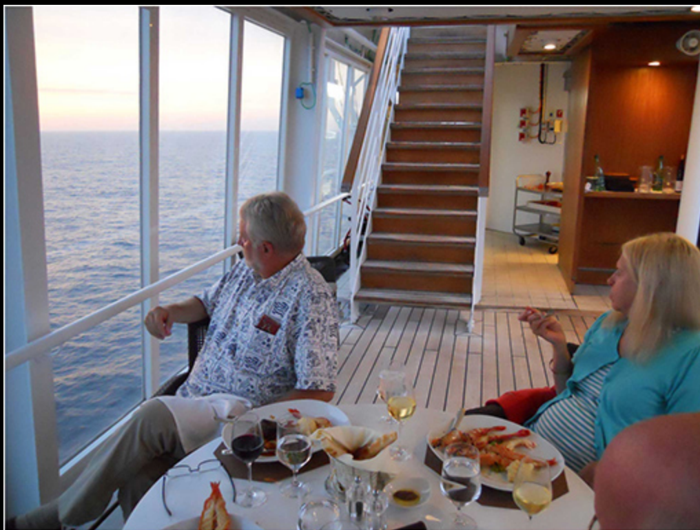
dinner in the Patio Grill at sunset