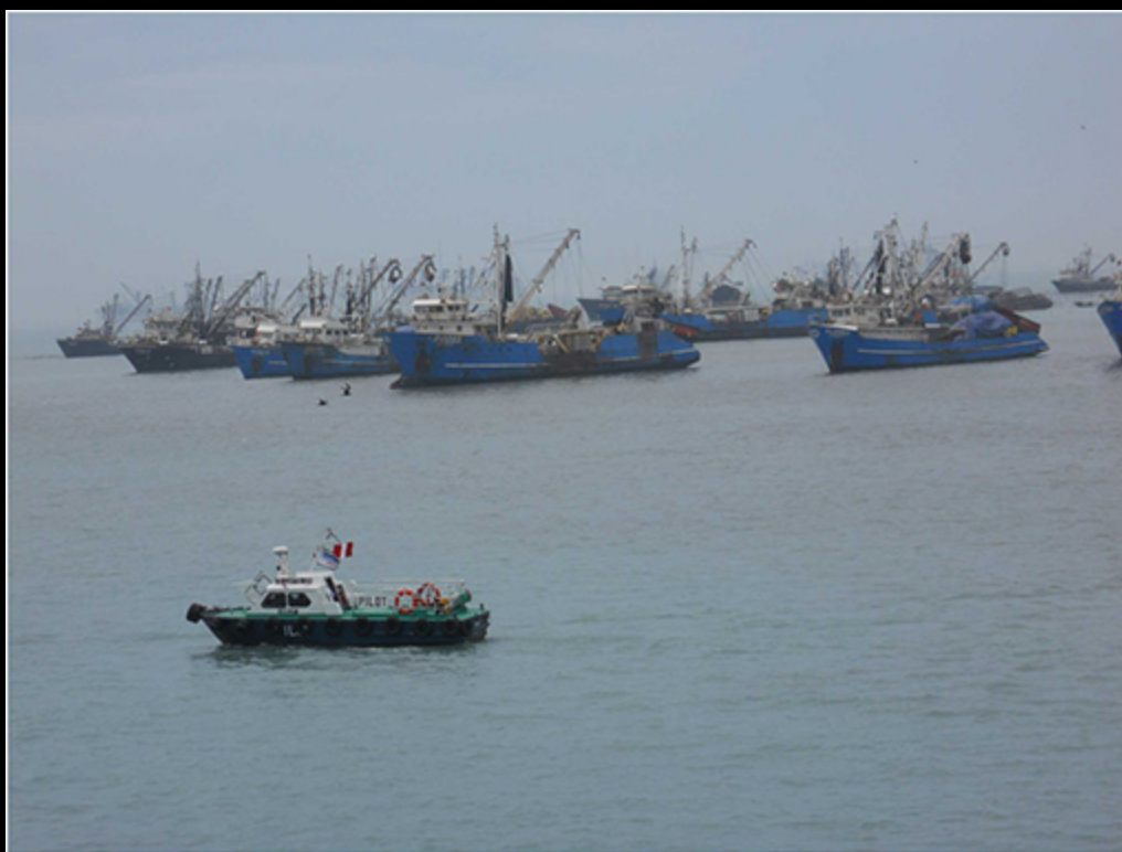
Lima tuna boats