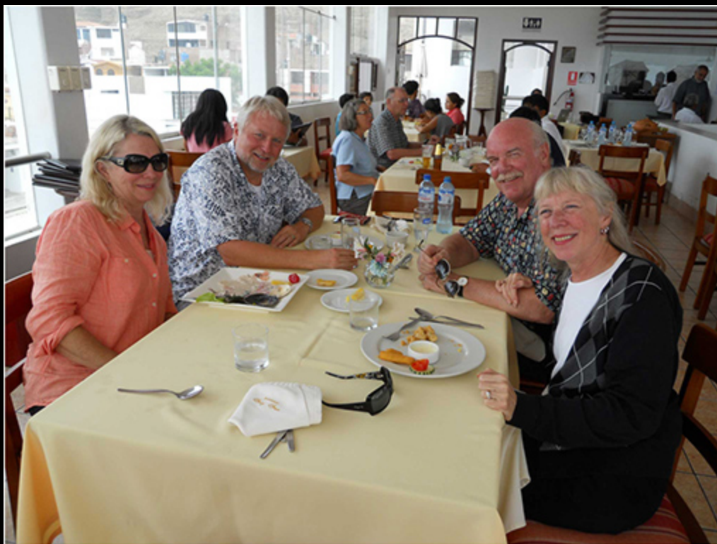
Big Ben restaurant Huanchaco beach