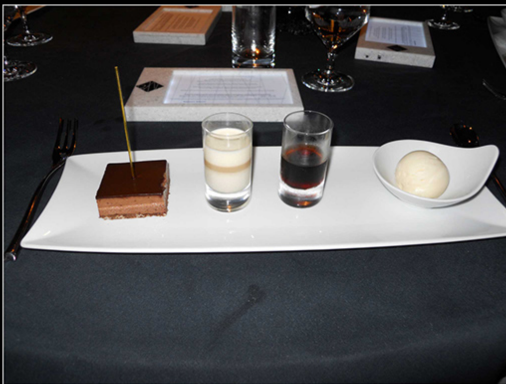
Restaurant 2 dessert course