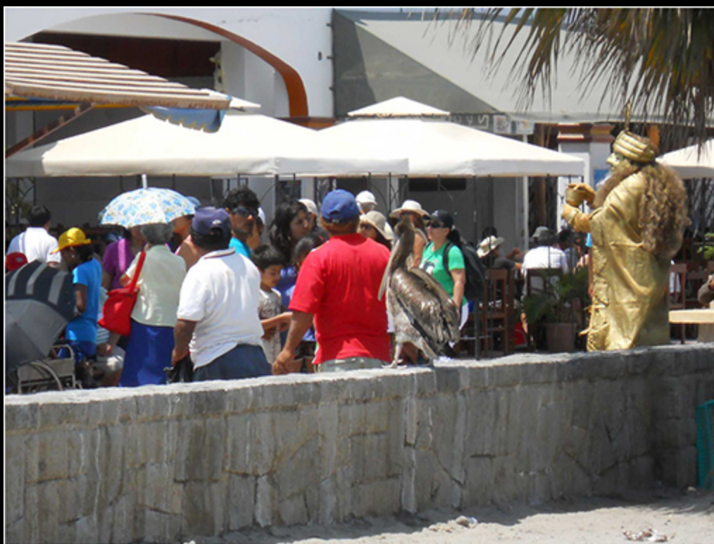
Pelican man and his "pet" Pelican