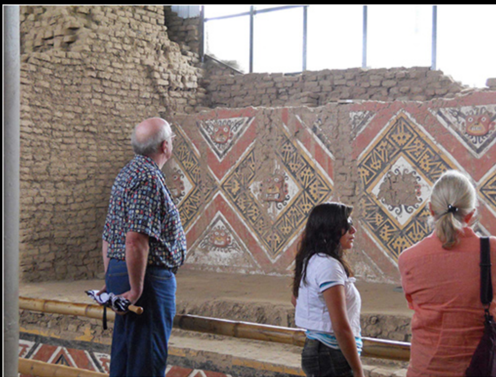
temple of the moon restoration