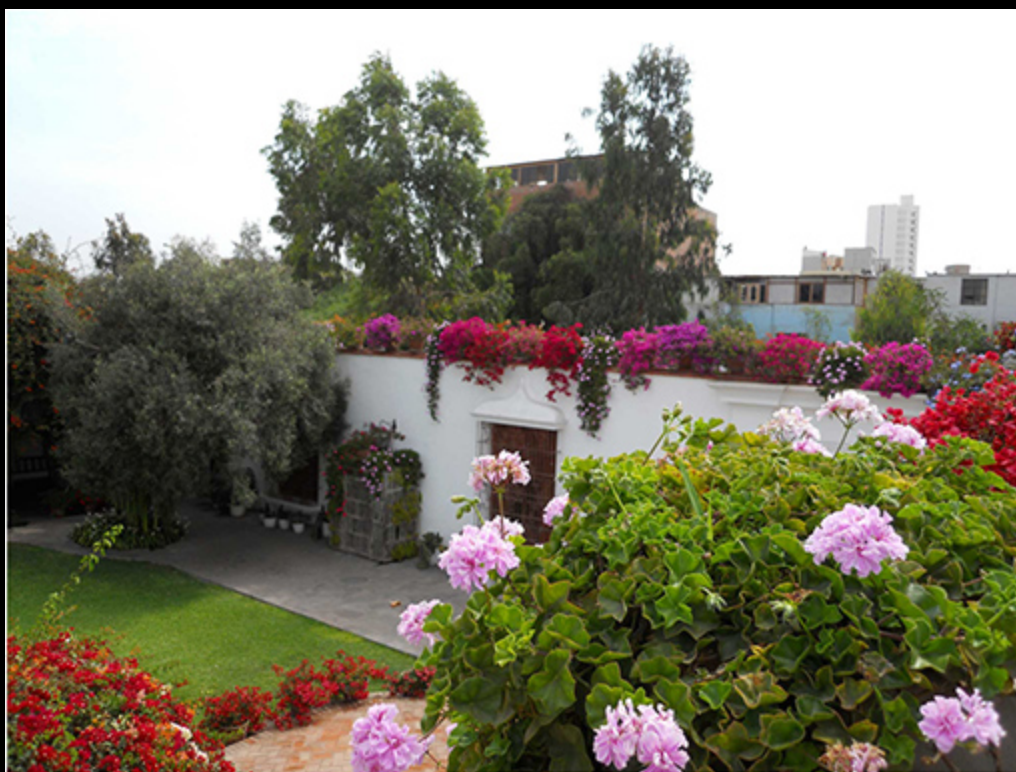
Grounds of Larco museum