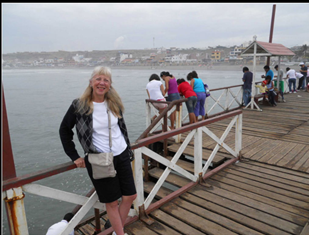
Huanchaco beach pier