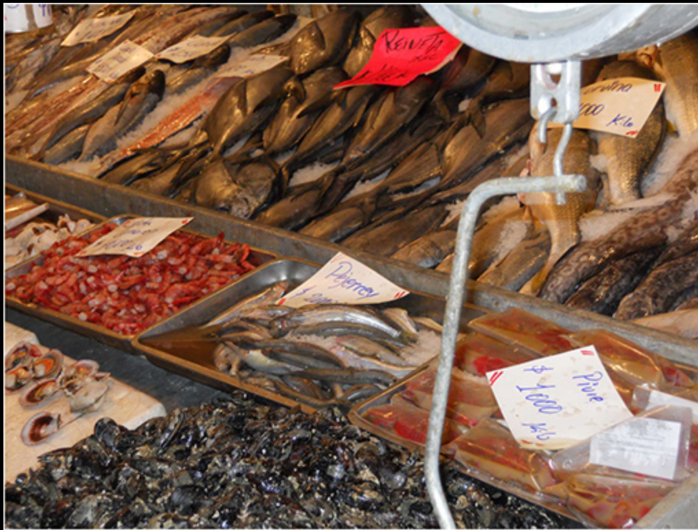
Fish at Santiago Market