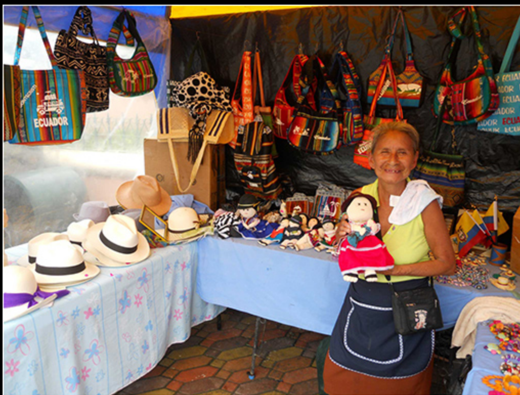
favorite vendor Ecuador