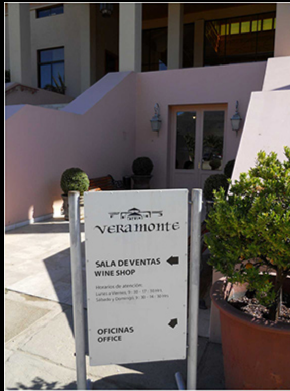
Winery stop heading to the ship from Santiago