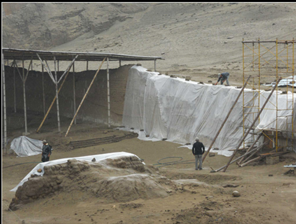
temple of the moon - raining day and covered to protect the restoration