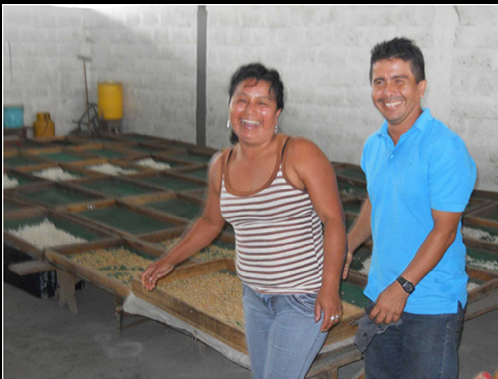
buttons drying and sorting