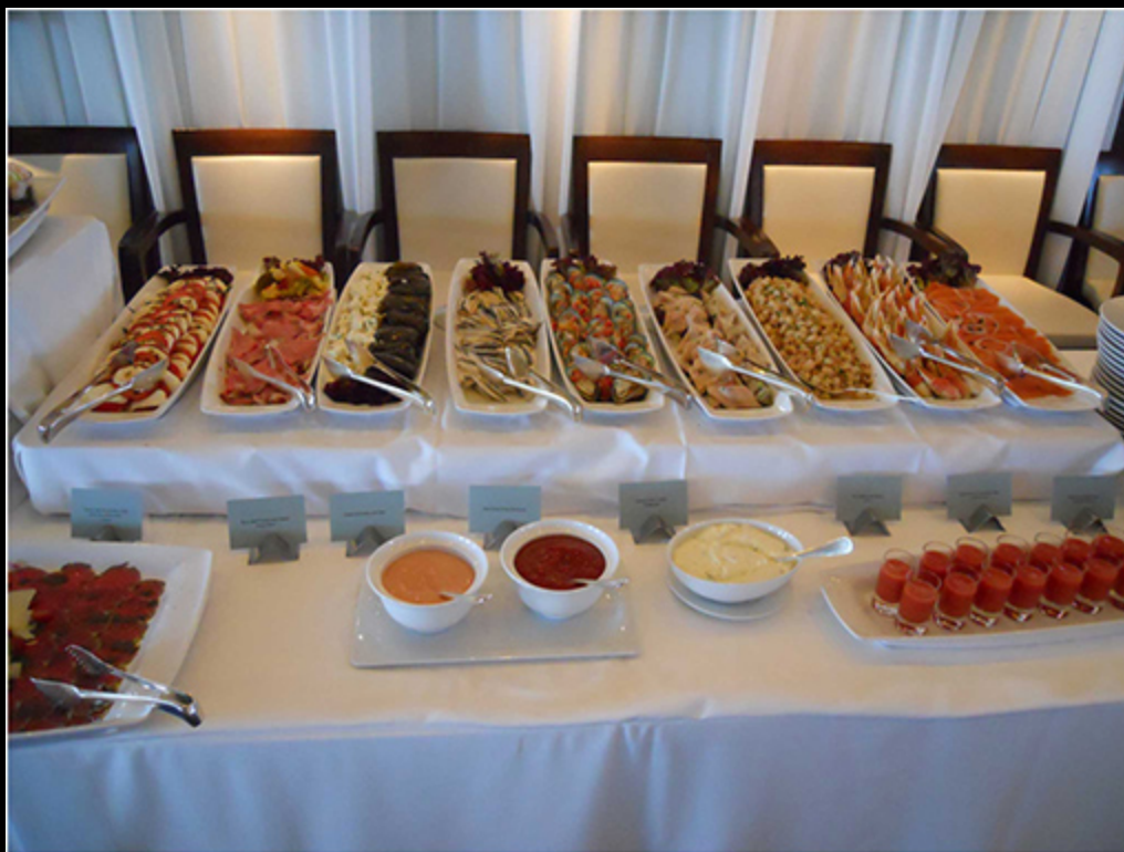
Market Lunch buffet