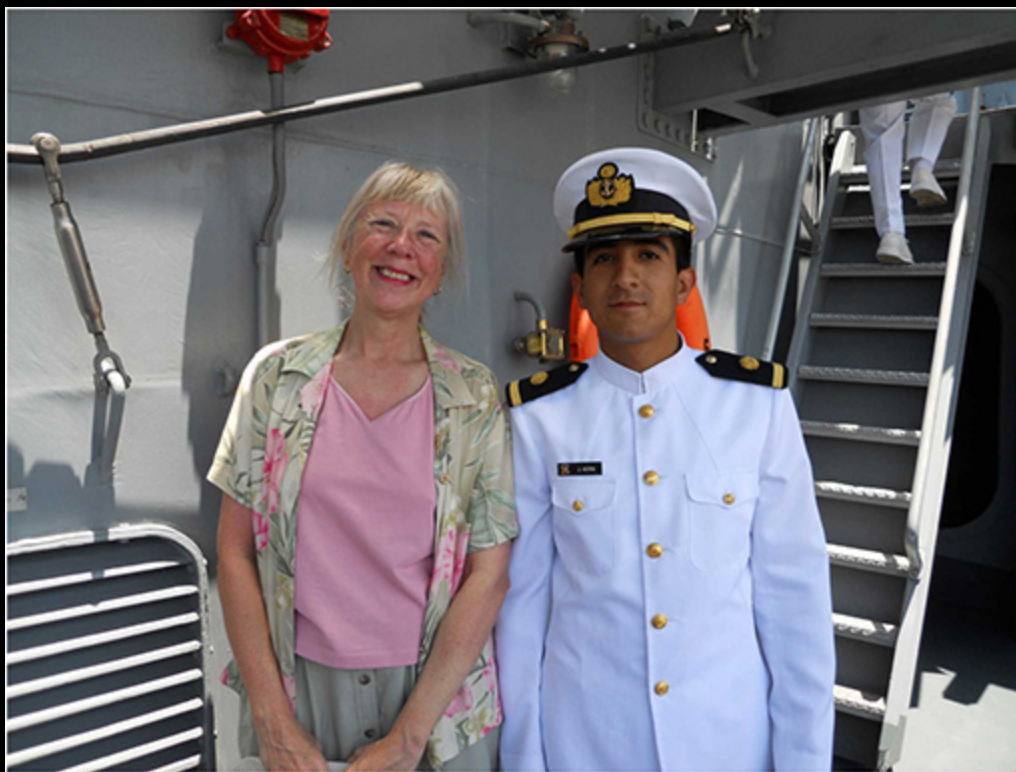
our tour guide