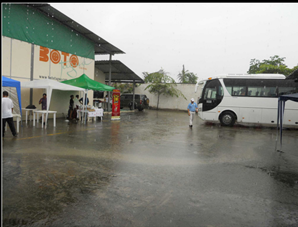
Manta button factory