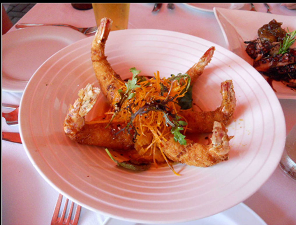
Lima shrimp lunch