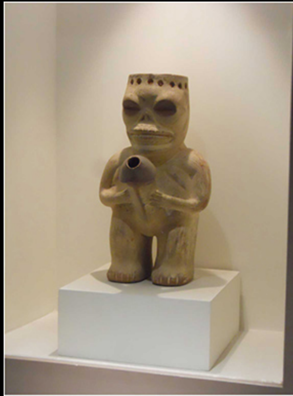
erotic museum piece