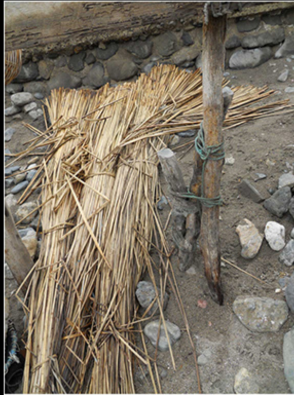
reeds to make boats