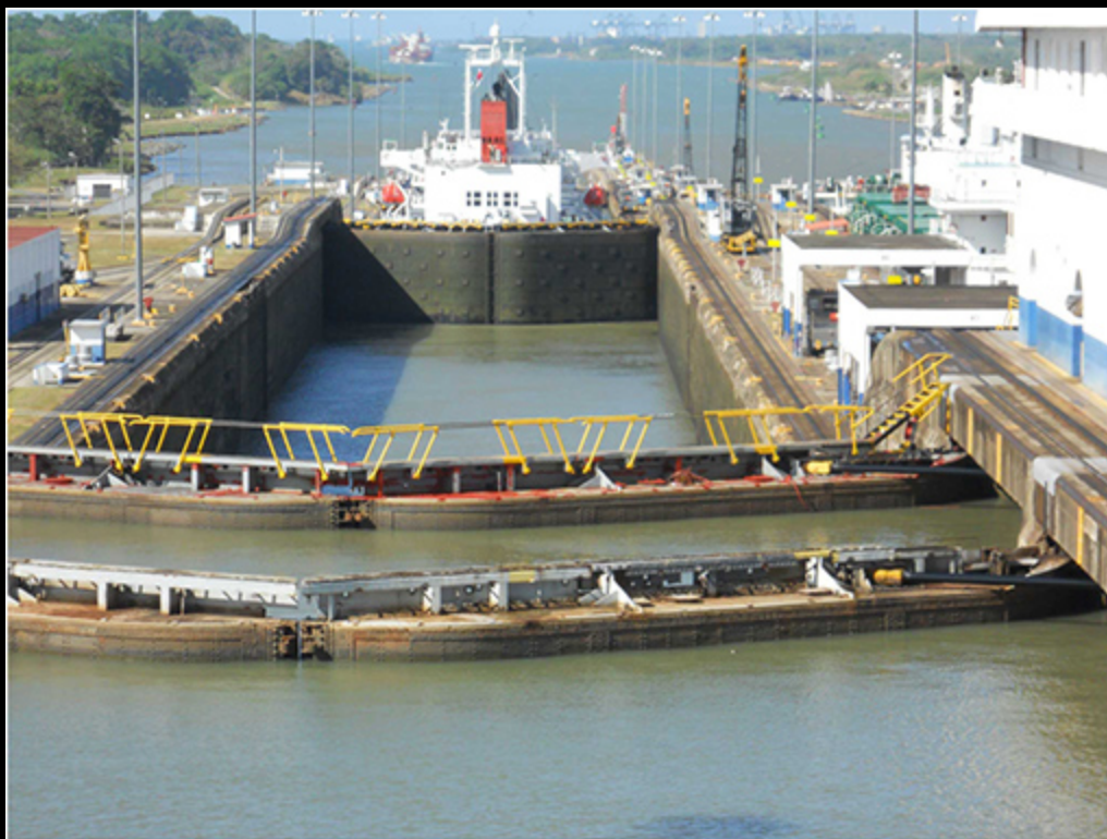
entering locke chamber