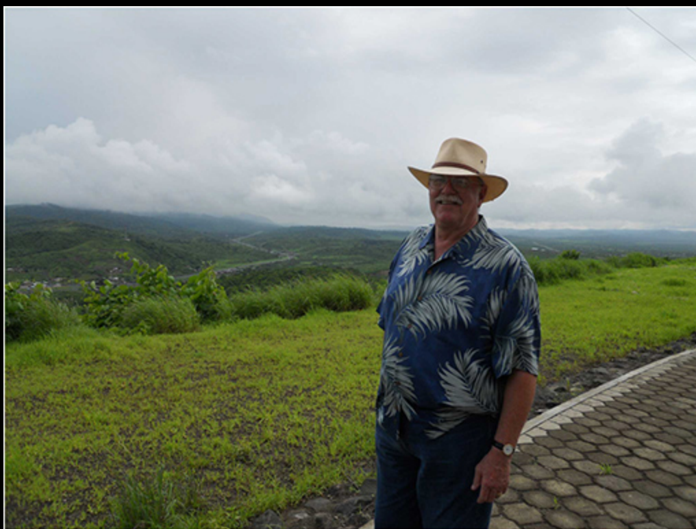
Manta Ecuador countryside