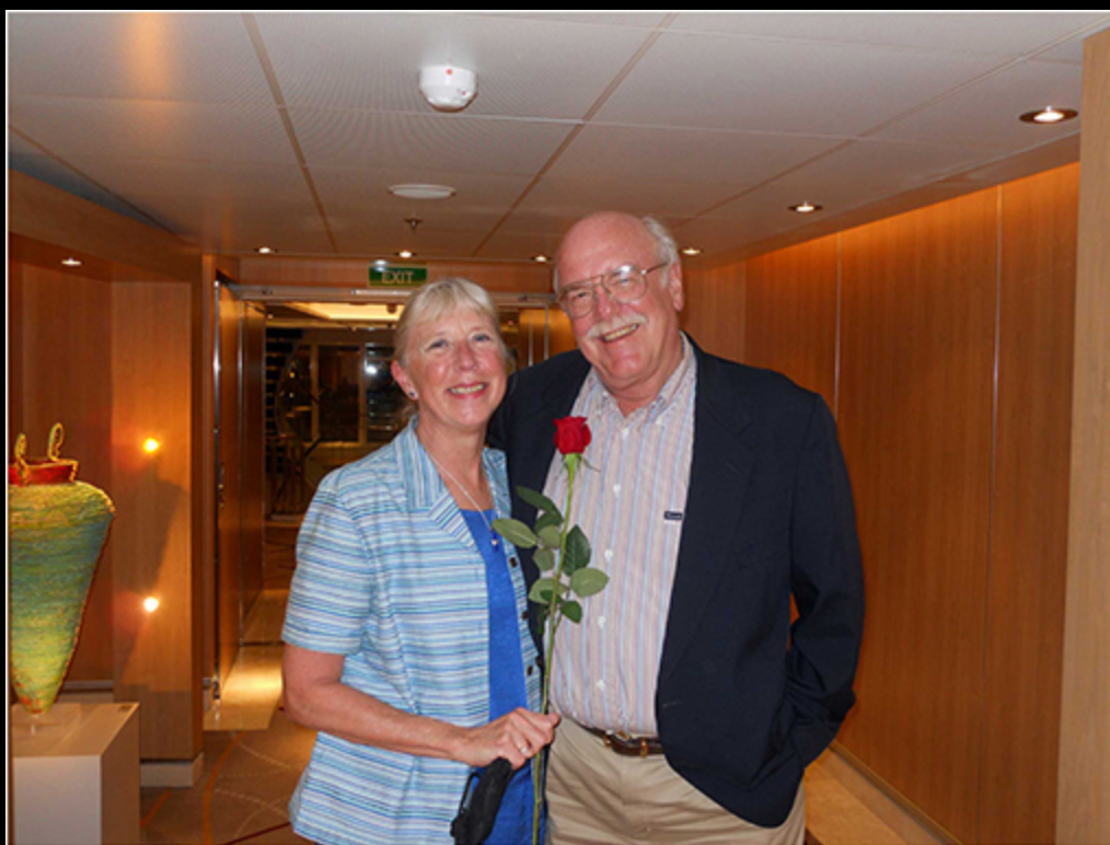
Valentine's day 2012