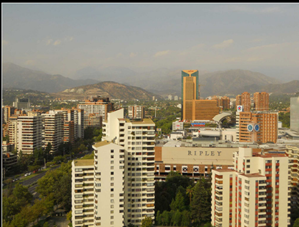
View from our room in Santiago you can almost see the Andes mountains thru the haze