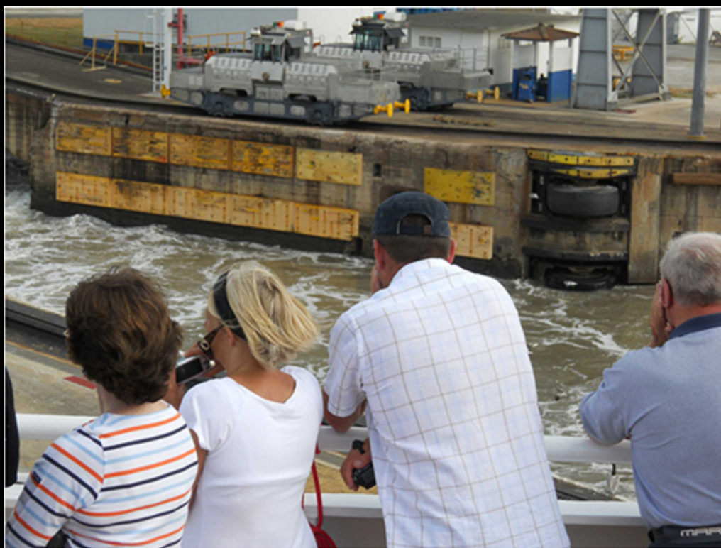
entering the 1st locke