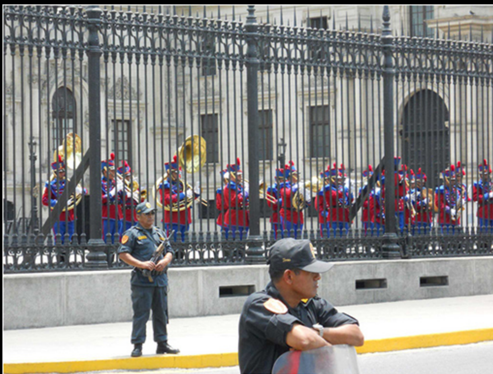
changing of the guard Lima