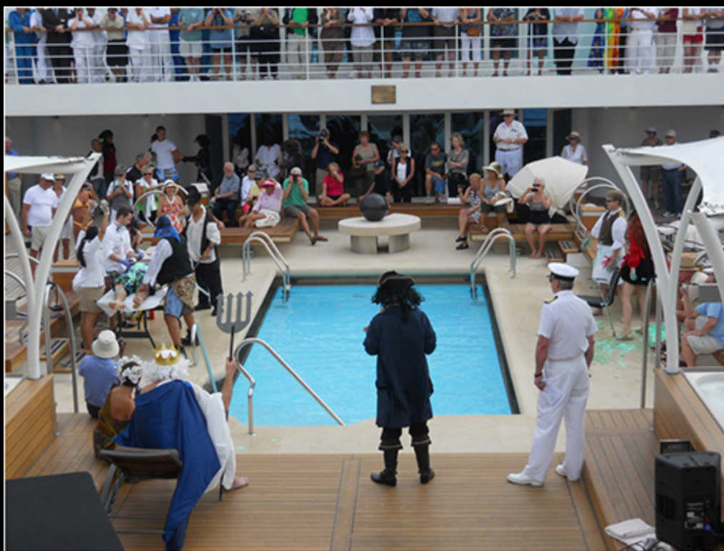
crossing the equator ceremony