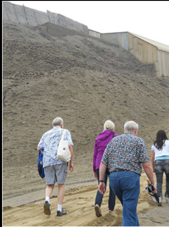
walking to temple of the moon