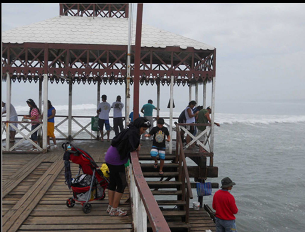
Huanchaco beach pier