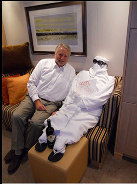
birthday towel man