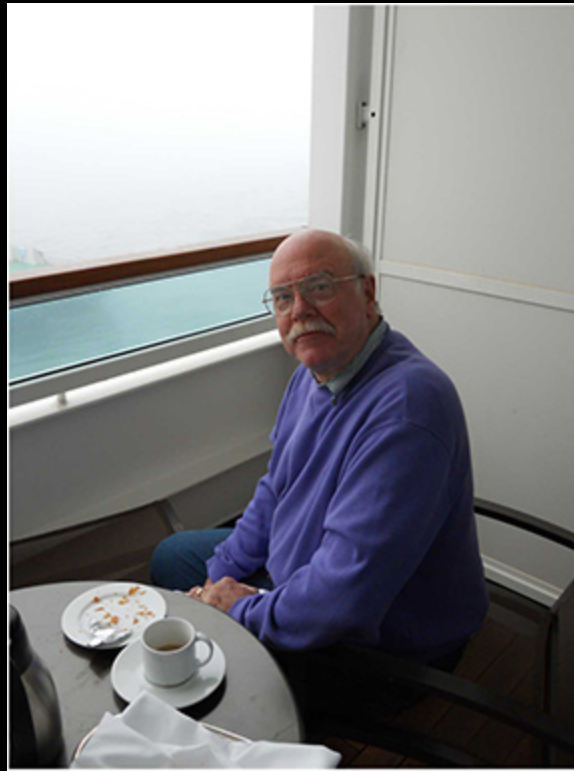
breakfast on our balcony