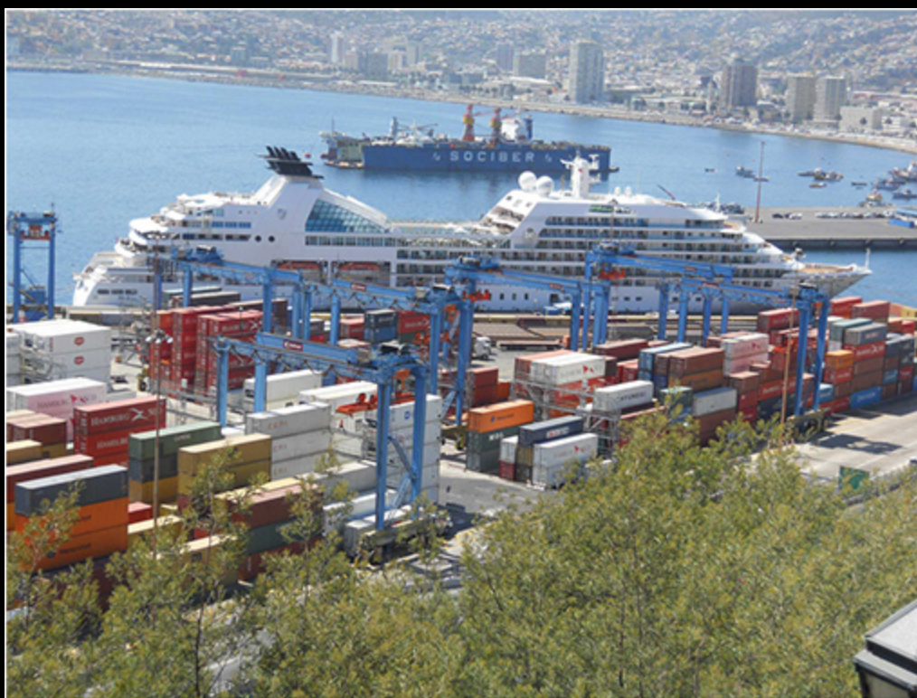
Seabourn Sojourn - our ship