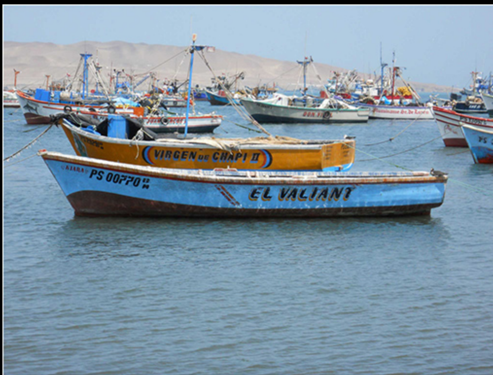
Iquique fishing fleet