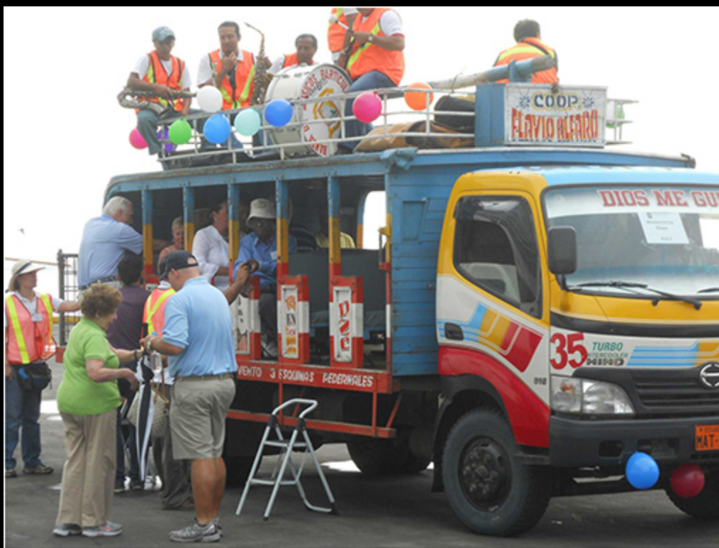
chivas buss - no we didn't ride