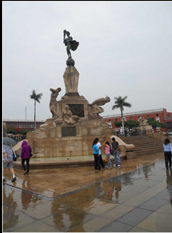
Trujillo town square