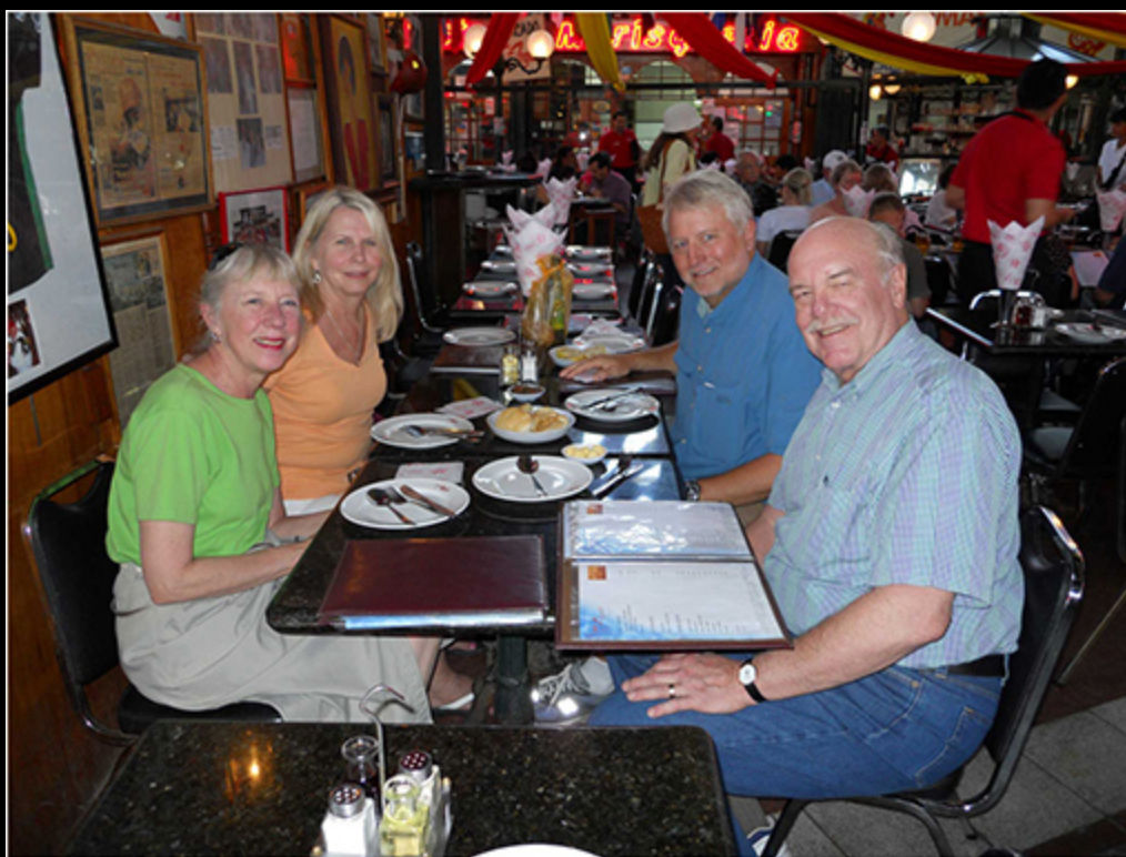
Lunch at Mercado Central