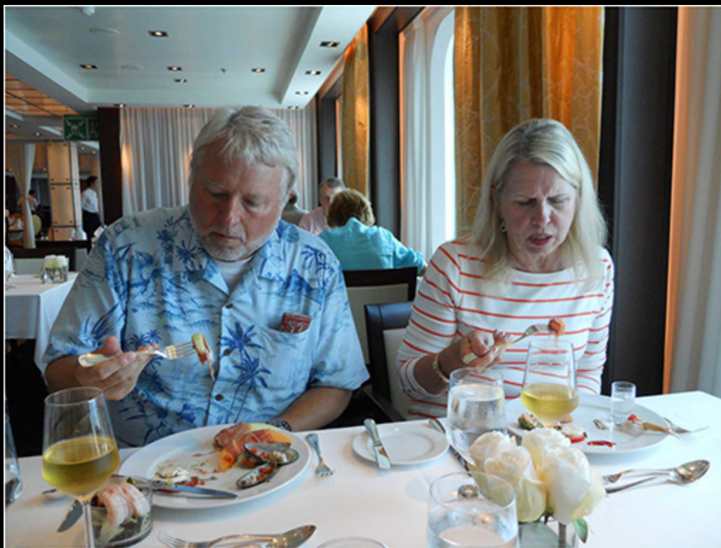
Market Lunch so tasty