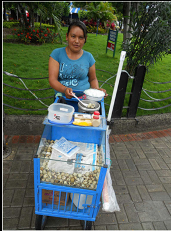
vendor cooking and selling bird eggs