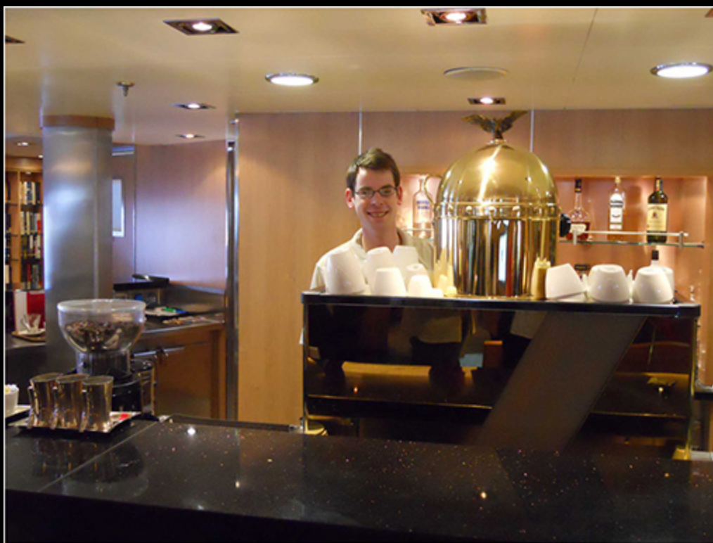
Seabourn Square coffee bar