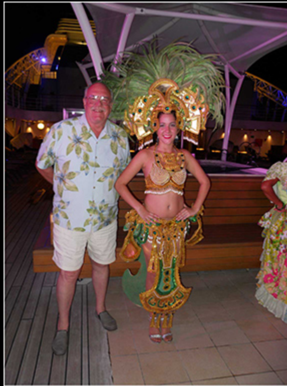
Panama folkloric show