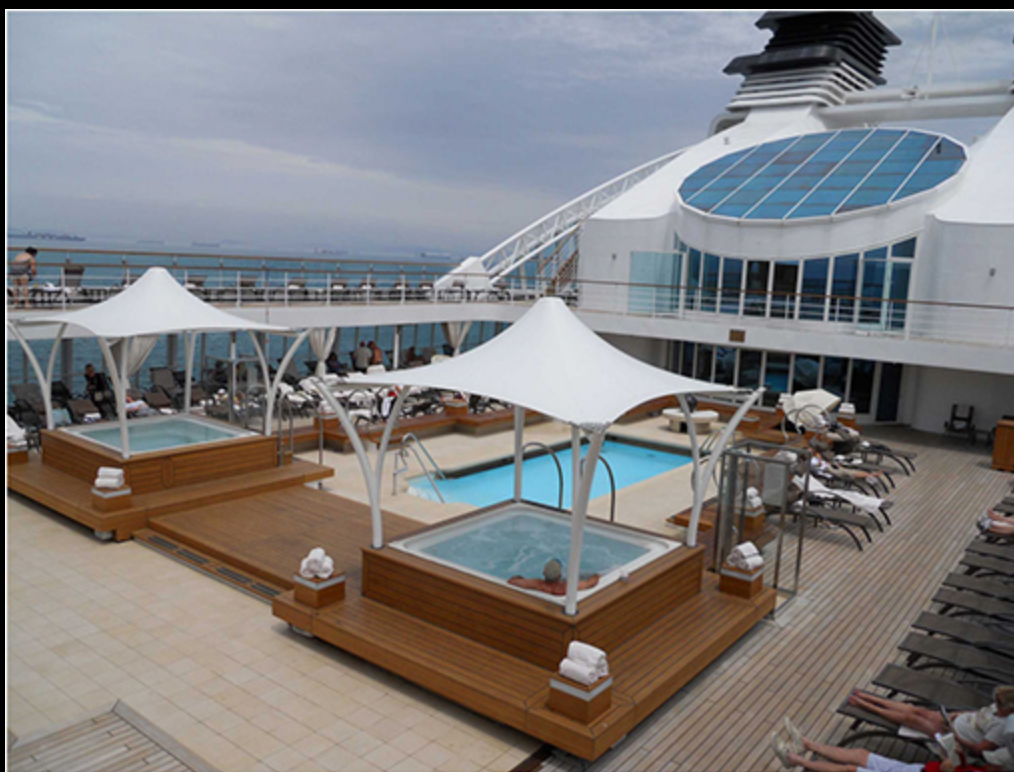
Sojourn pool deck