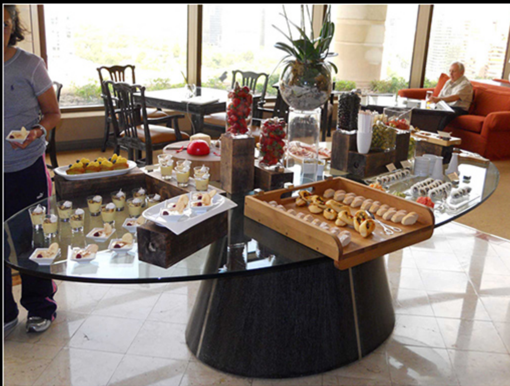
Afternoon nibbles at Grand Hyatt