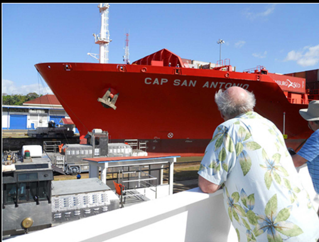
boat entering locked next to our ship