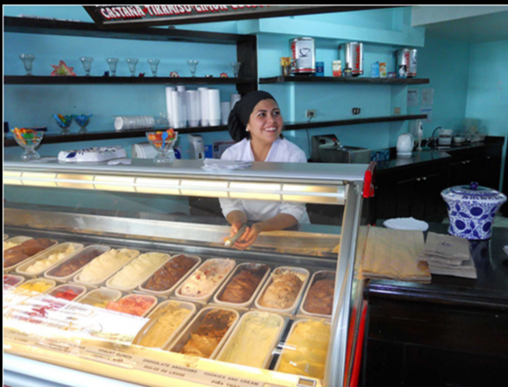
Ice Cream Santiago - I picked Rose