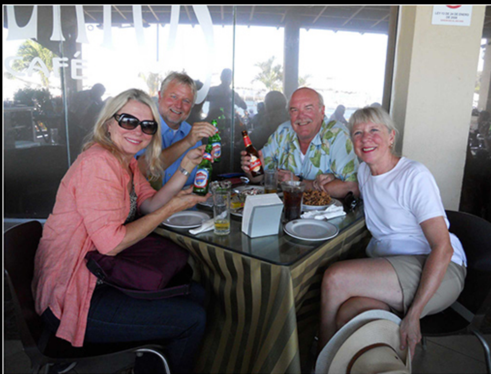
refreshments at the Panama pier