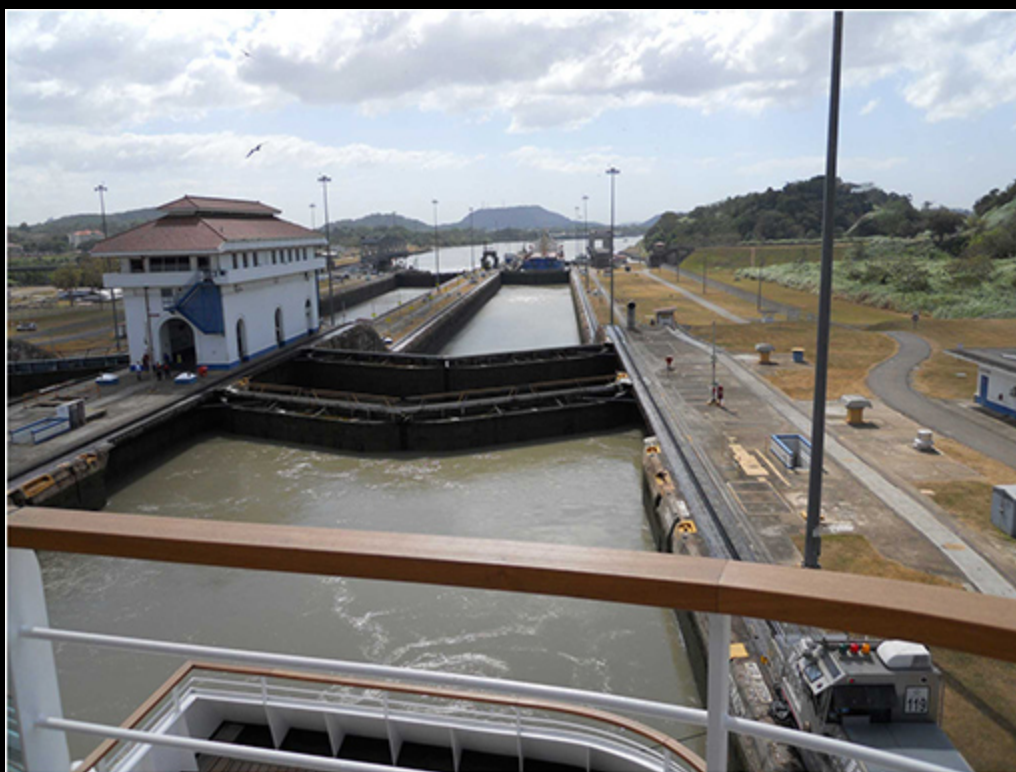
moving through chamber of locke