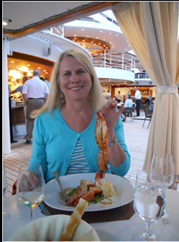
Nigerian shimp our favorite