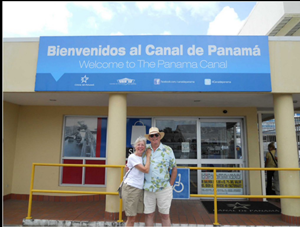
Panama canal tourist senter