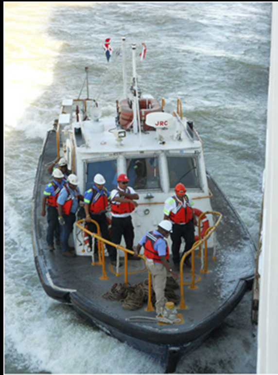
crew who helped us through the lockes