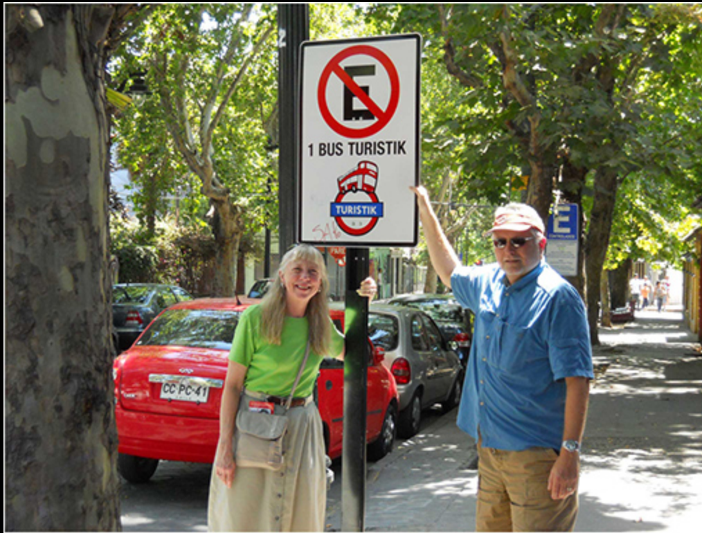
Hop on Hop off bus stop Santiago