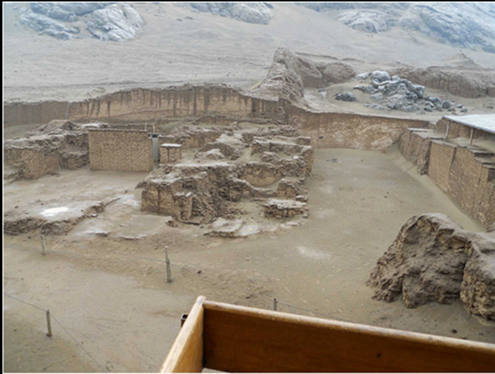
temple of the moon