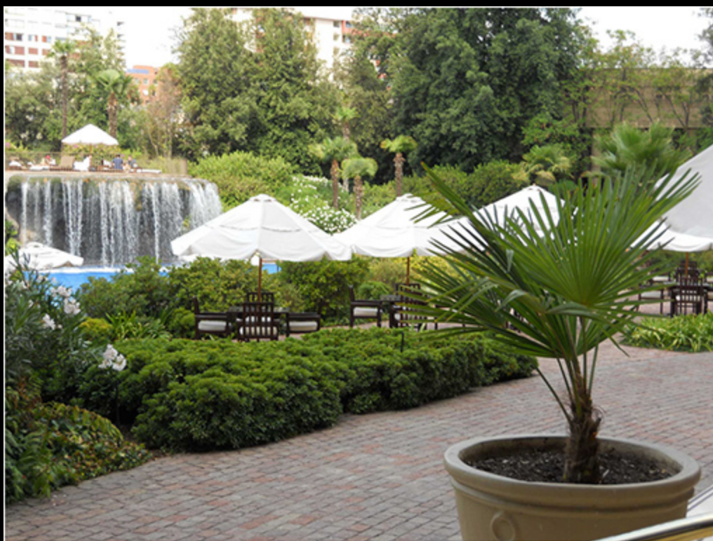
Grand Hyatt Santiago