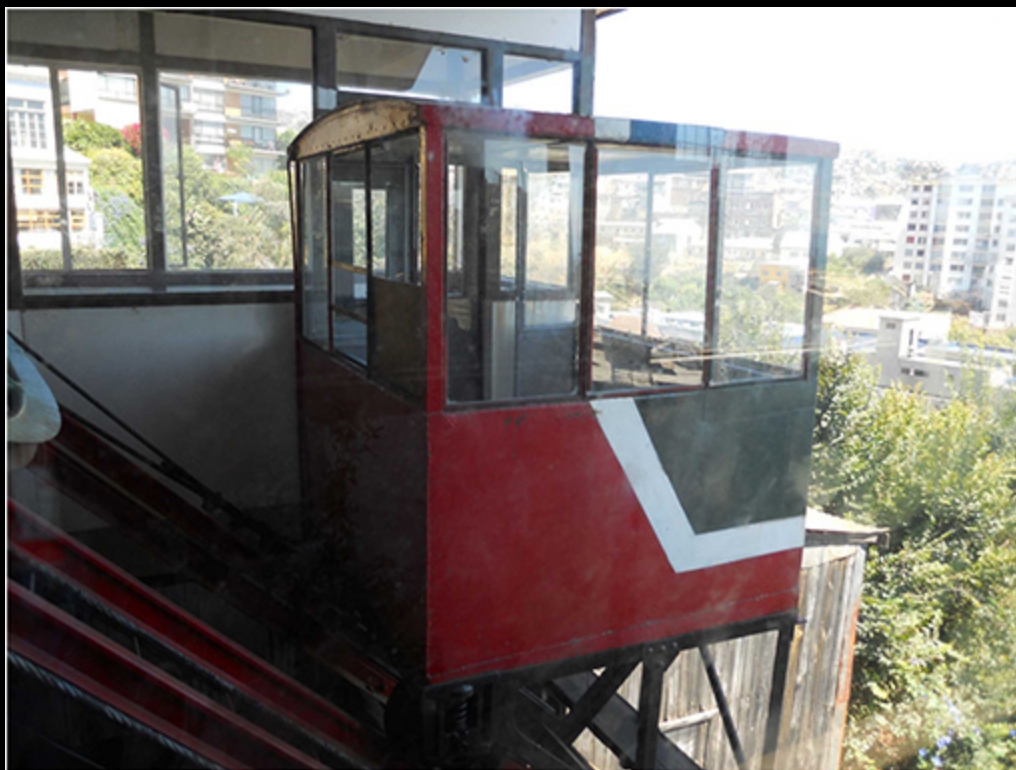
Funicular - Vina del Mar, Chile