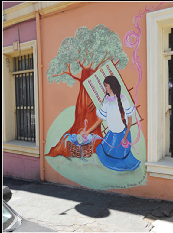
Graffiti in Vina del Mar