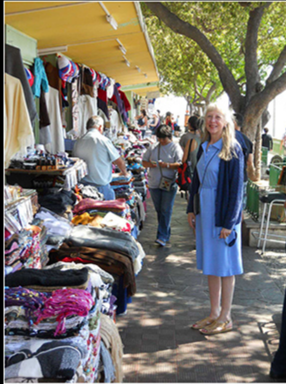
Vina del Mar shopping