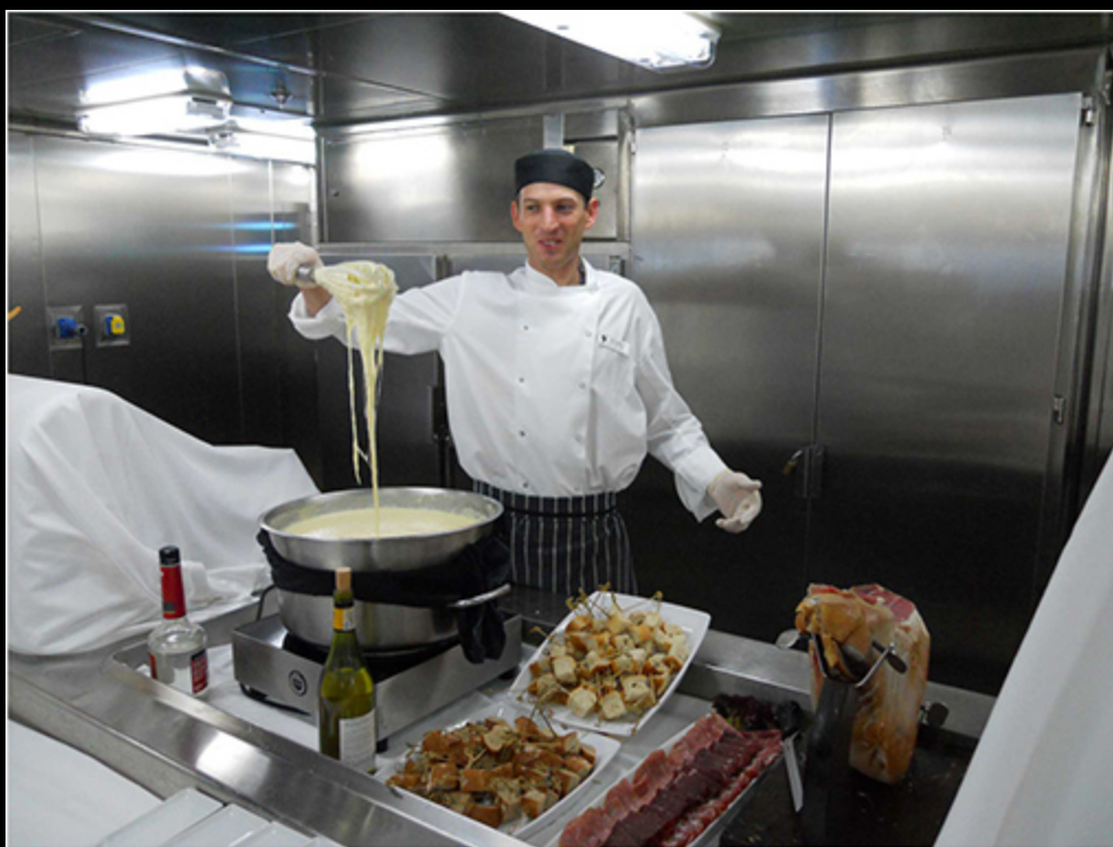
Market Lunch station