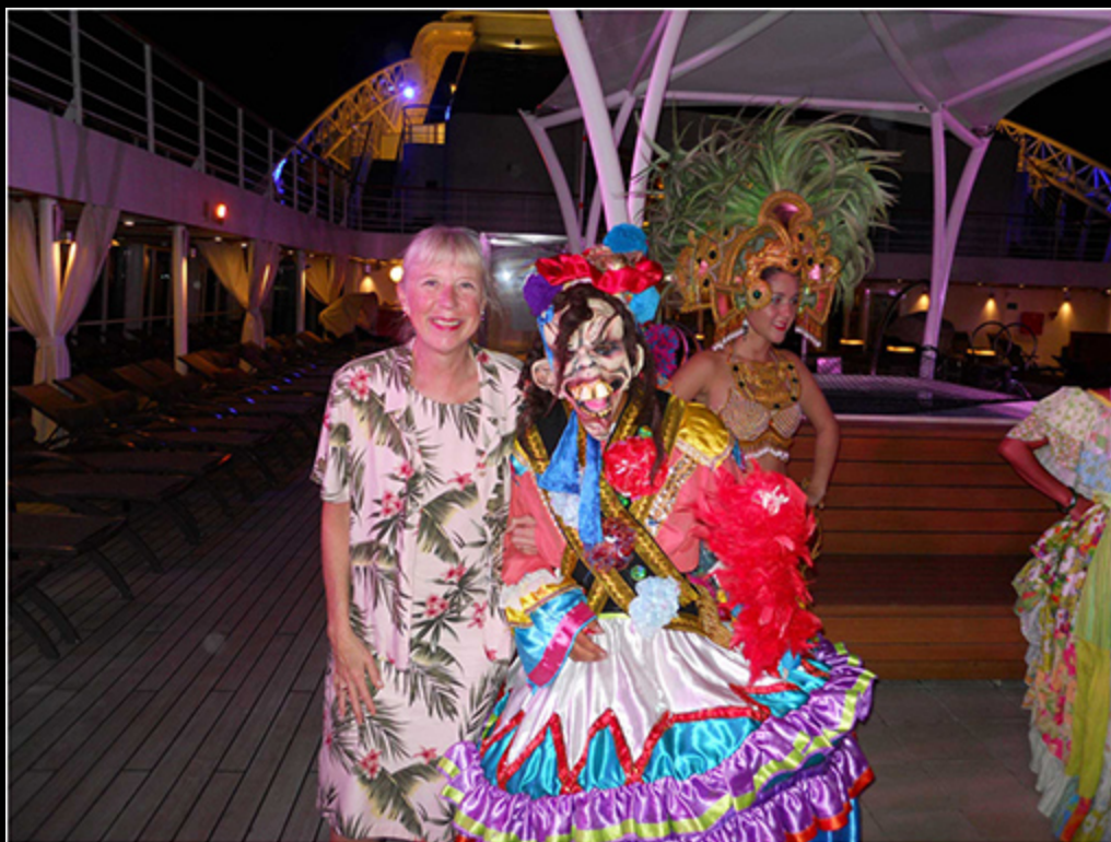
Panama folkloric show