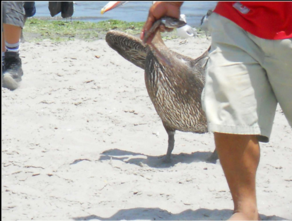
Pelican being nabbed by a local so he could charge people for pictures with it.