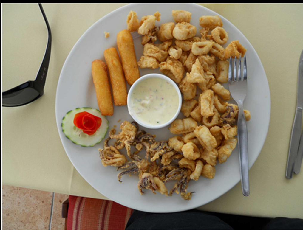
calimari - soooooooo good