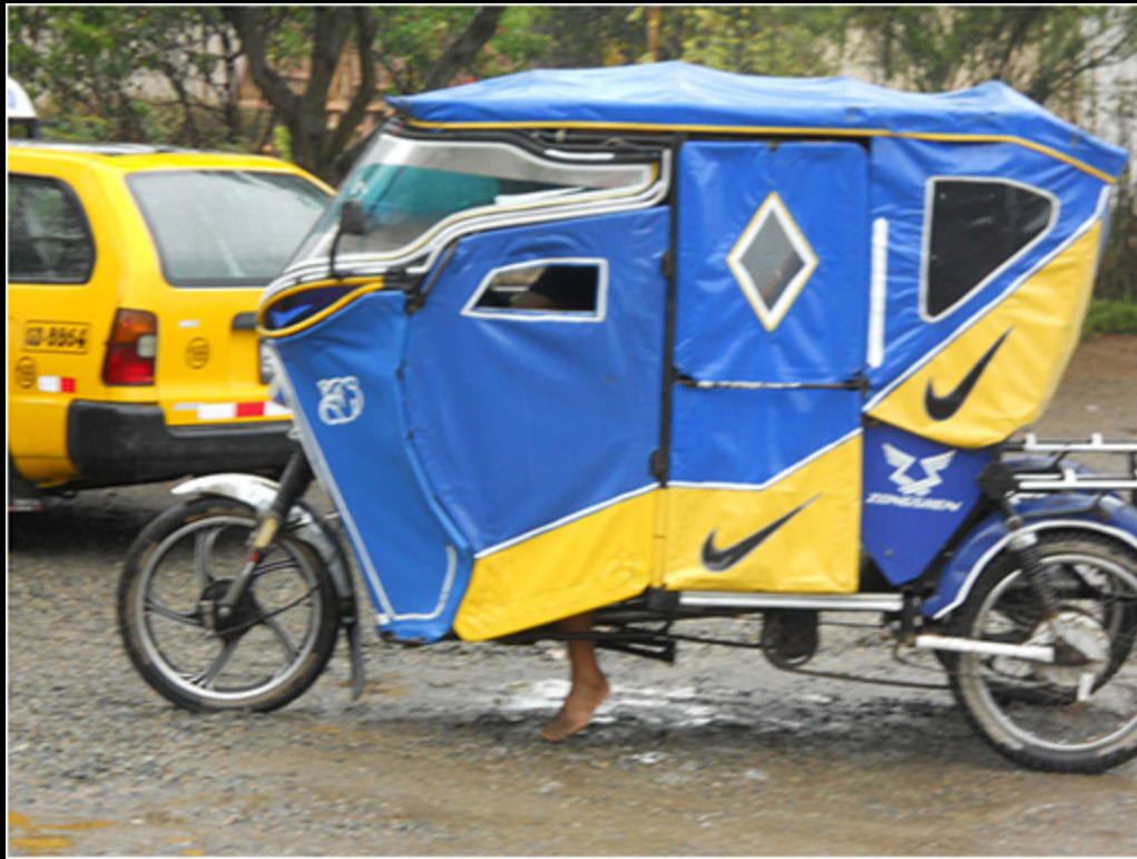
Trujillo local transportation