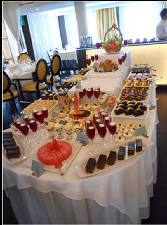
Market Lunch dessert table