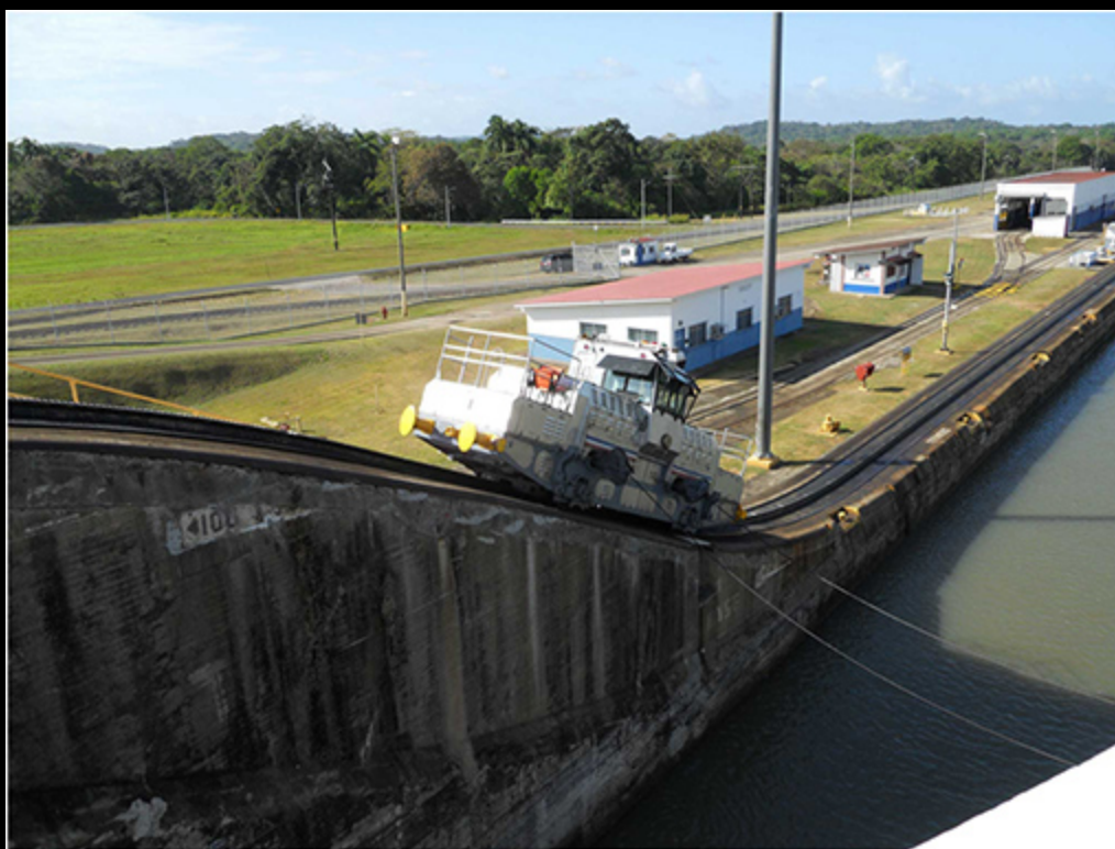
donkey helping us through locke