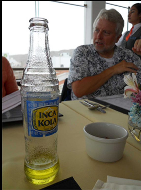
Inca Kola - bubble gum taste