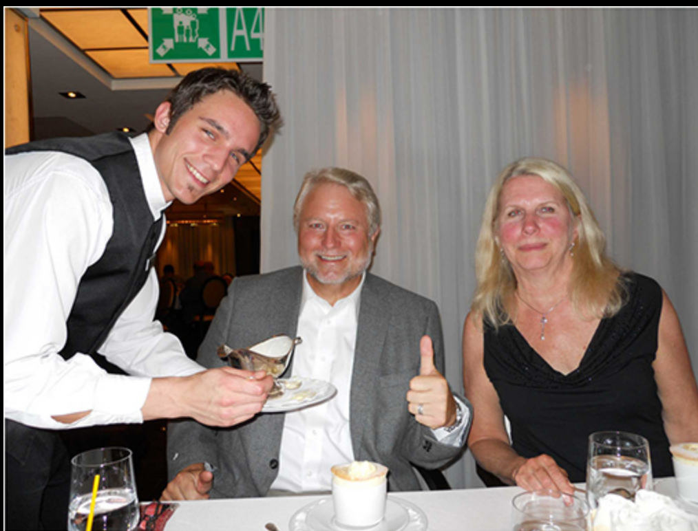
Grand Mariner souffles for dessert