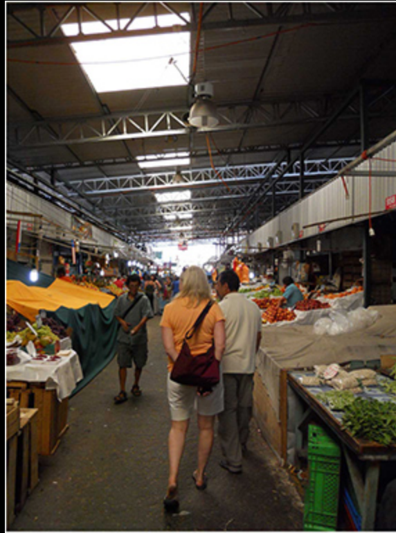
Mercado Cental Santiago