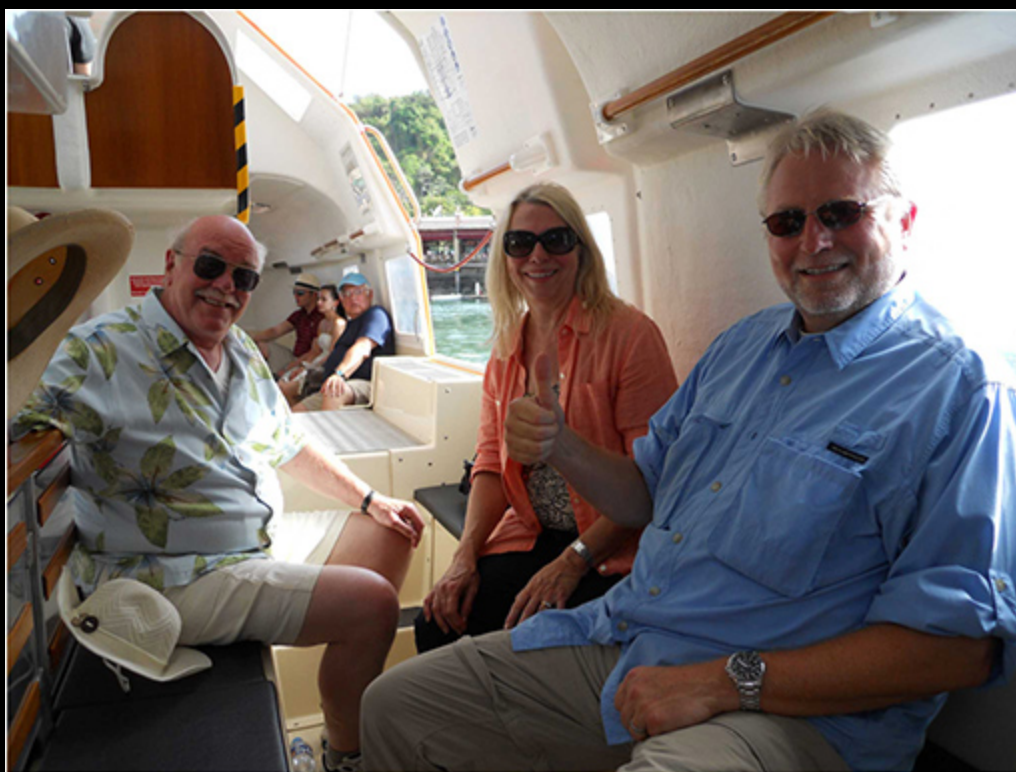
tender boat in Pamana