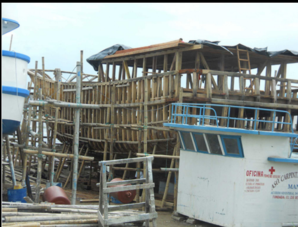
boat building Manta, Ecuador