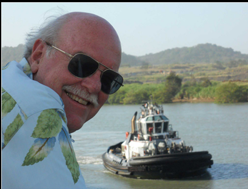
tug to help ship through the Panama canal