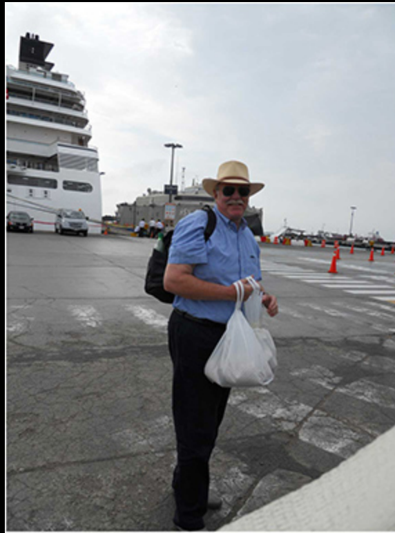
back to the ship