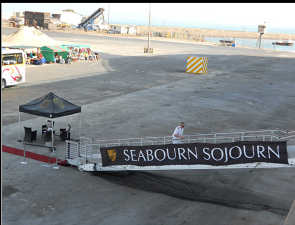
captain needs to board!