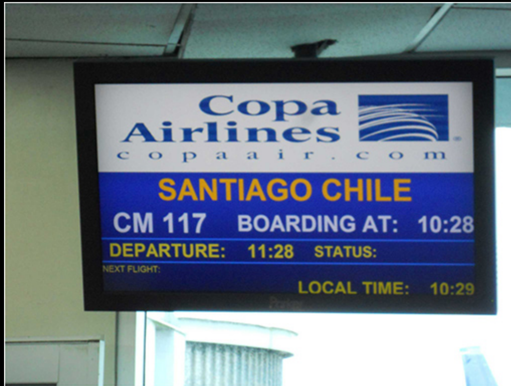
From Miami to Santiago via Copa Airlines