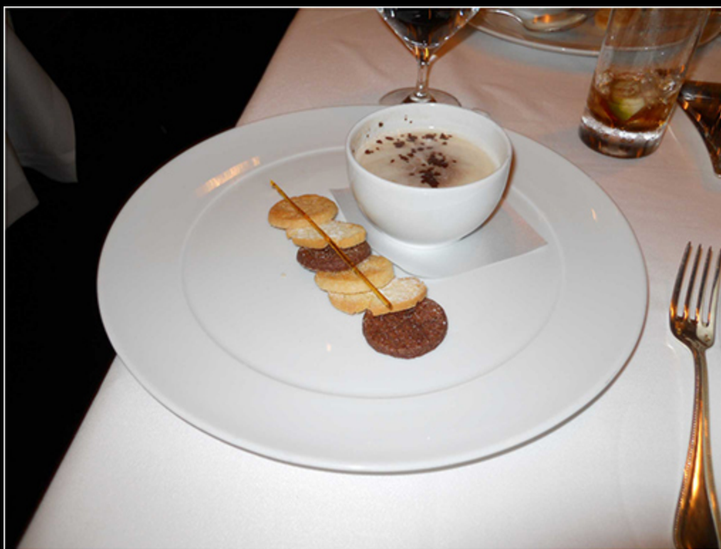
cocoa and cookies dessert