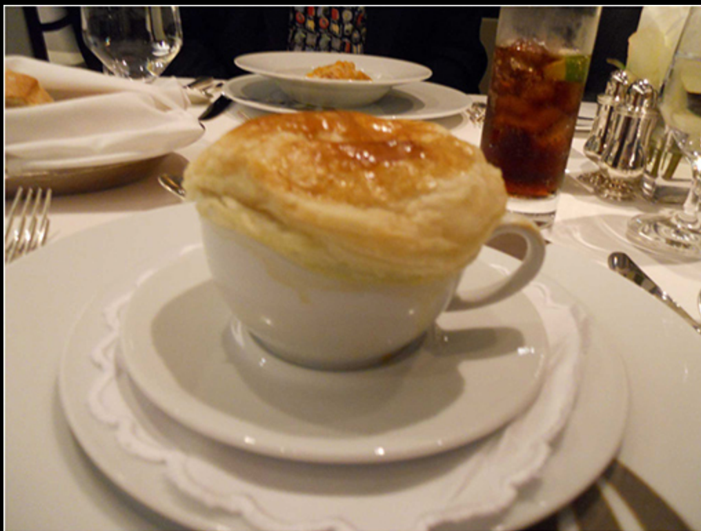
soup en coute