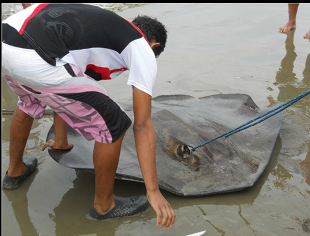
skate caught by Manta fisherman