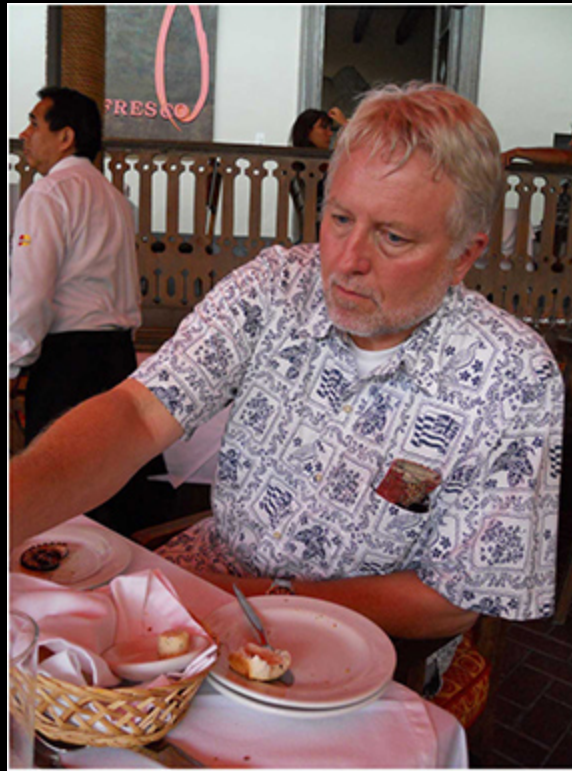
Lunch in Lima