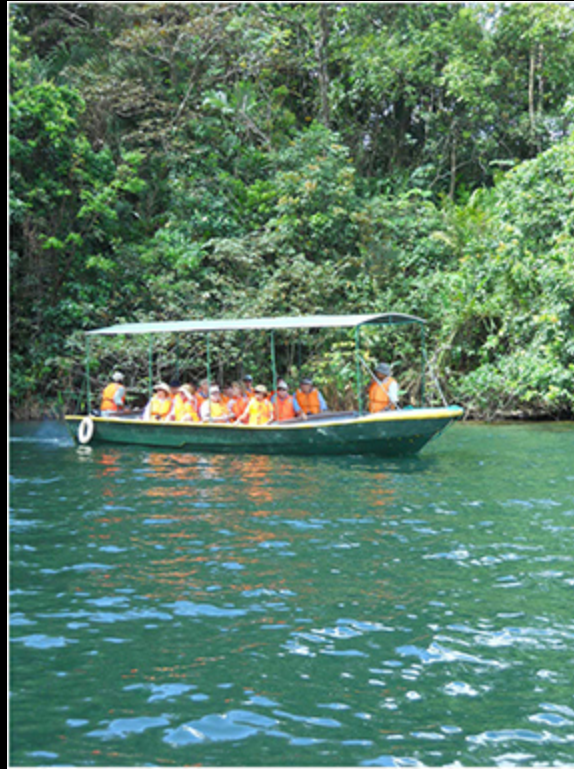
tour of Gatun Lake