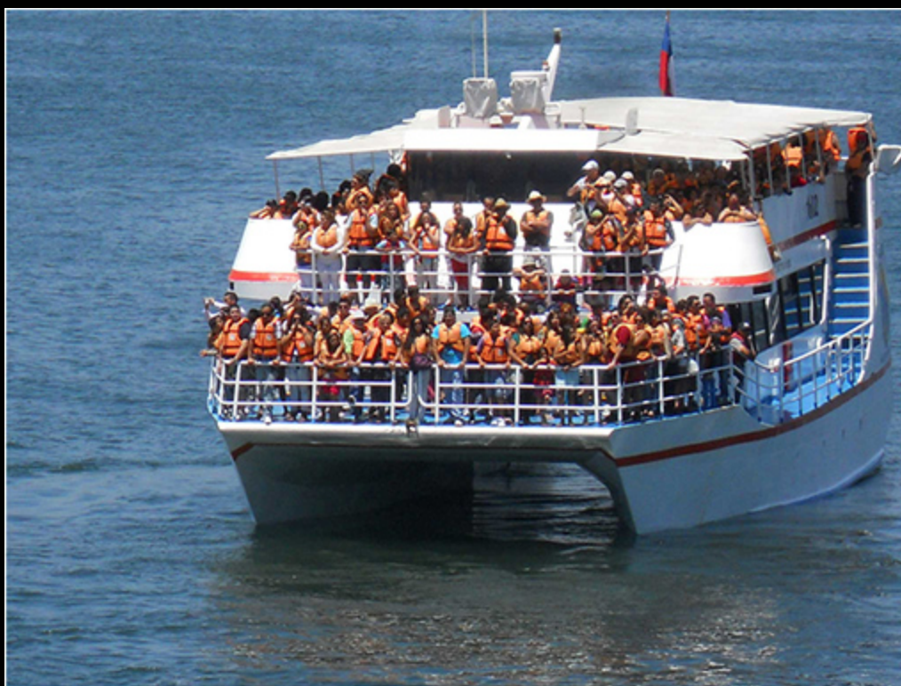
Local tour boat curious to get a look at our ship