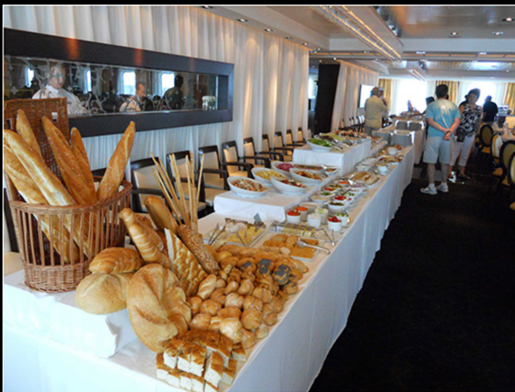
Market Lunch buffet