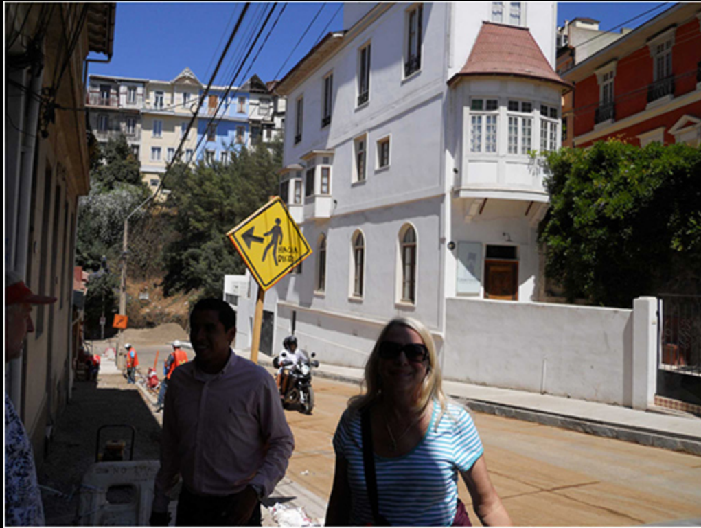
Vina del Mar, Chile