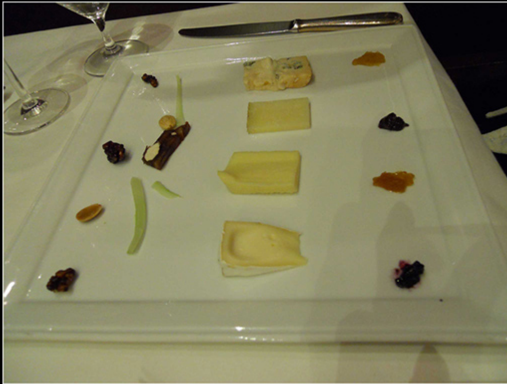
Evening cheese plate selection