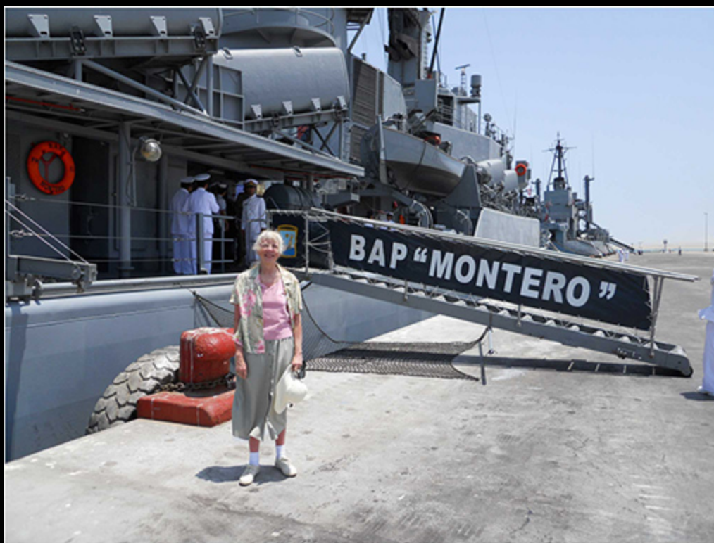
open house for Peru navy