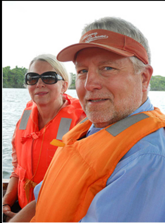
Gatun Lake Panama excursion