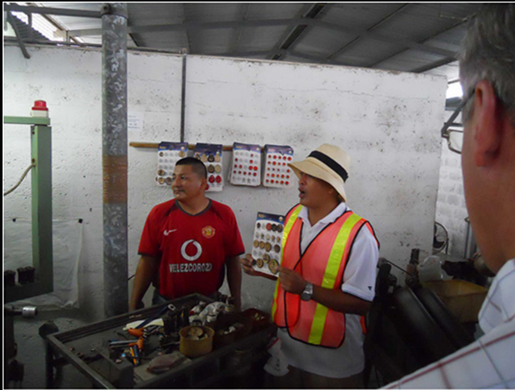
Tagua nut button factory