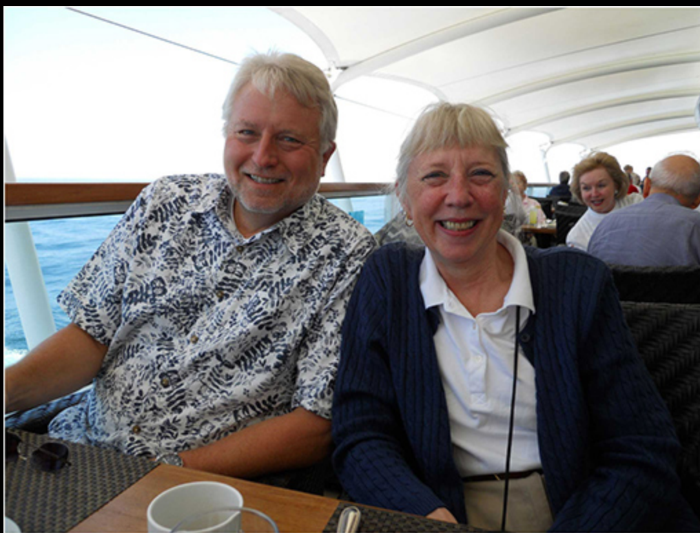
brother and sister