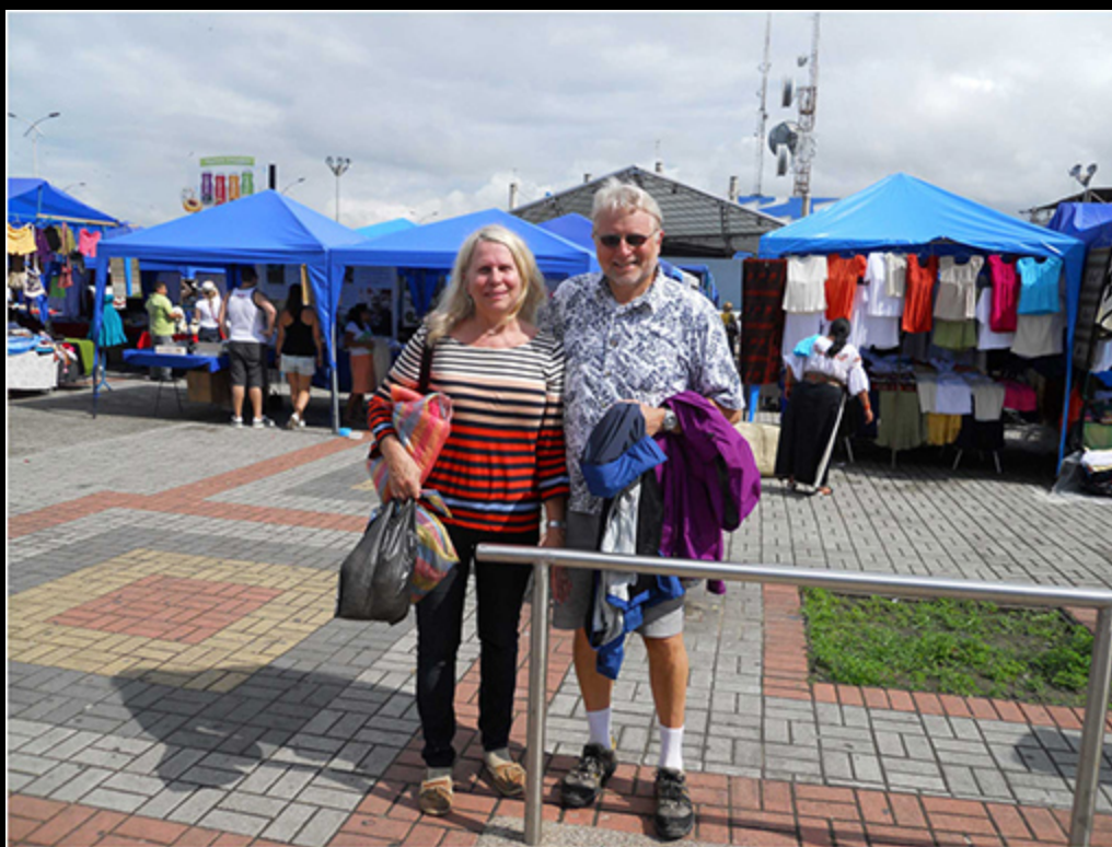
great shopping in Manta