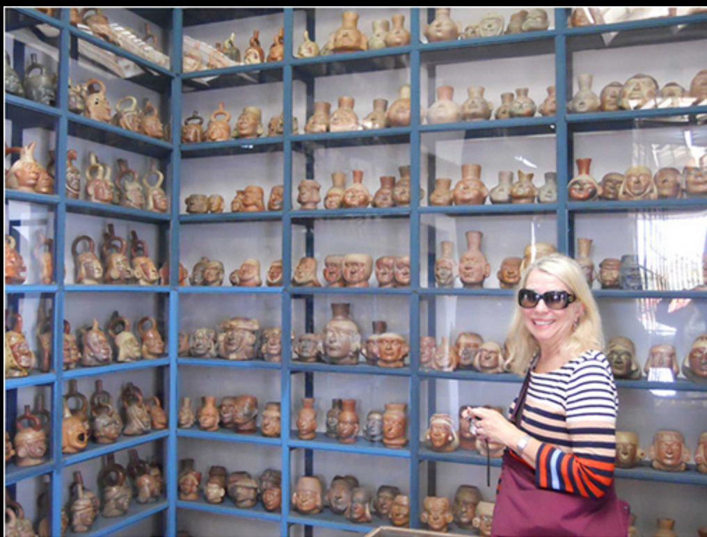
Larco museum storage