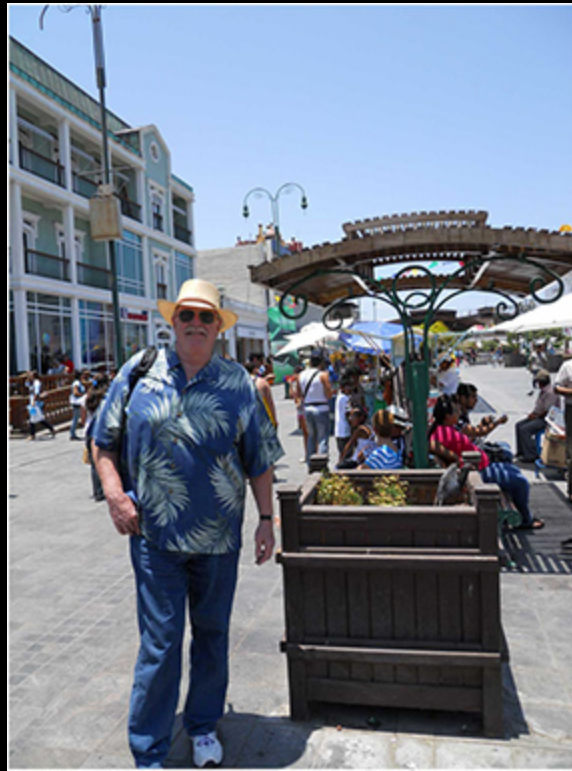
Iquique Chile market