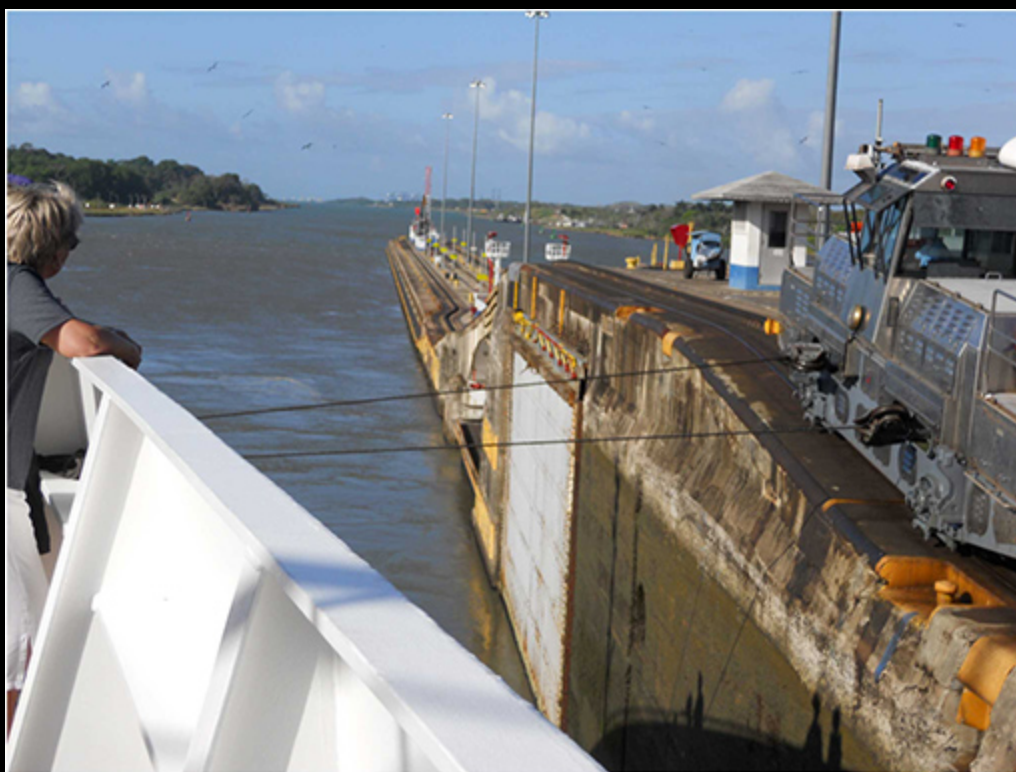
moving out of locke