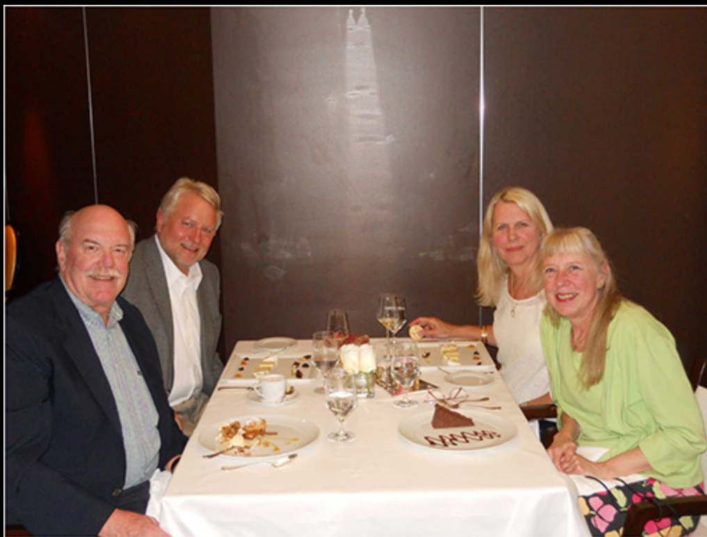
A handsome group