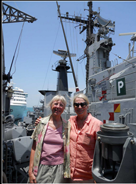
Peru naval vessel tour