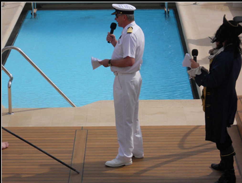
captain at the crossing the equator ceremony