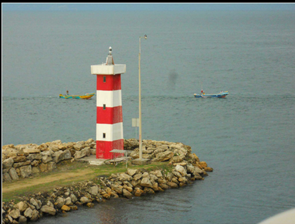
leaving Manta, Ecuador