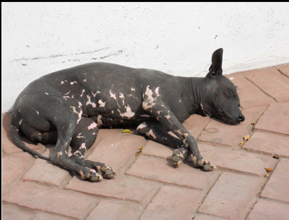
Hairless Peruvian Dog