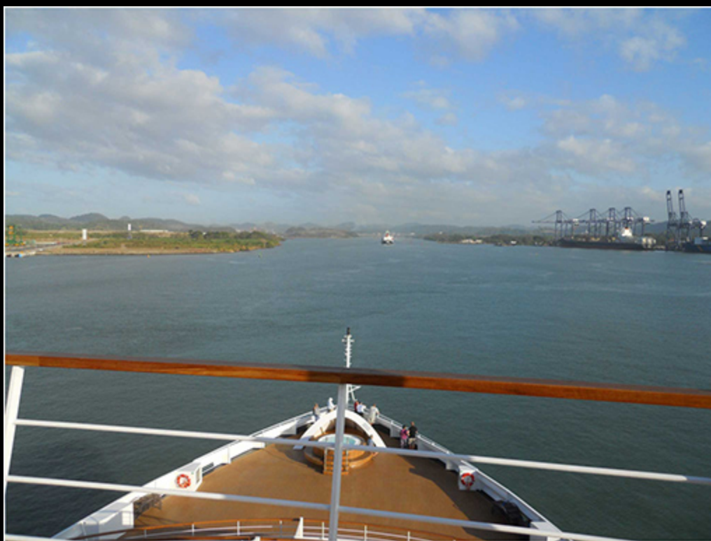
heading to the Panama canal