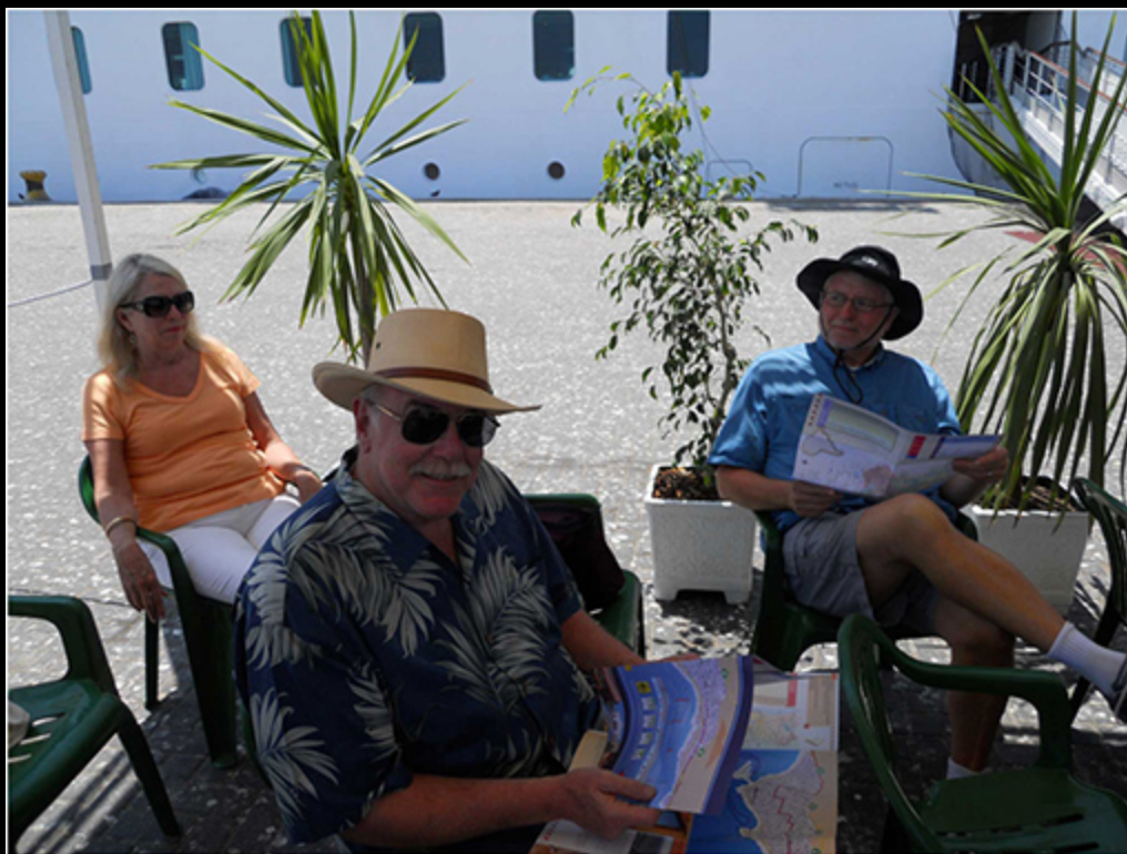
waiting for the shuttle