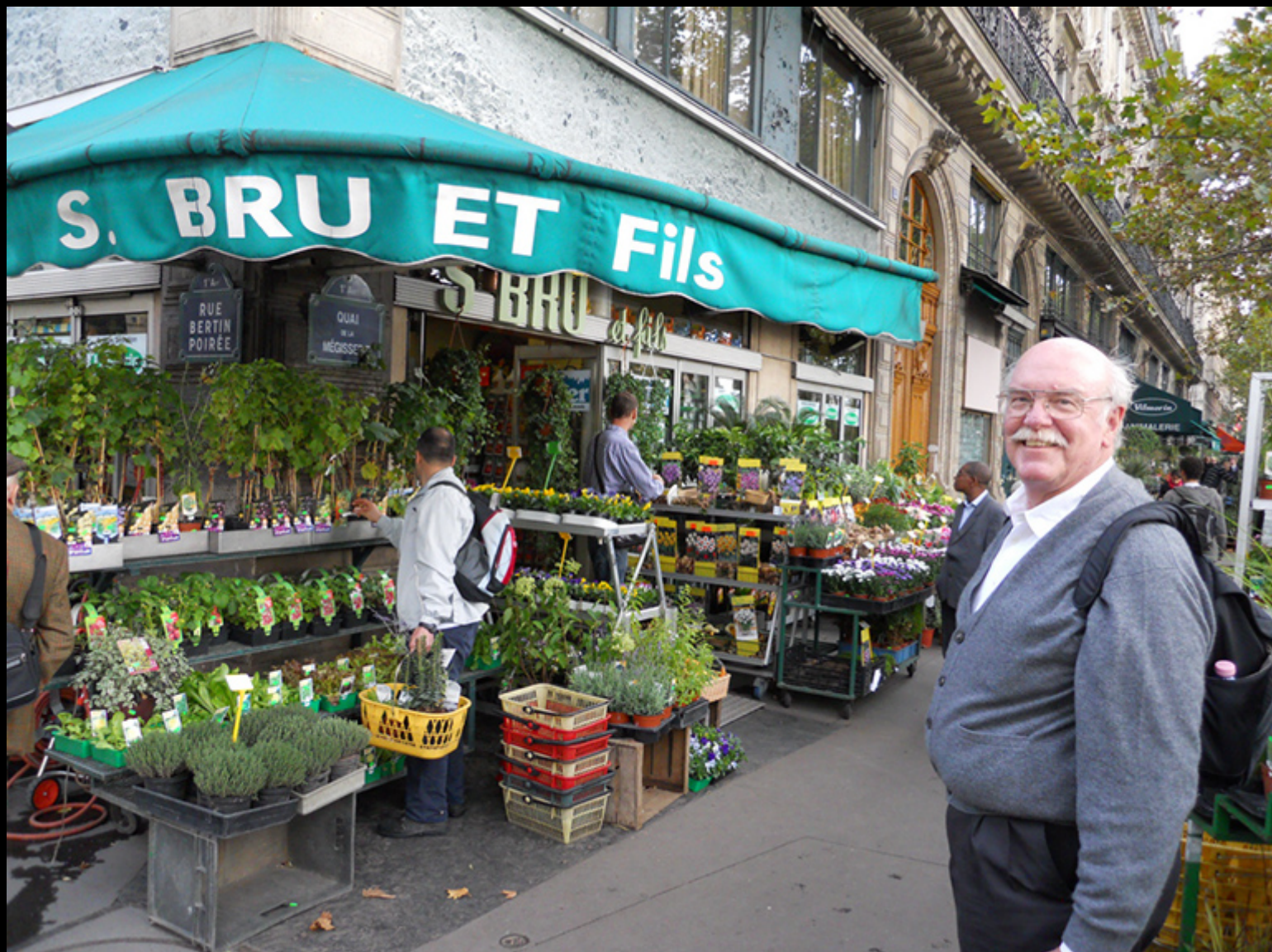
Seed Shop Parid