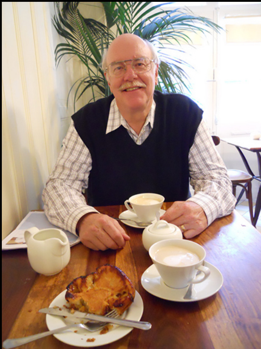
Coffee at Grain de Vanille Concale France