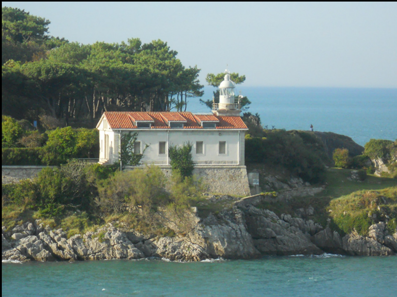
Leaving Bordeaux 3