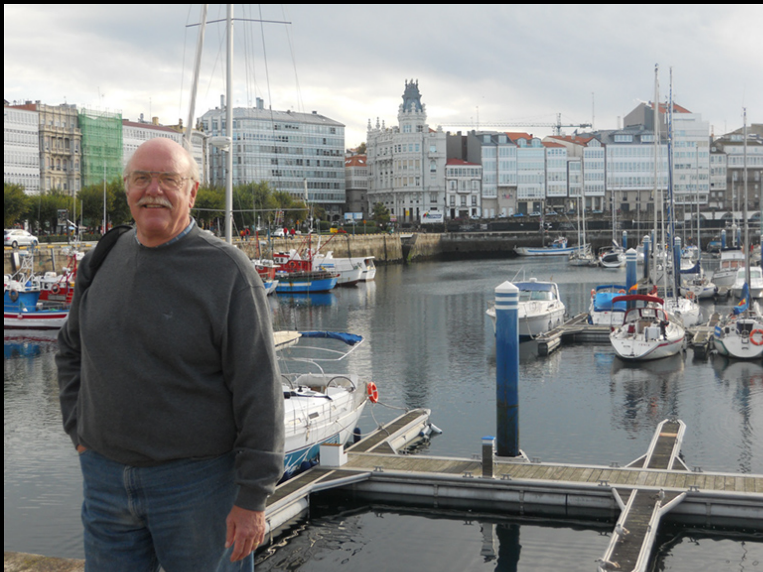
La Coruna harbor 2