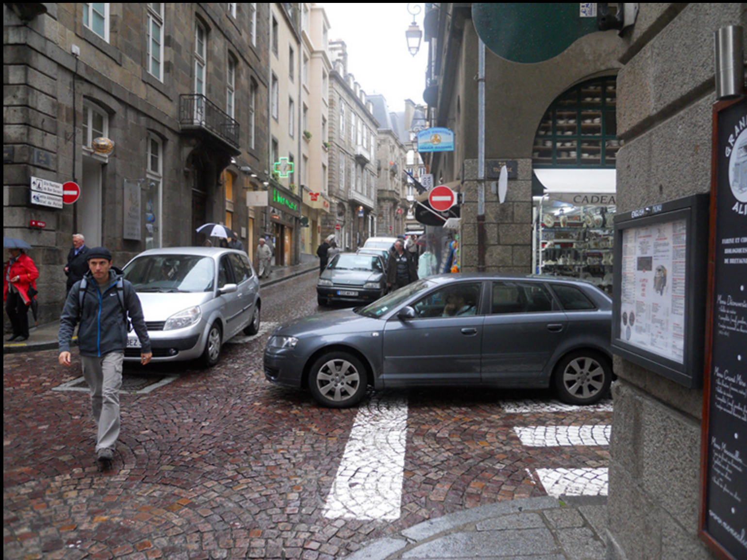
St Malo France