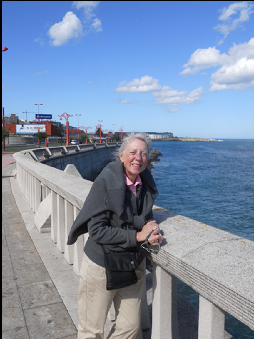
Walking La Coruna Spain