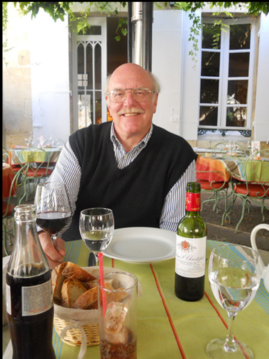
St Emillion Lunch