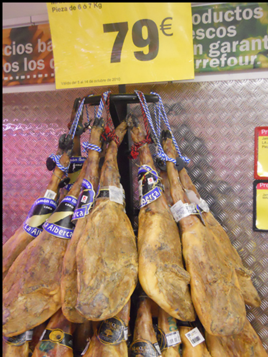
La Coruna shop