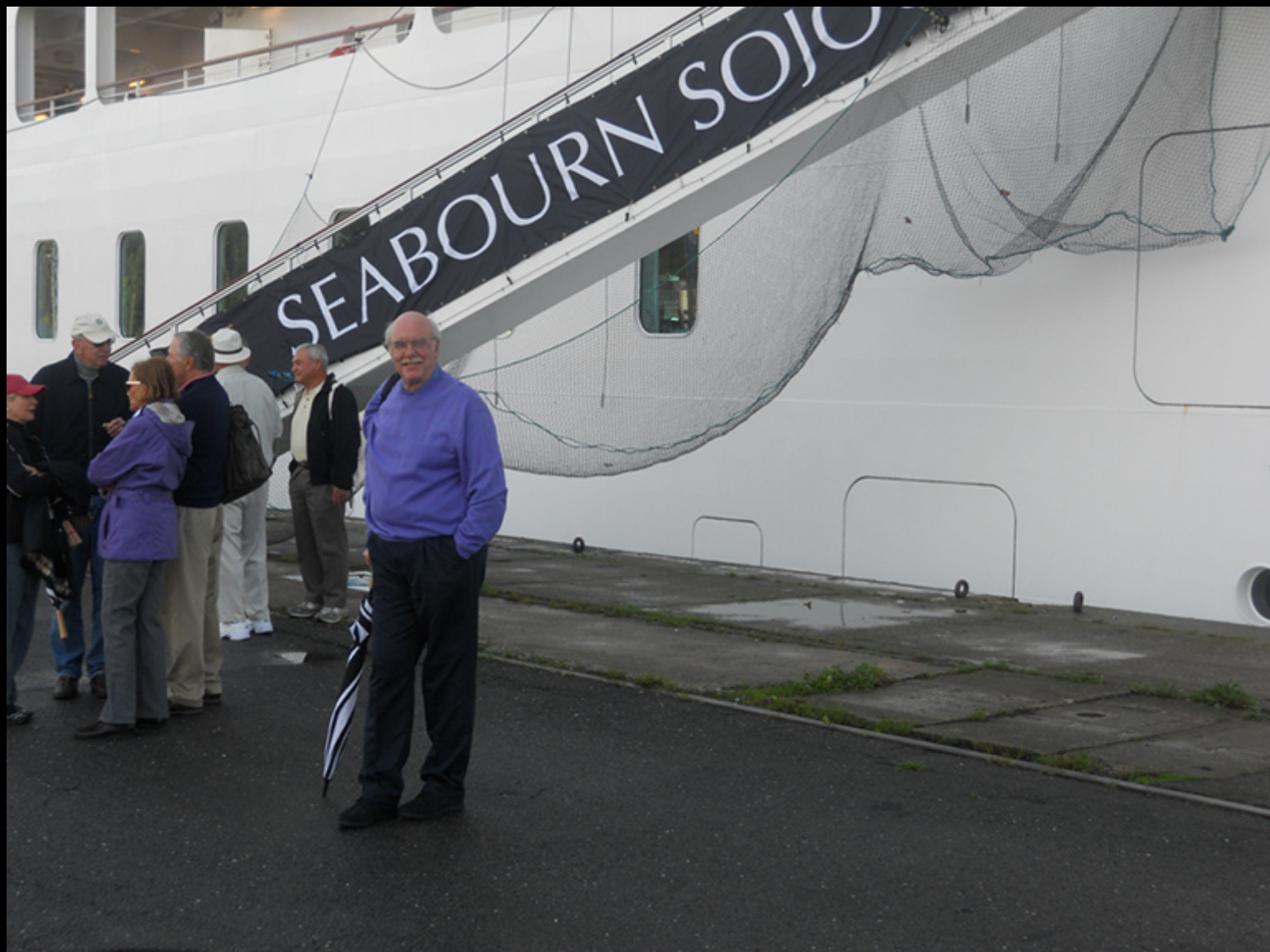
Back to the ship