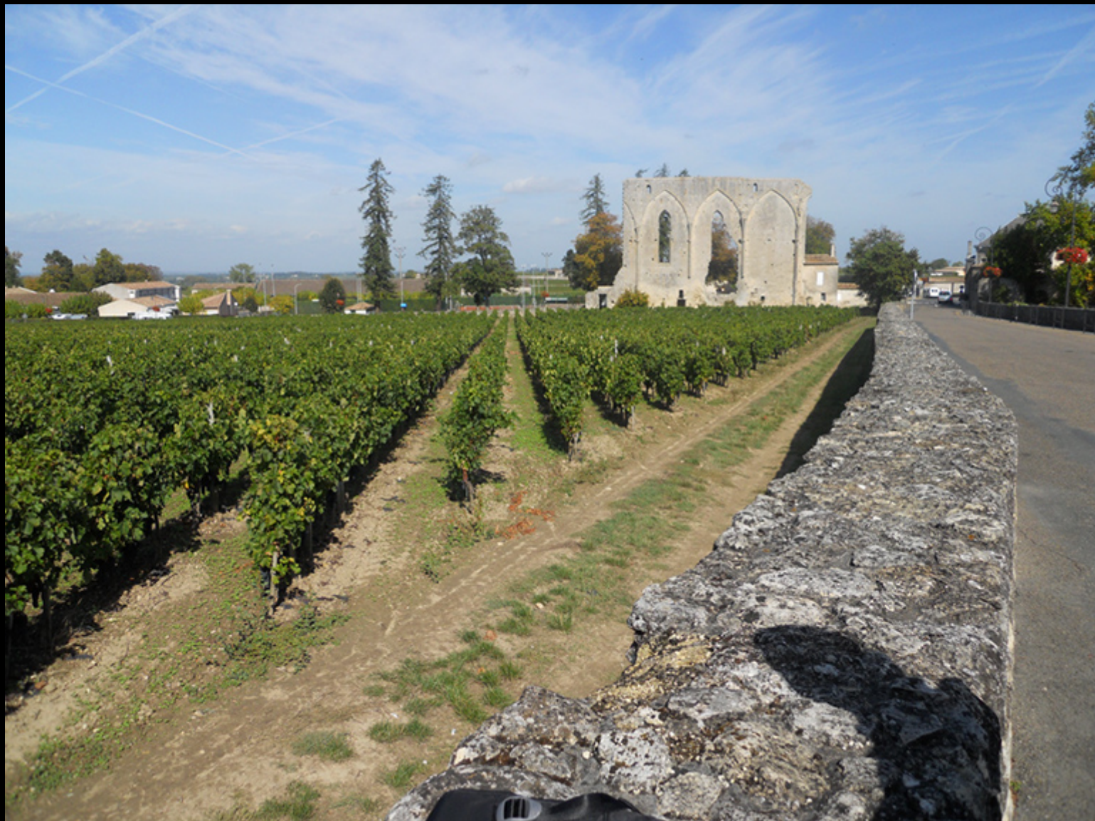
Outside St Emillon