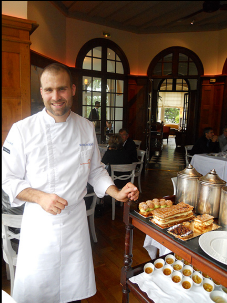
Dessert Trolley Le Coquillage