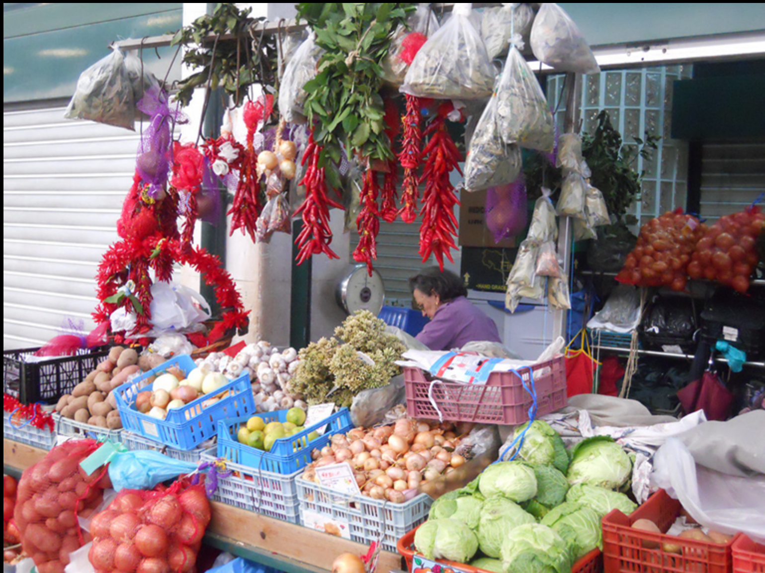
Merdao da Ribeira Lisbon