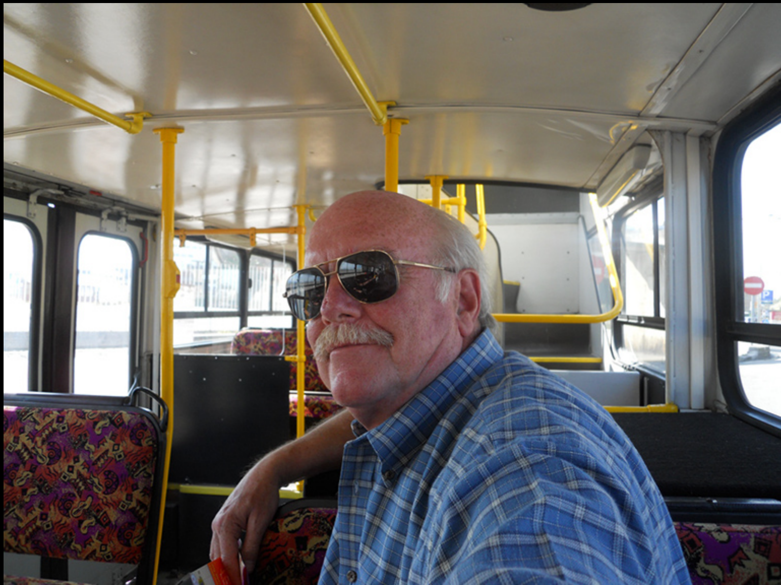
Hop on Hop off Santander