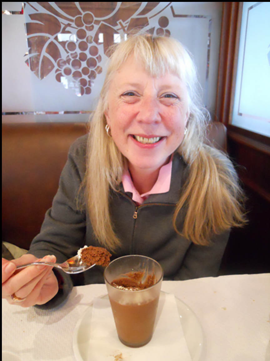
Mousse in Lorient