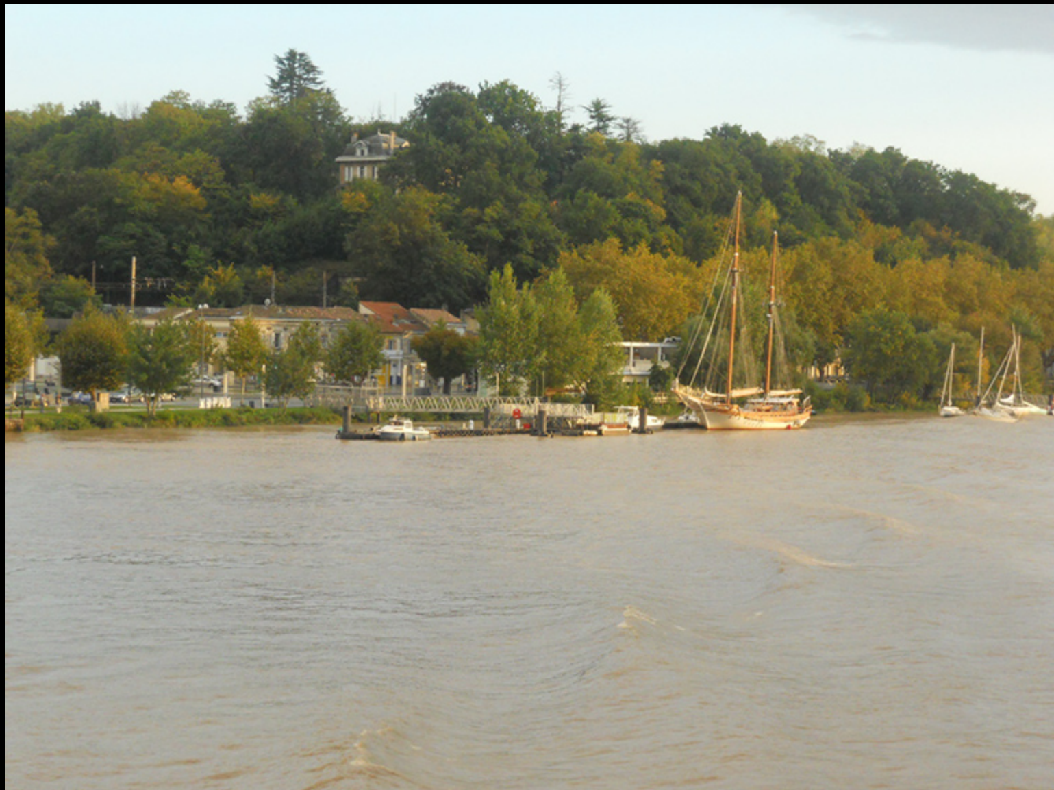
traveling out of Gironde