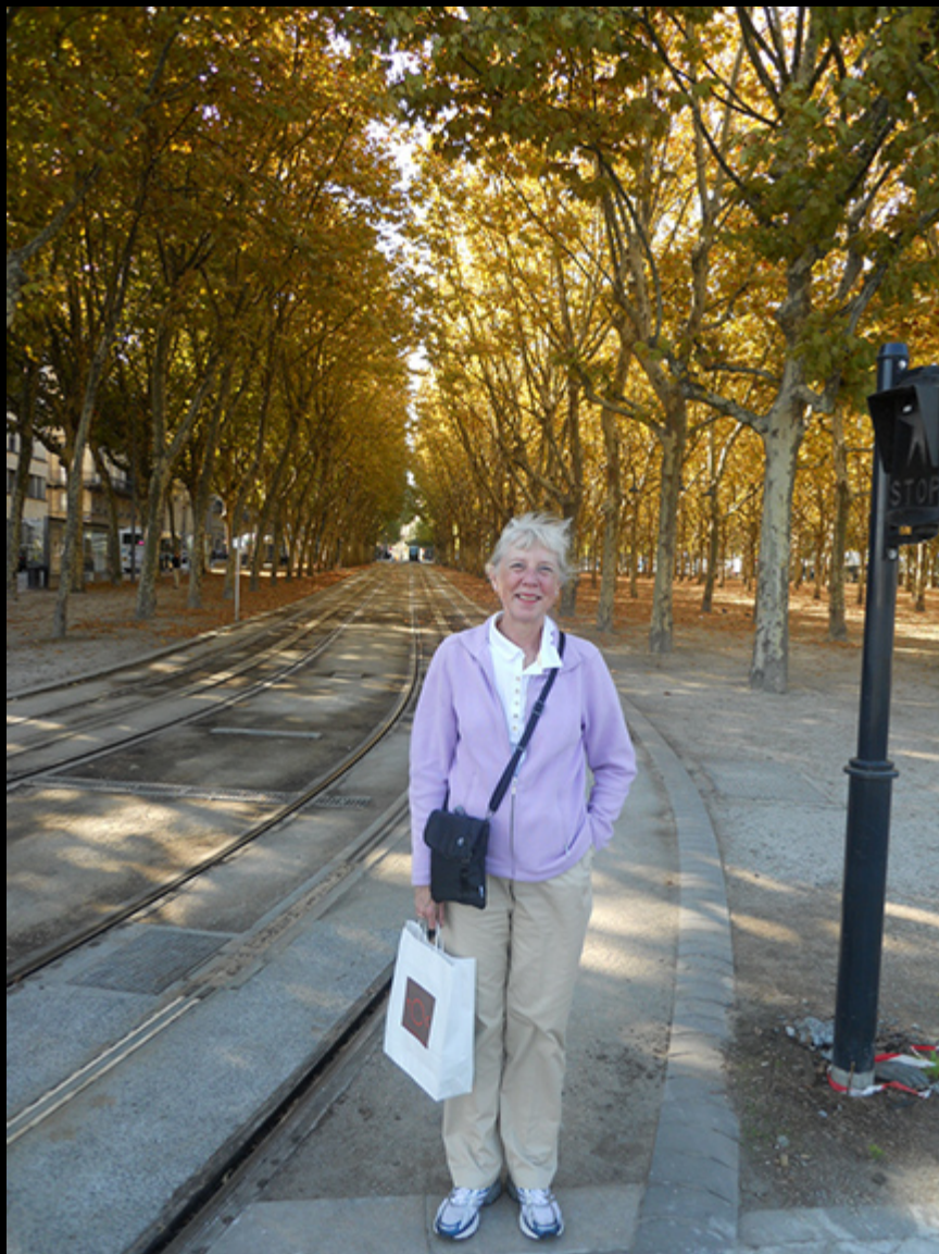
Walking back to ship in Bordeaux