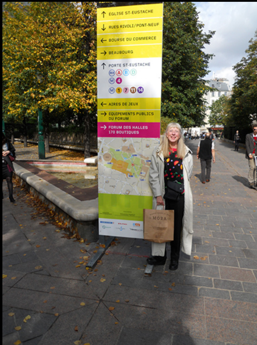
Shopping in Paris