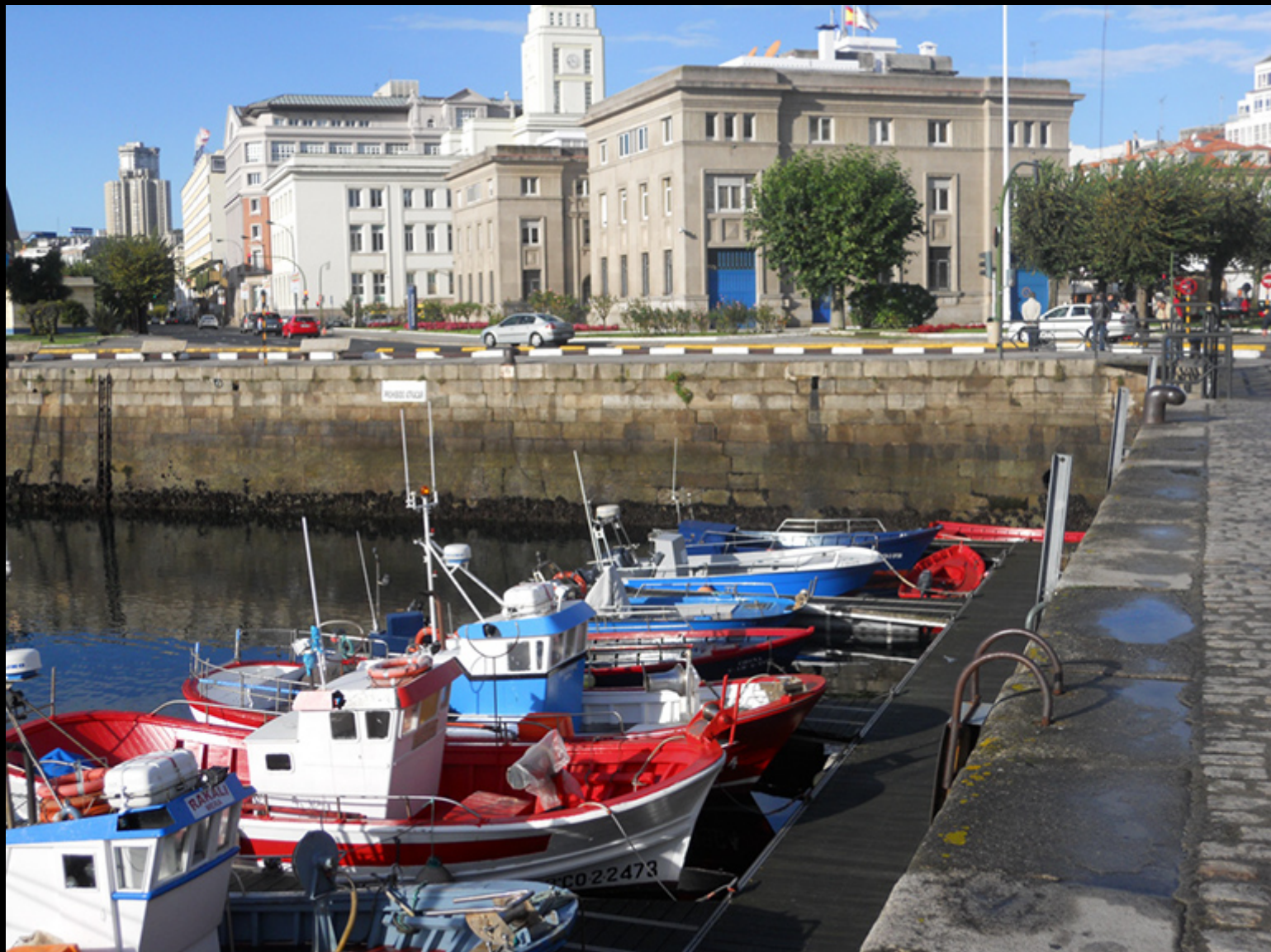
La Coruna walk