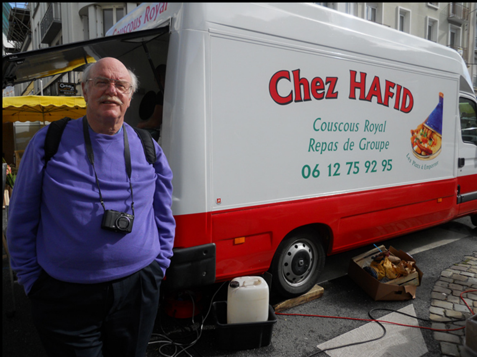
Take out in Brest