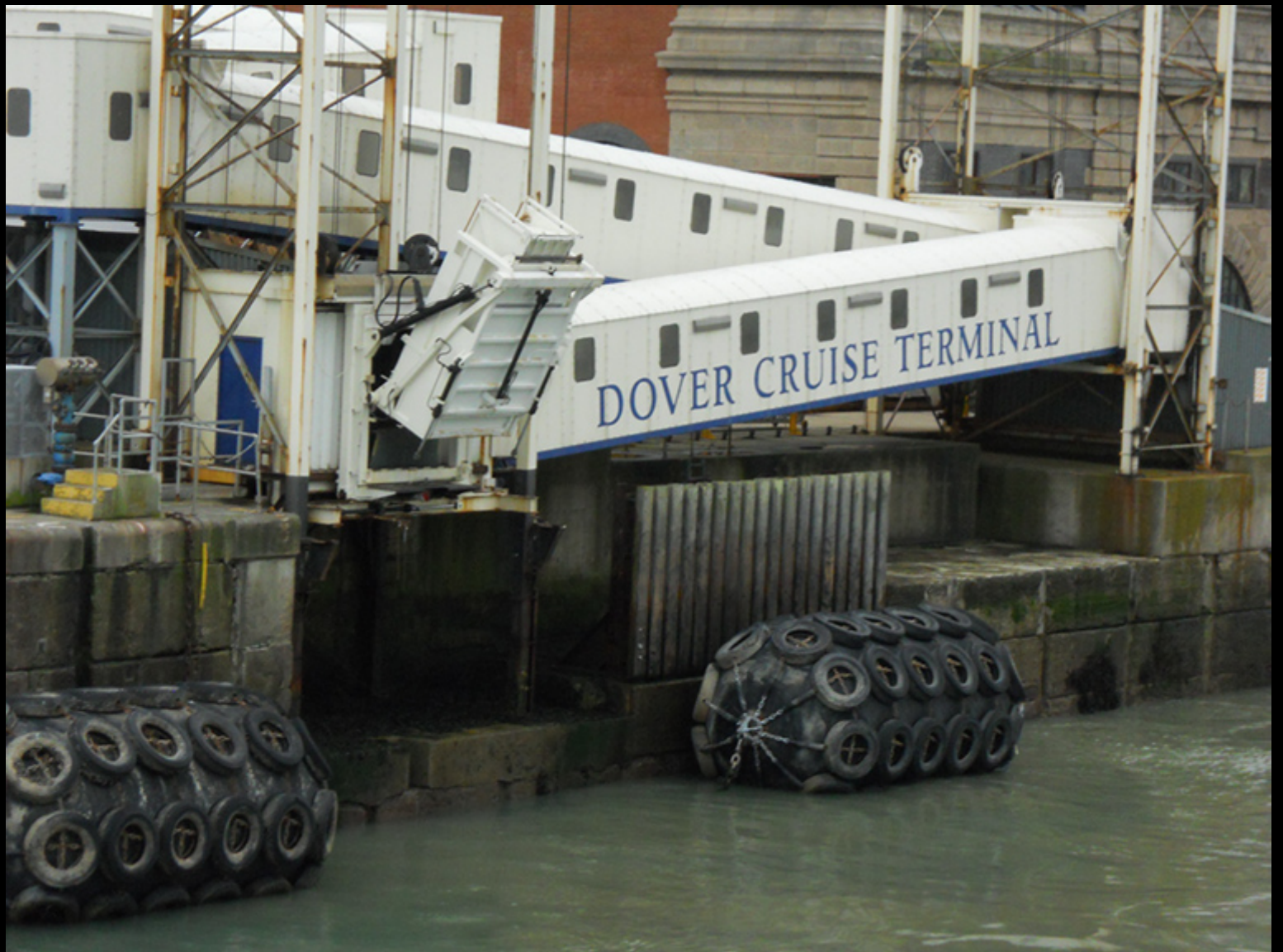
Boarding ship in Dover