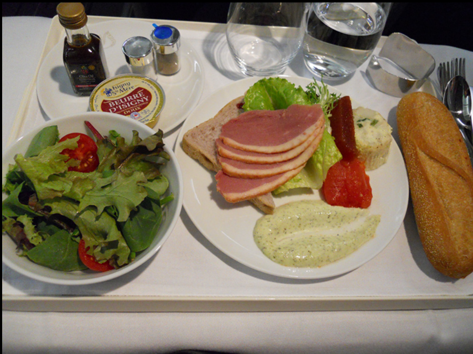
Air France 1st course