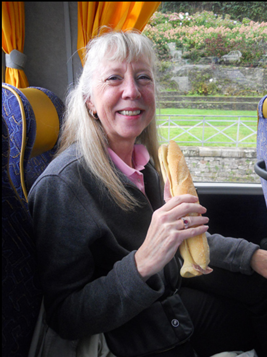
I love these sandwiches