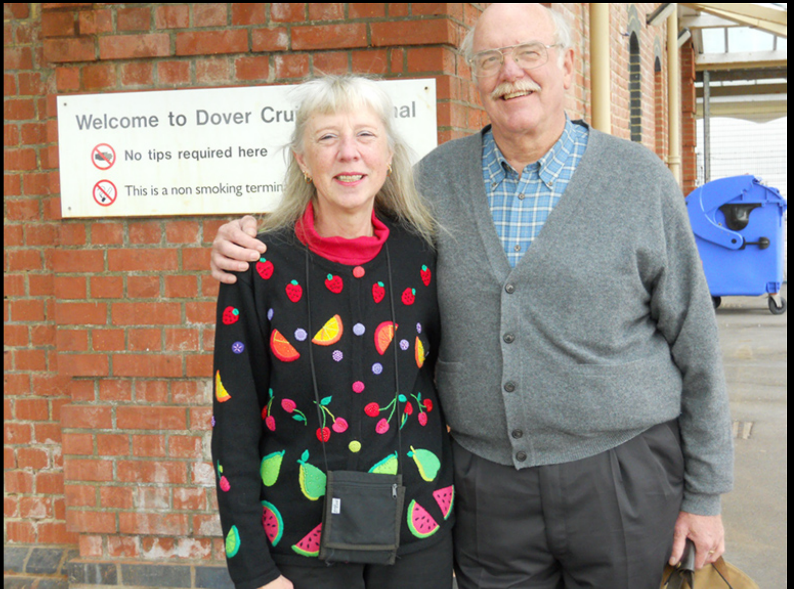
Dover Cruise Terminal