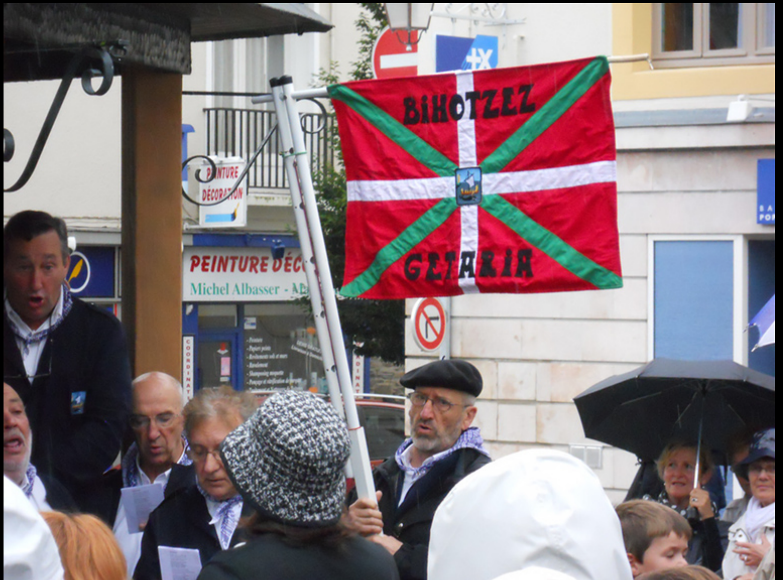
Music in the square Conca France