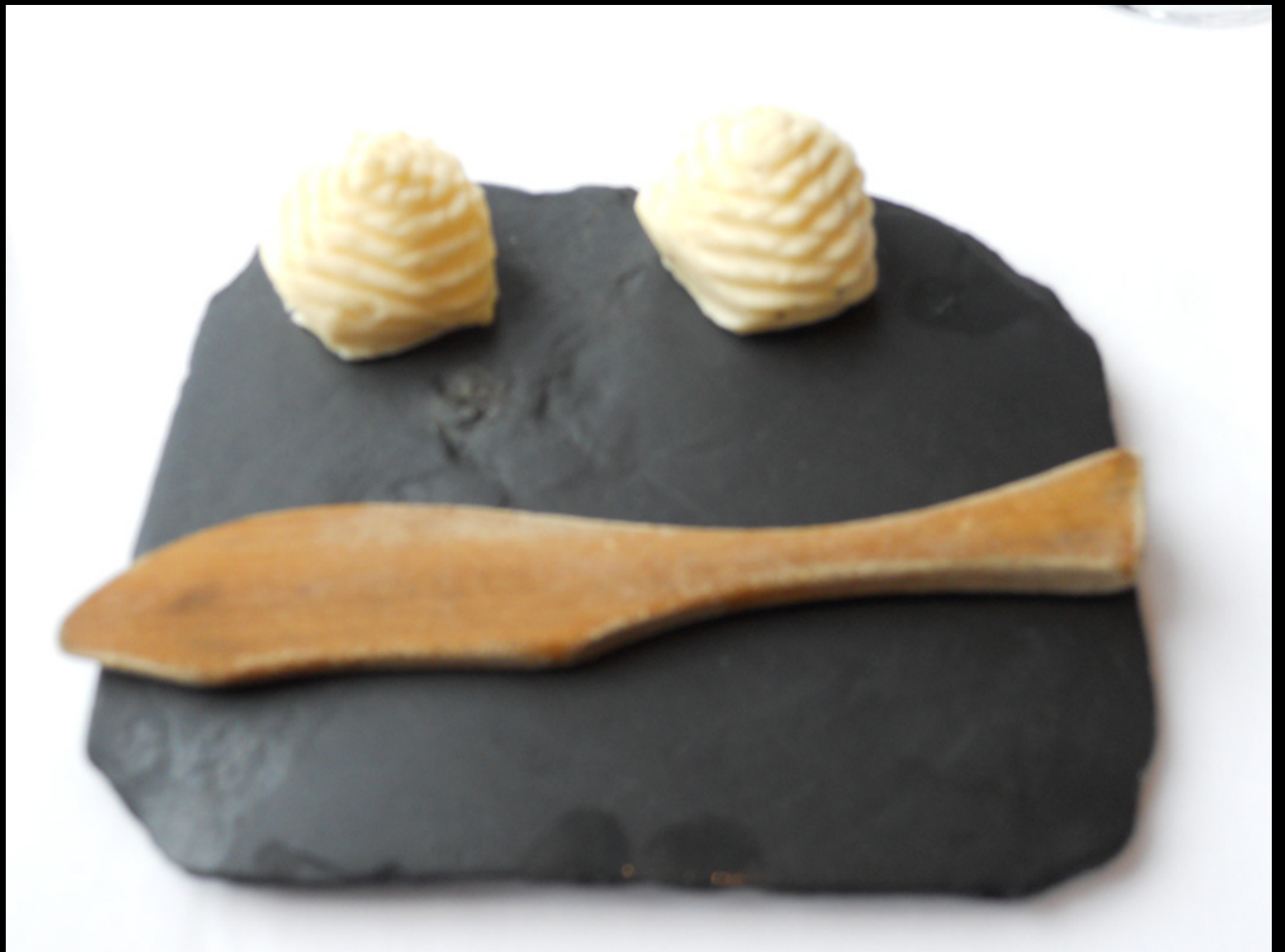
Butter on table at Le Coquillage