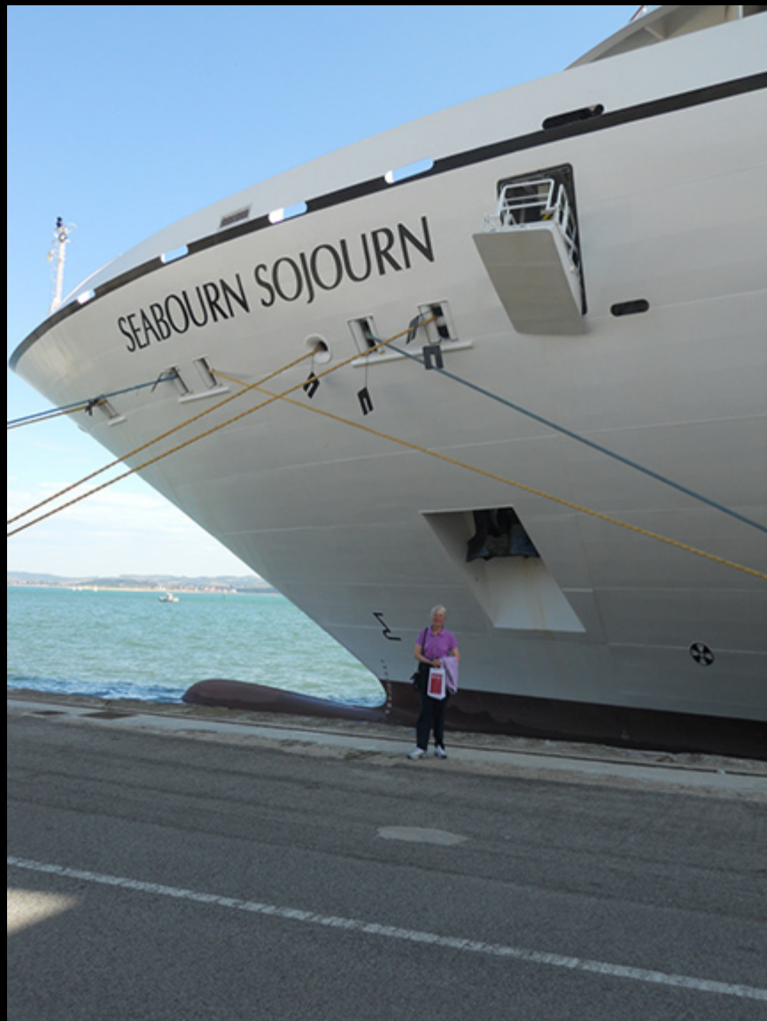
Back from shopping