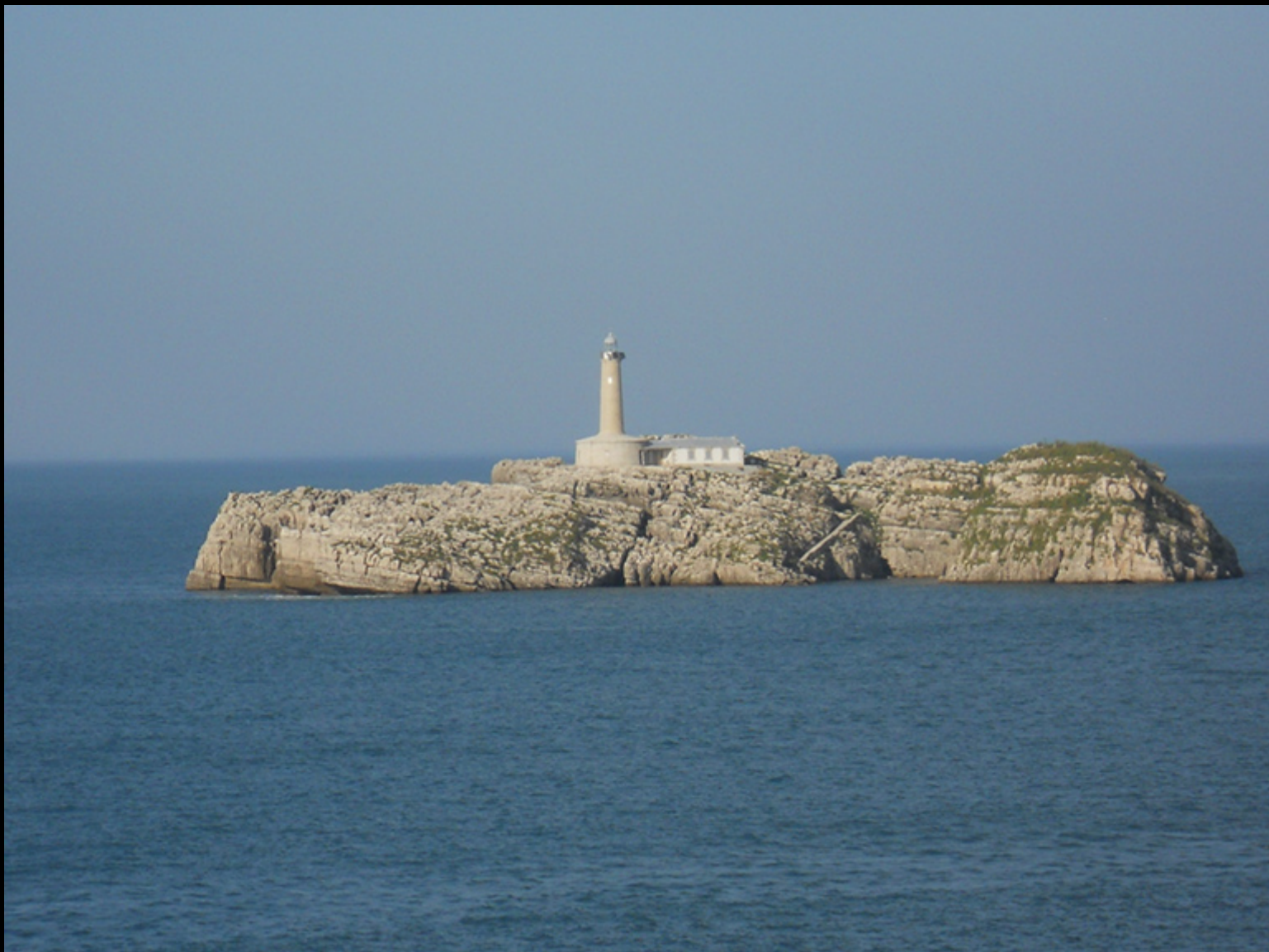
Leaving Santander Spain