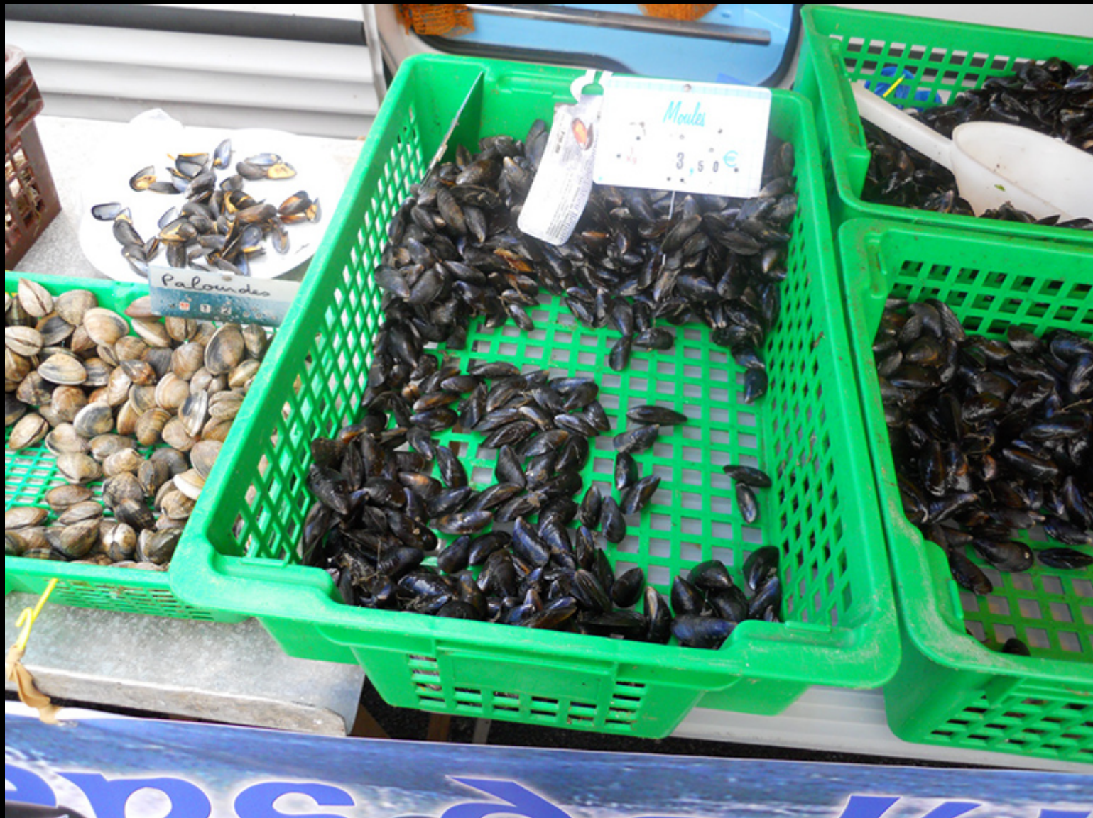
Moule in Brest