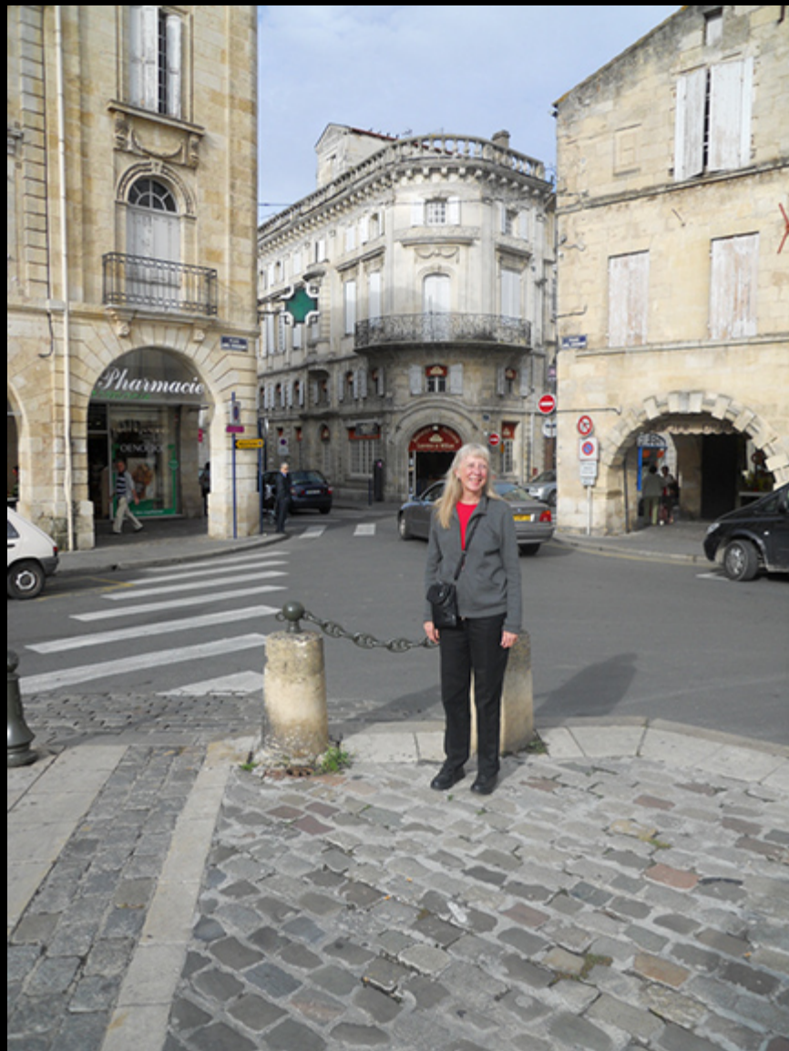
Liborne town square