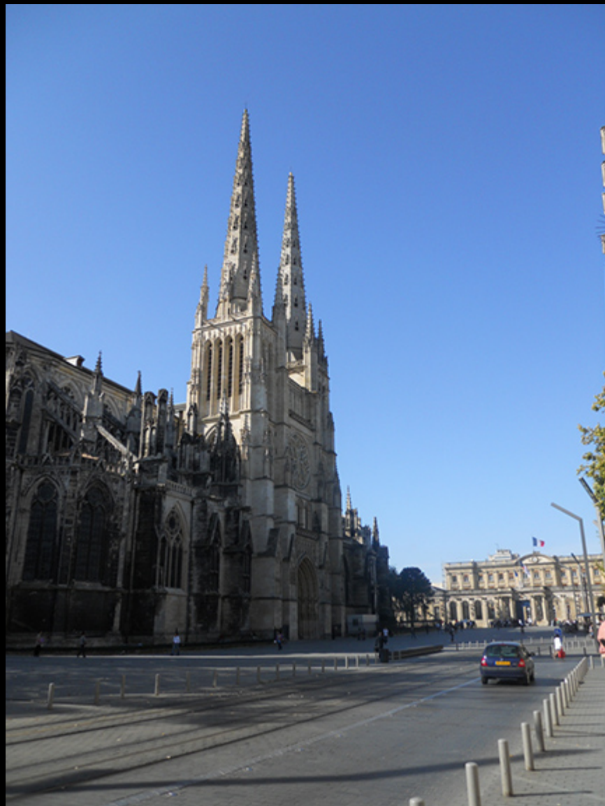
church in Bordeaux