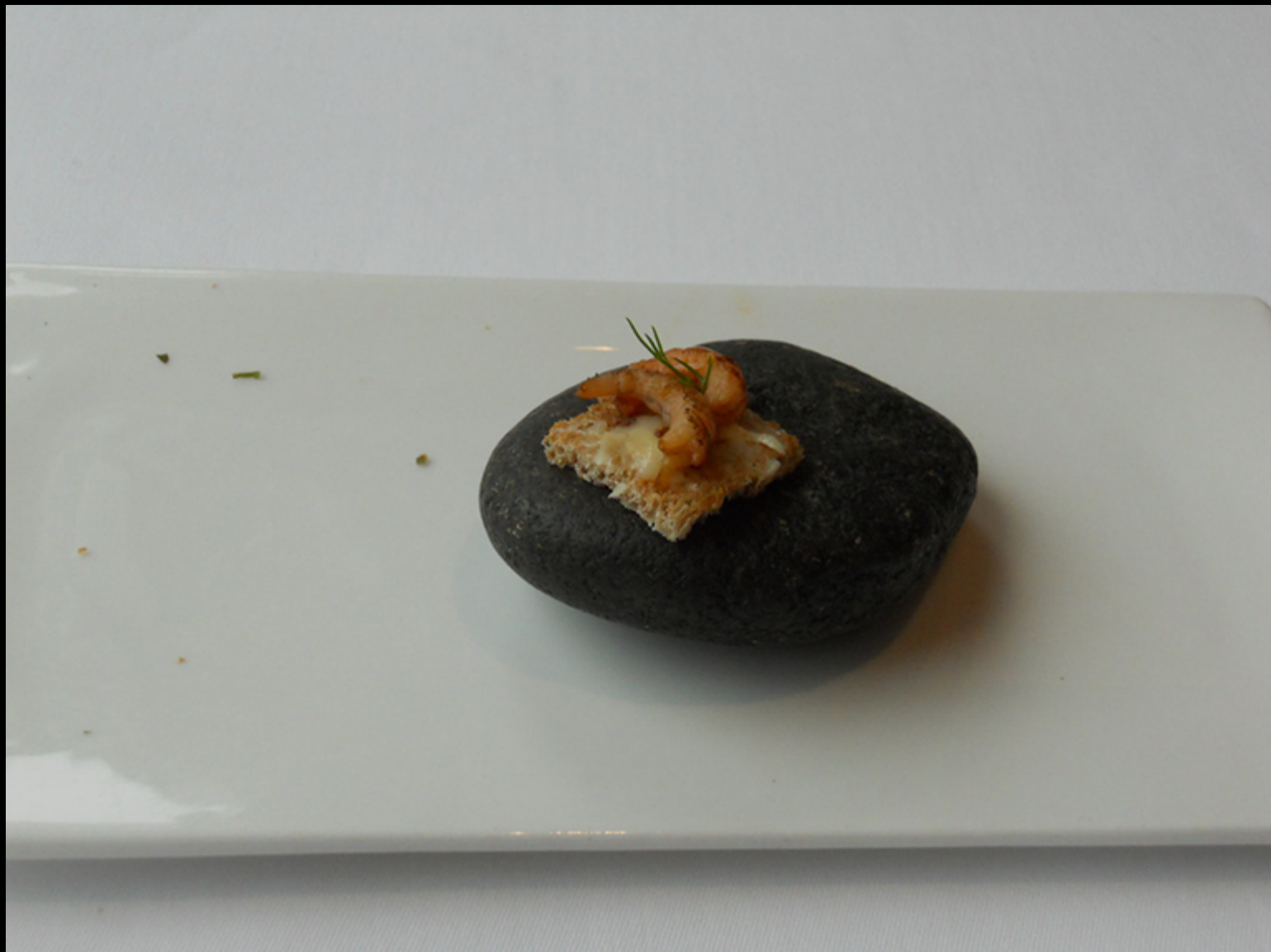
Amuse at Le Coquillage