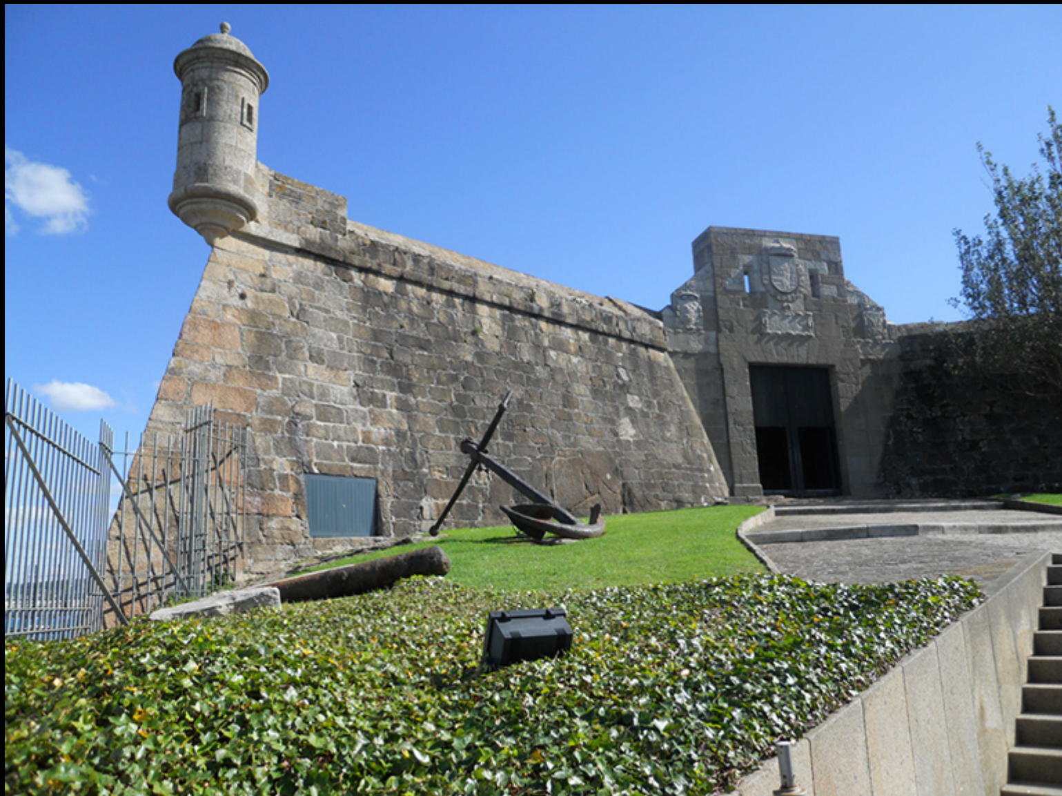
Fort at La Coruna