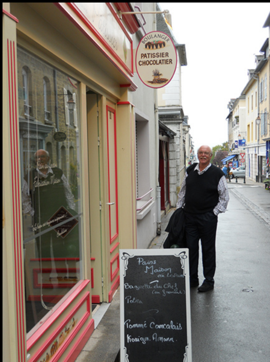
Walking streets of Concale France