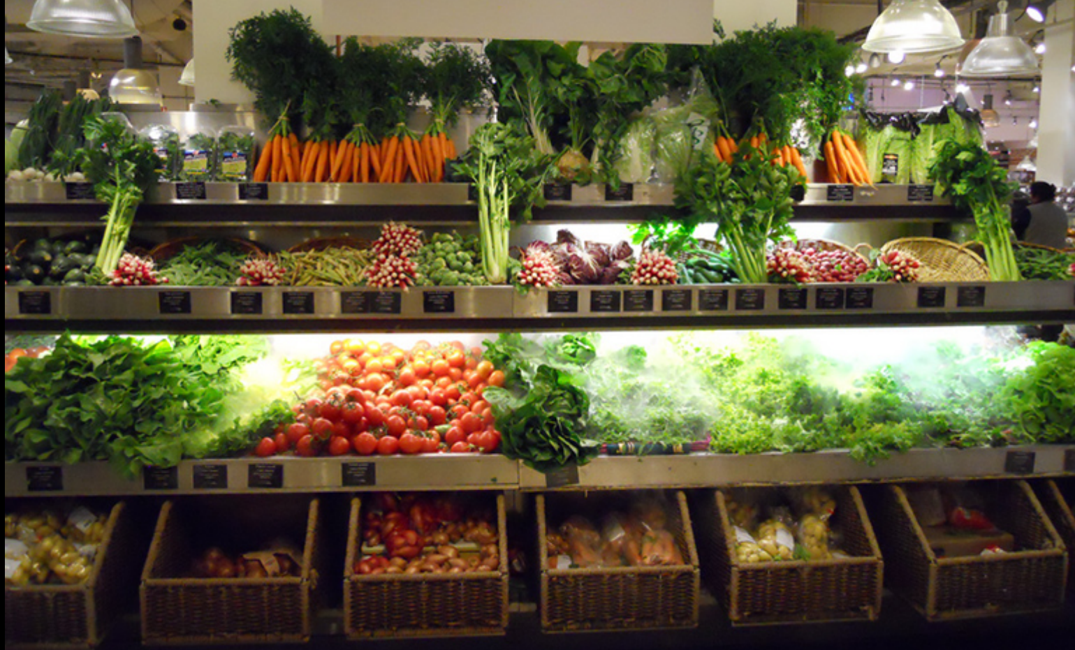
Produce at Le Bon Marche