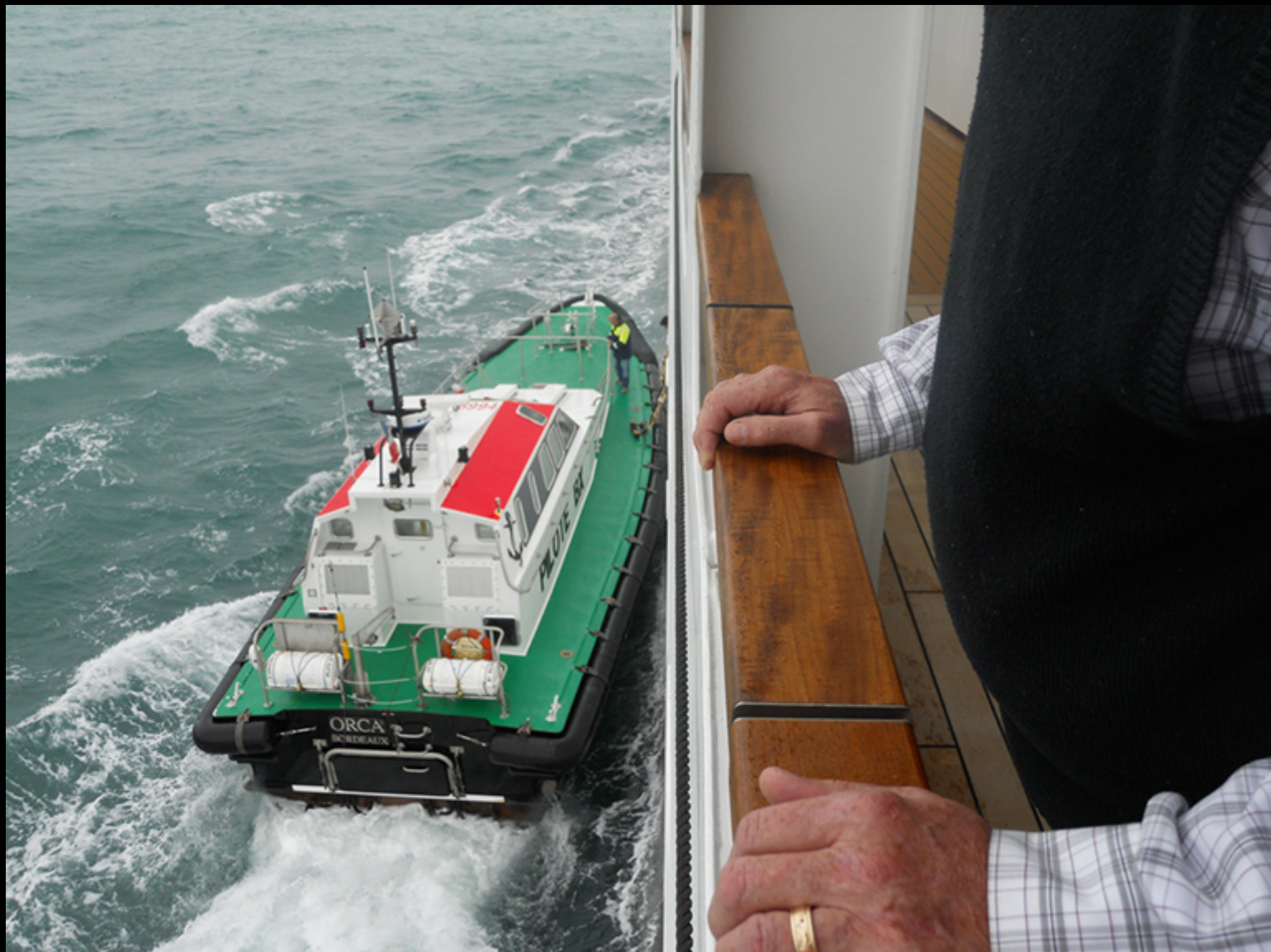
another pilot board