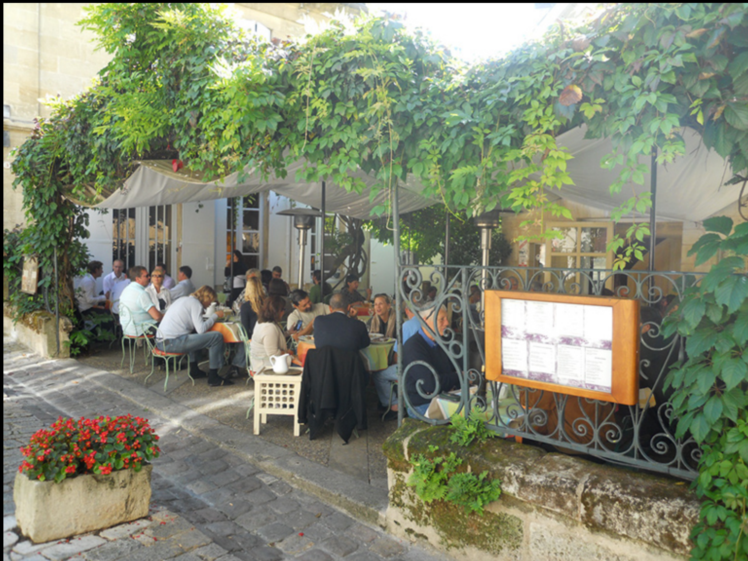
Lunch in St Emillion