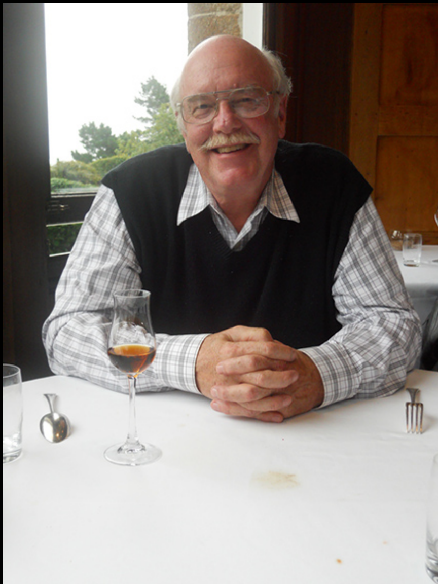
Finishing lunch in Concale