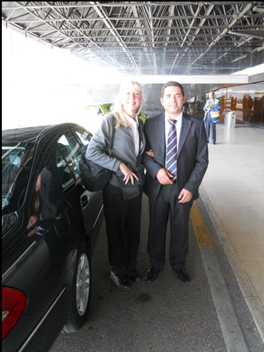
Driver in Lisbon