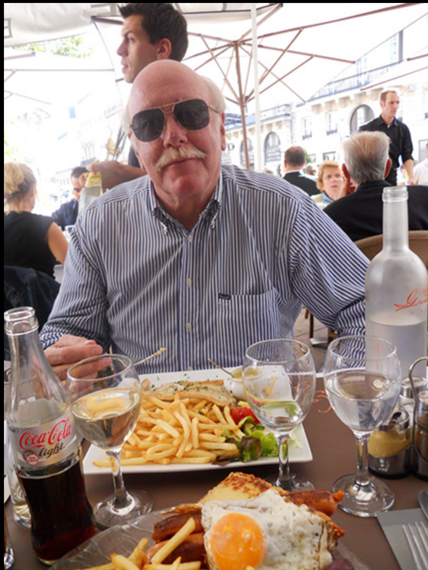
Lunch in Bordeaux