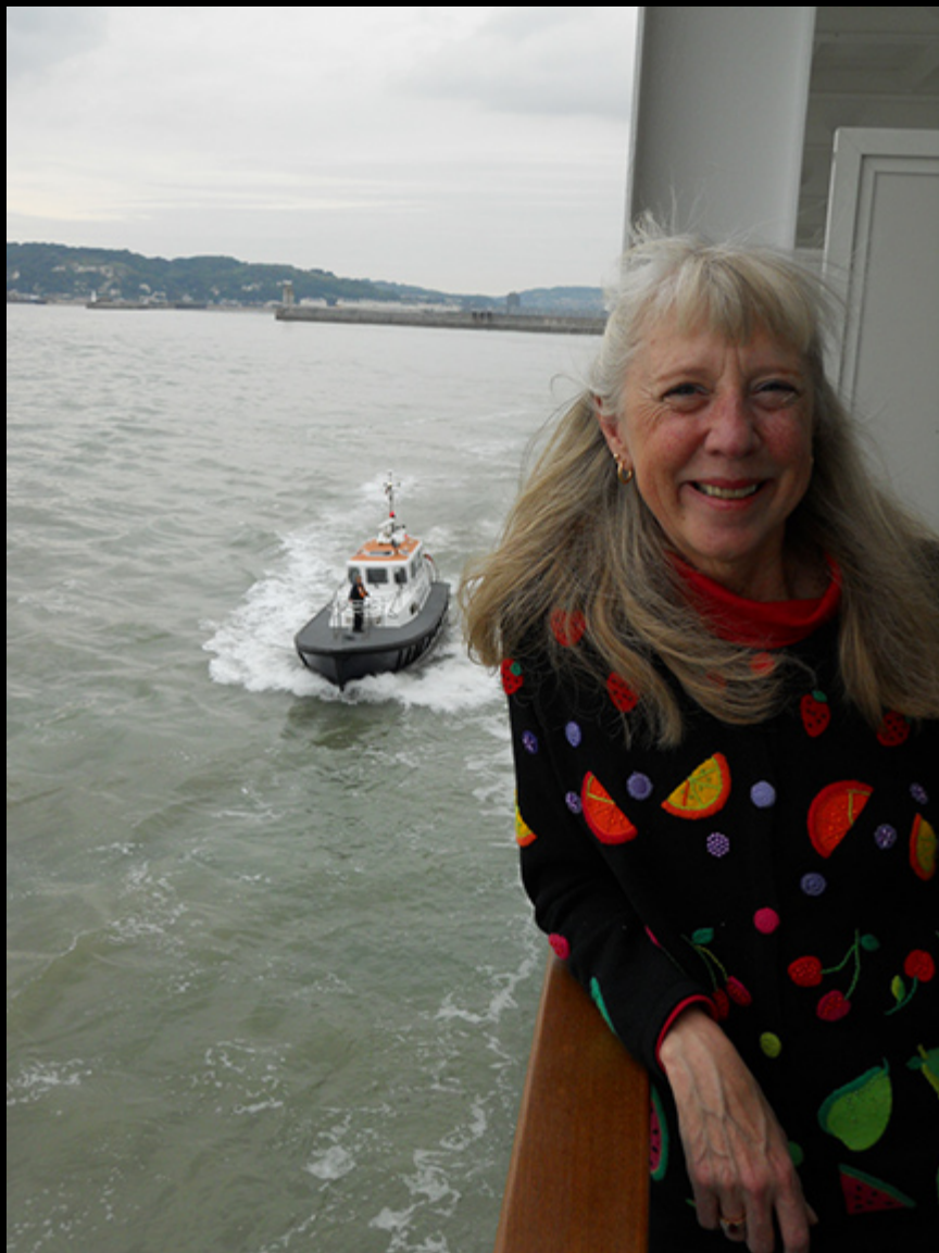
Ship departs Dover