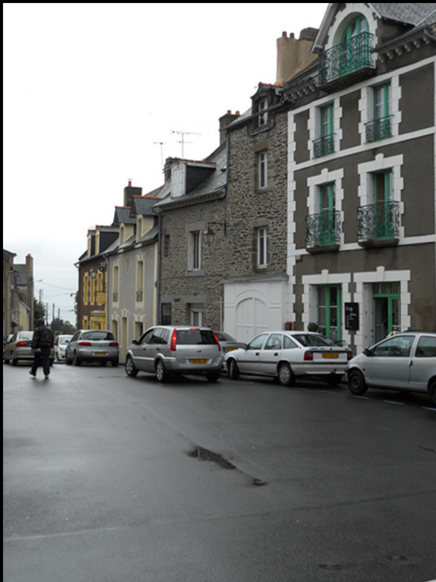
Walking down to lower Concale