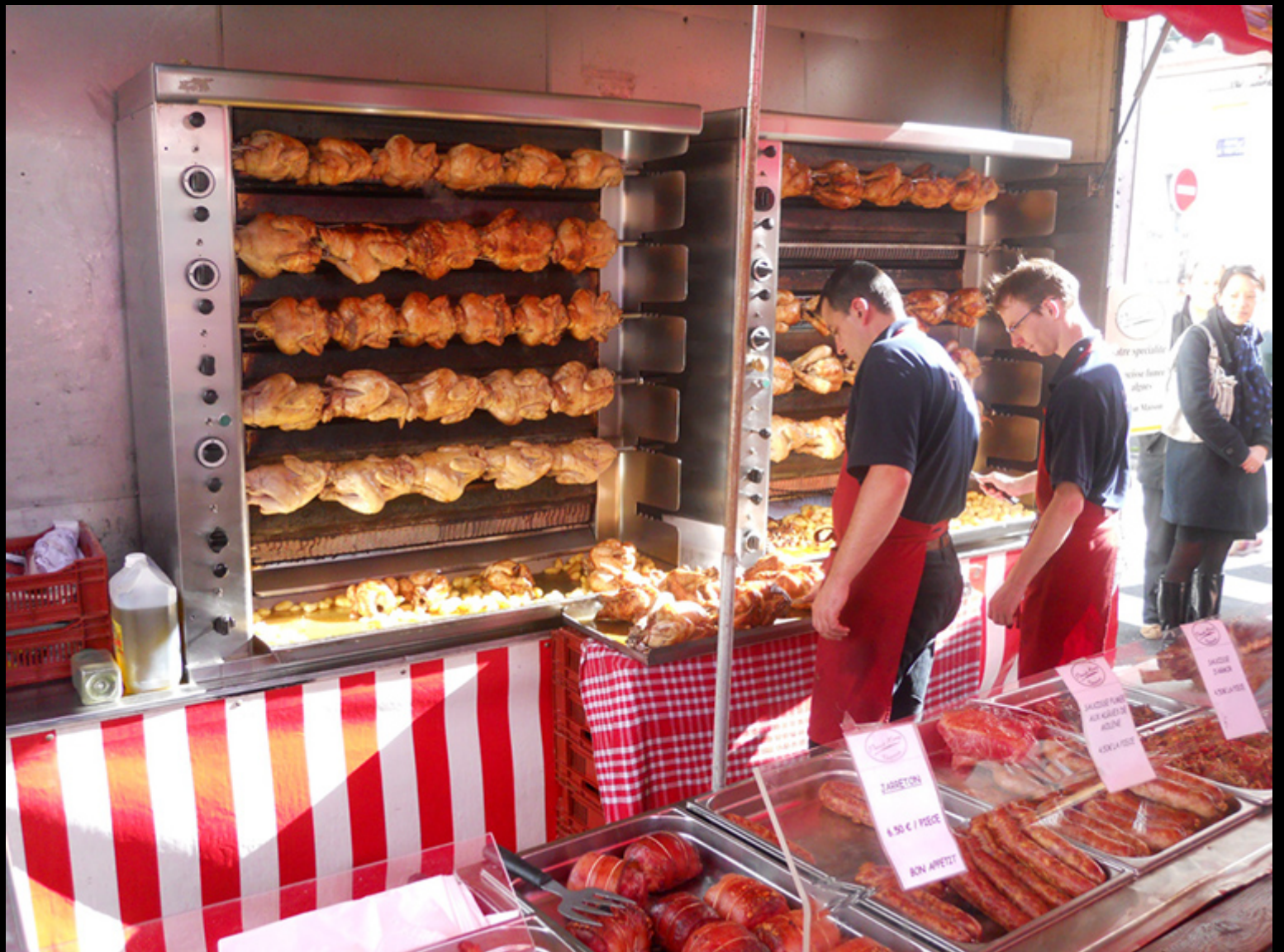
Sausages ad Chickens in Brest