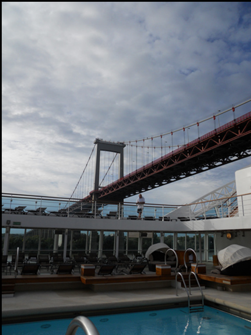
Going under Bridge into Bordeaux