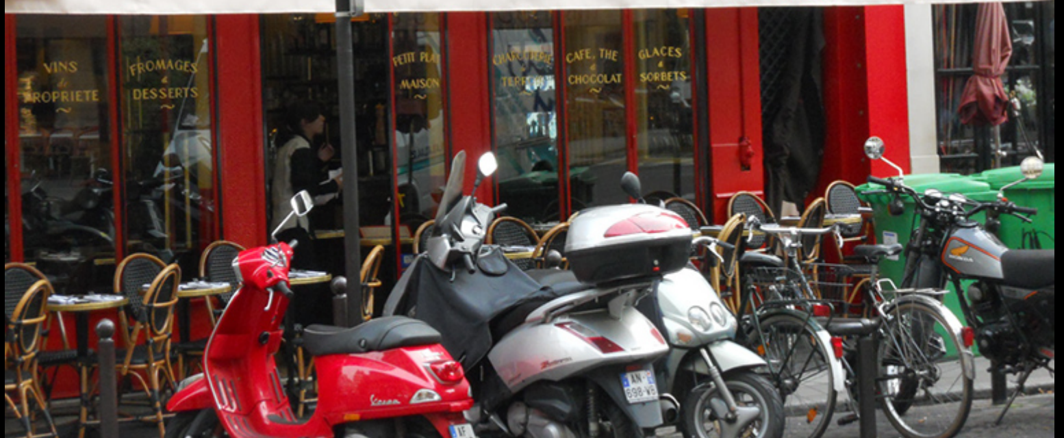
Lunch in Paris