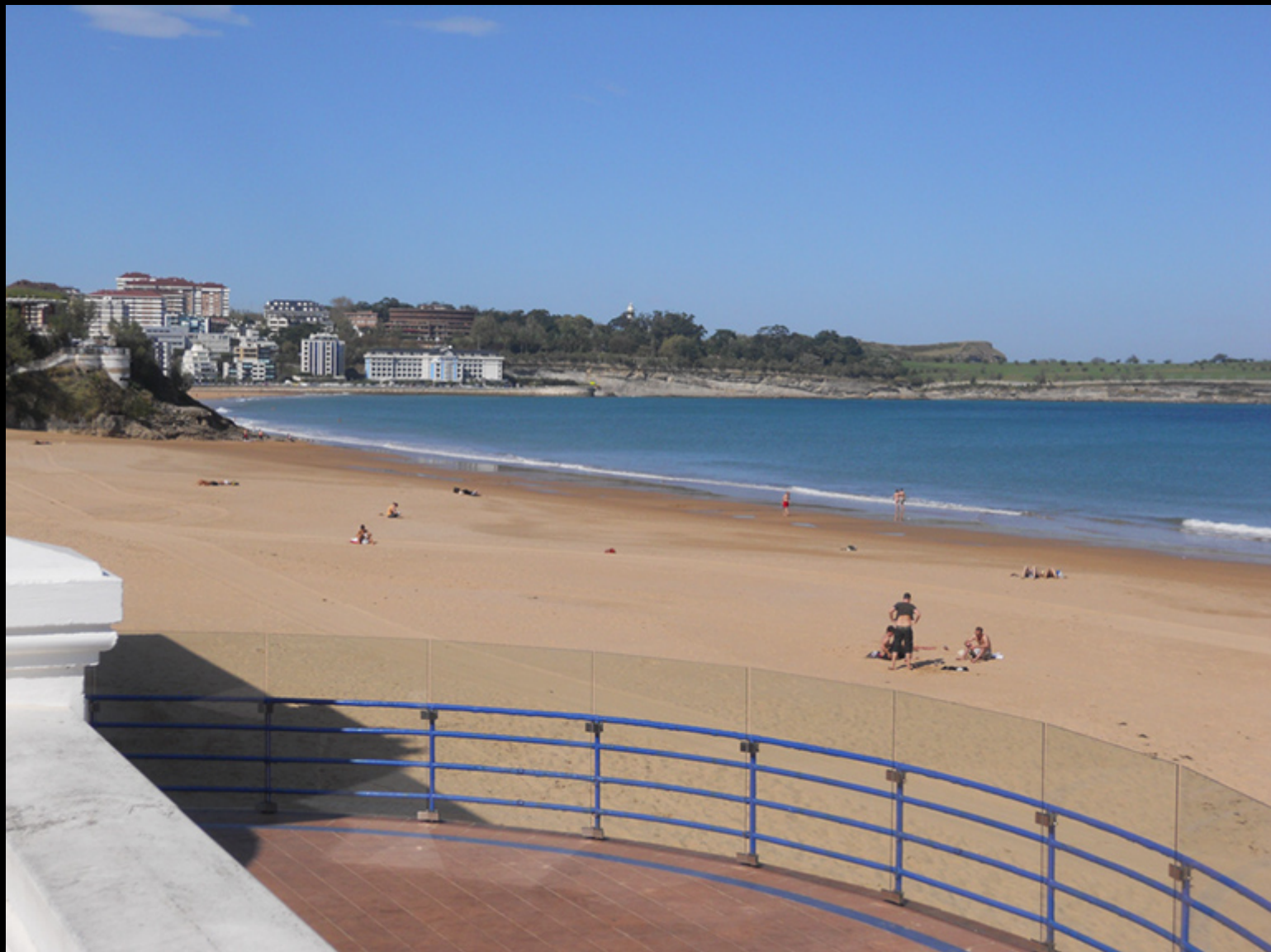
Santander Spain 3