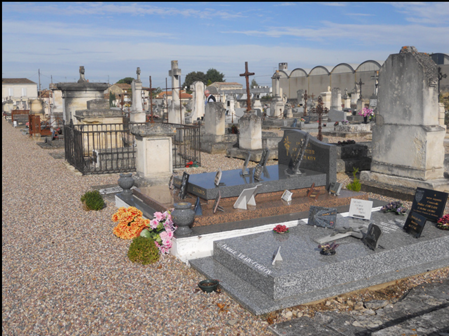
Looking for Sauve in Liborne