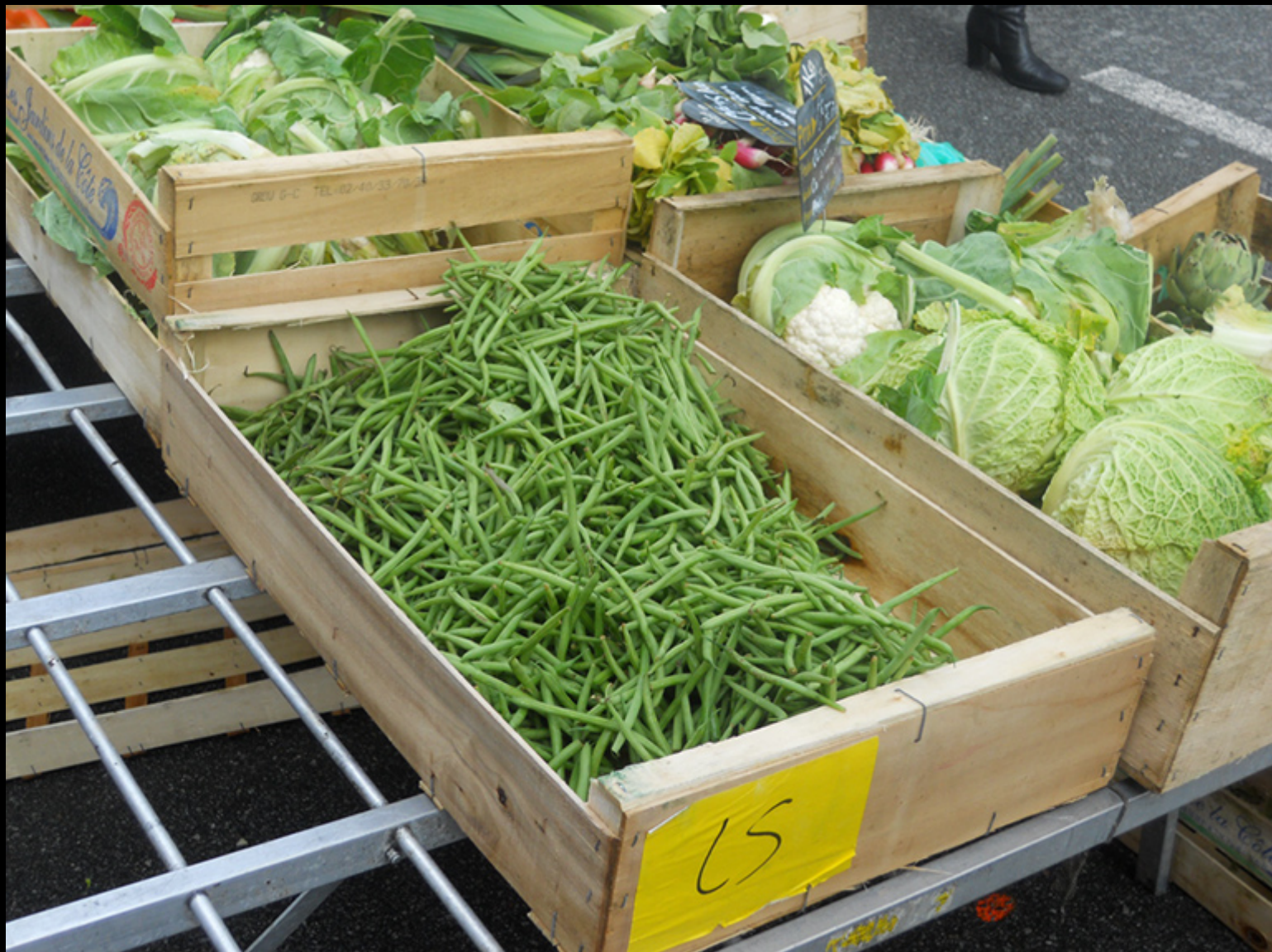
Haricot Vert in Brest