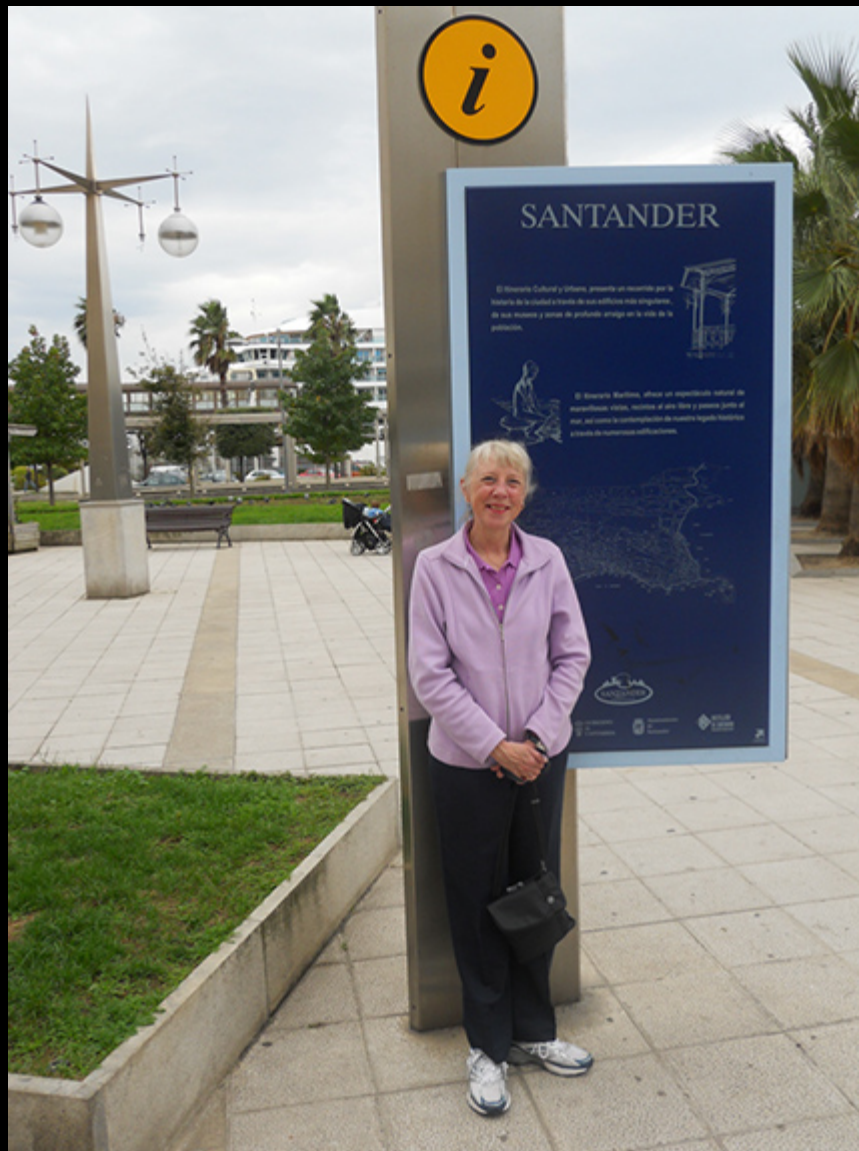
welcome to Santander