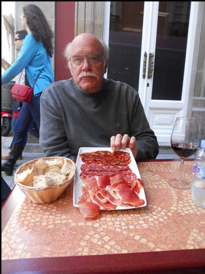
He actually loved it