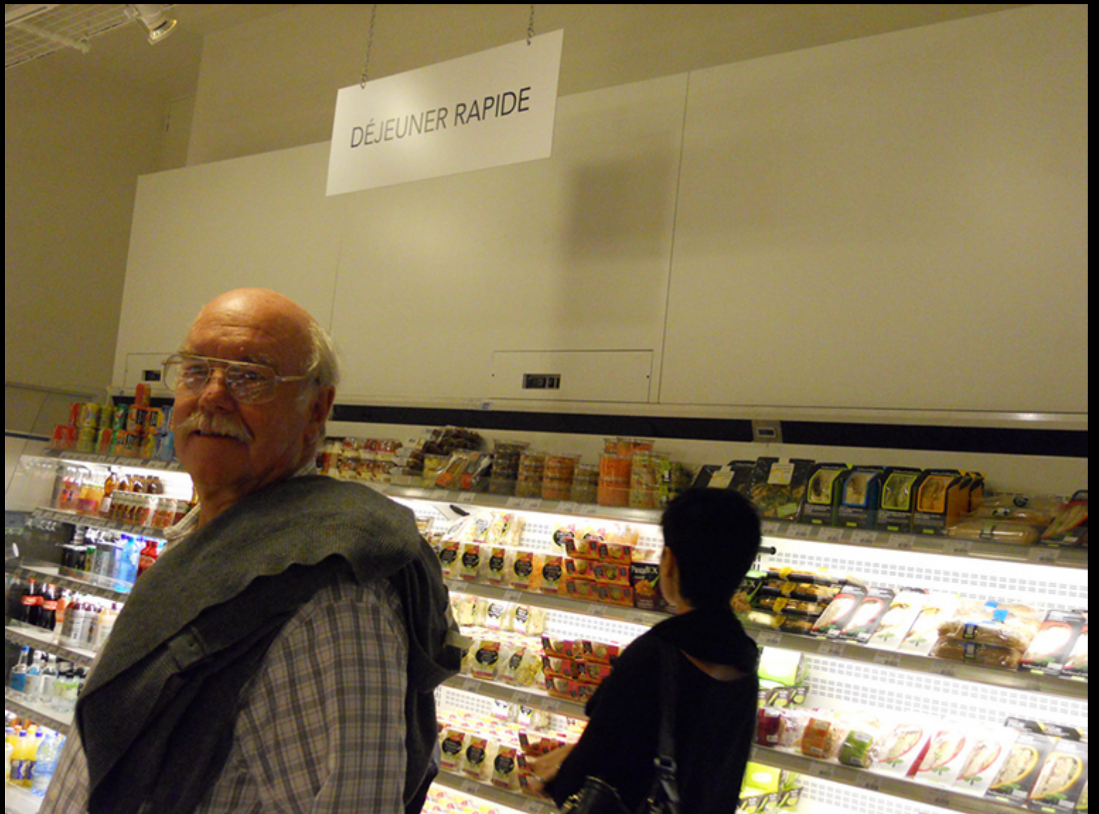
shopping at Le Bon Marche