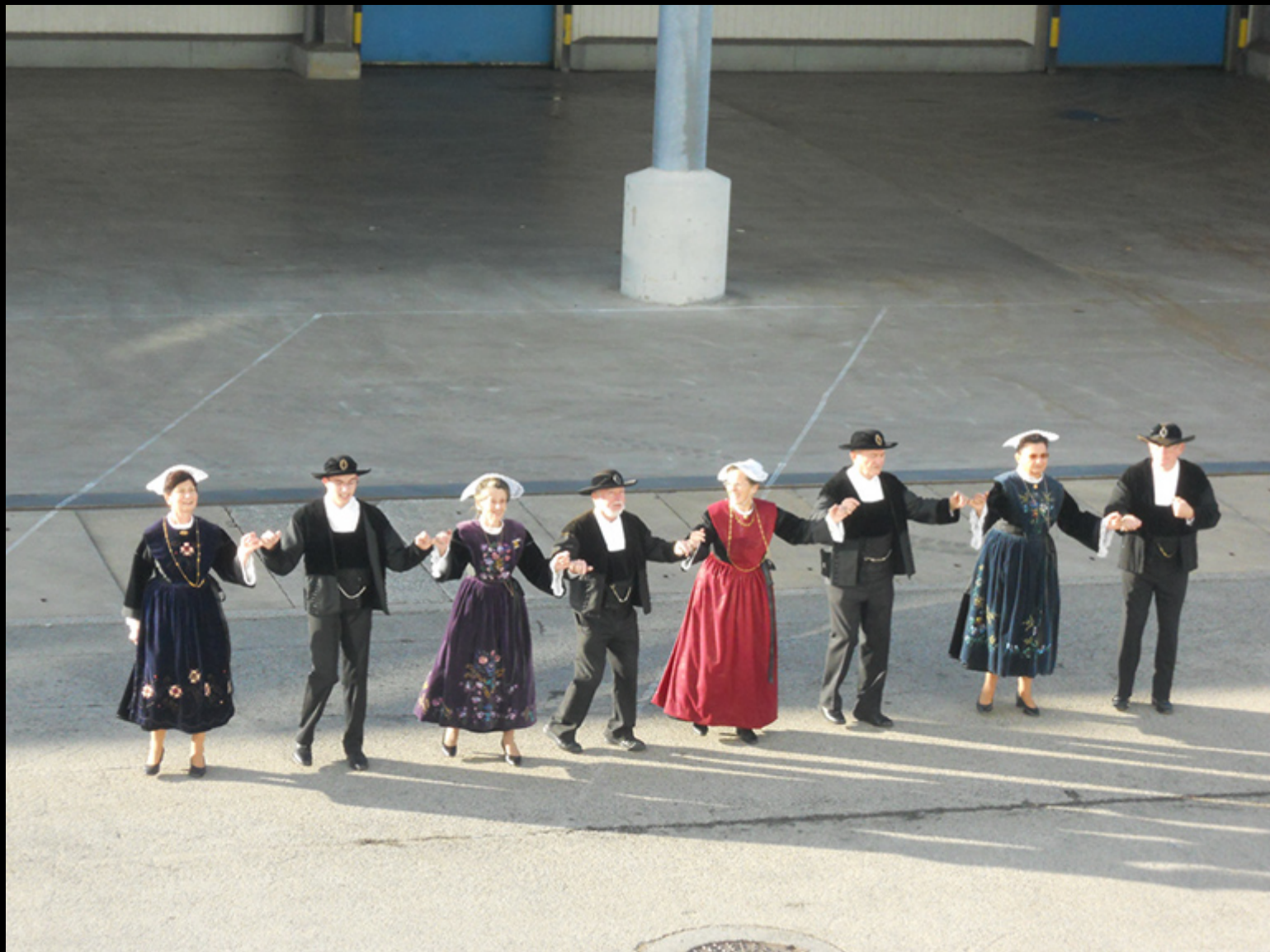
Dancers leaving Brest