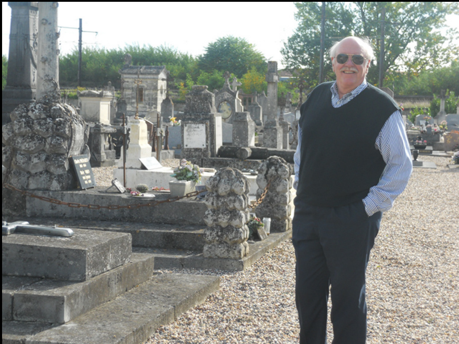
Looking for Sauve roots