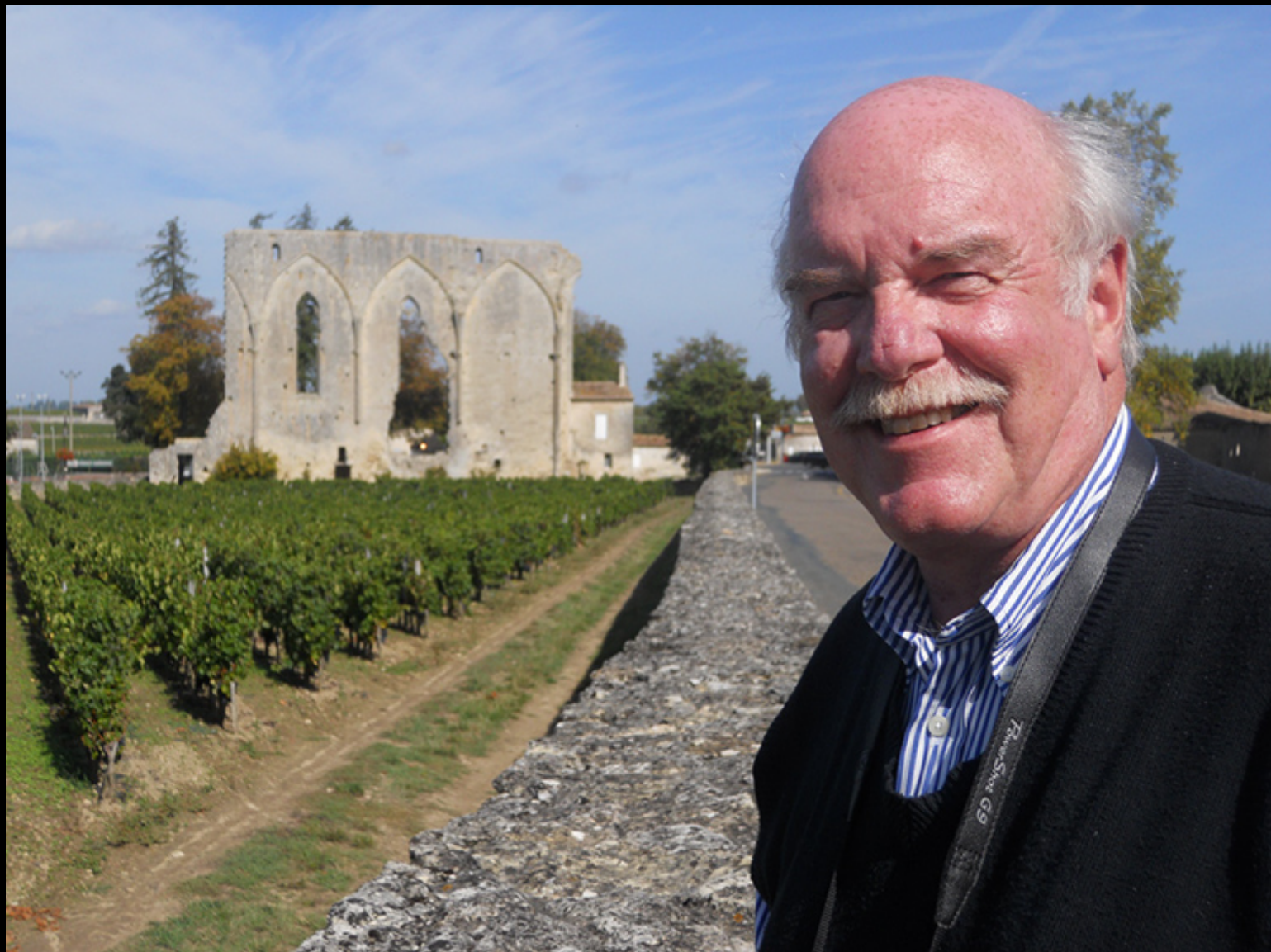
outskirts of St Emillon