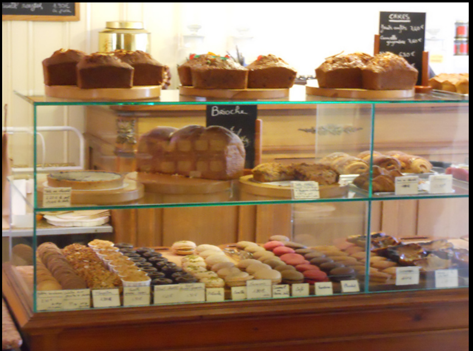
Grain de Vanille - Concale France