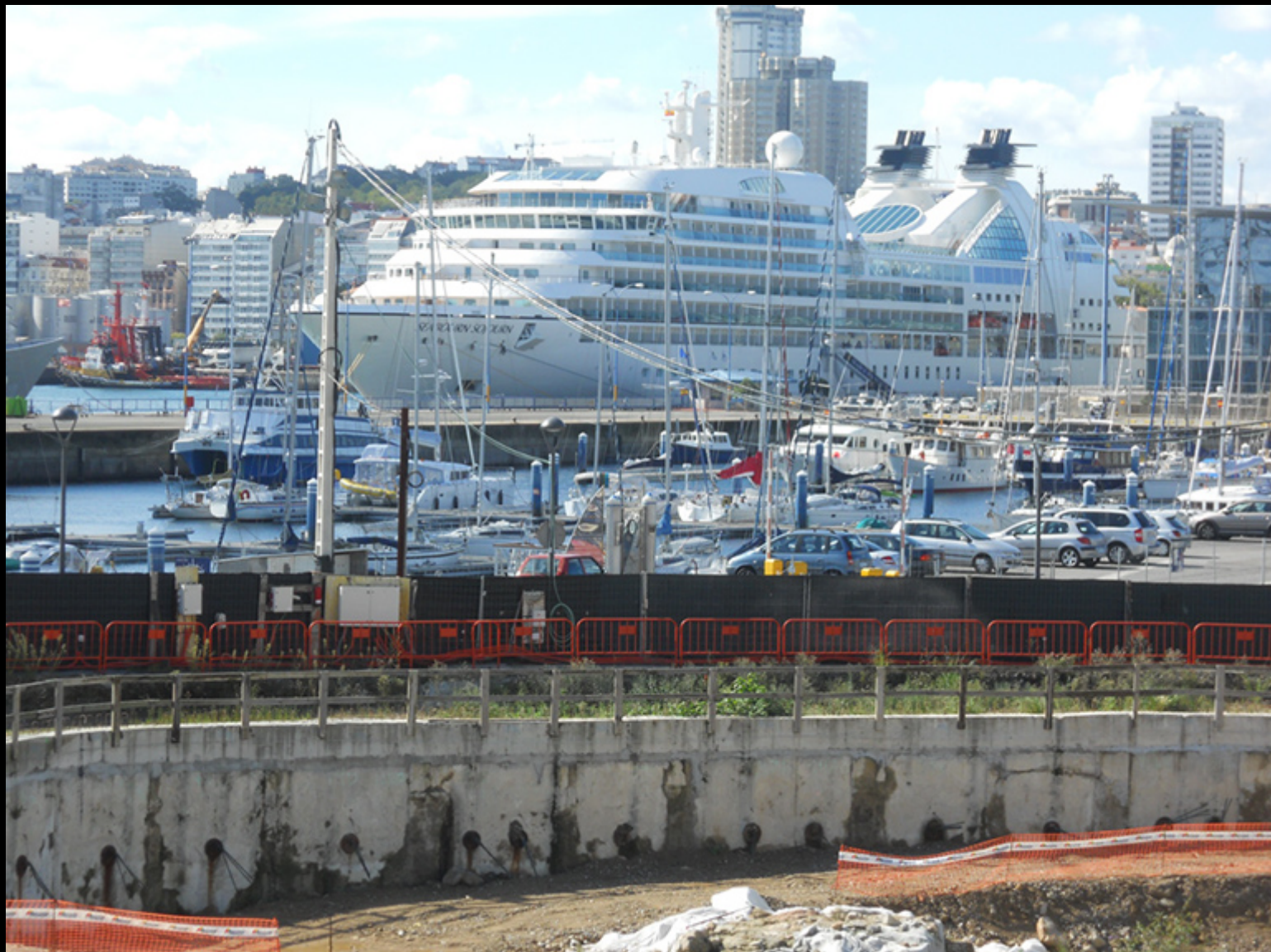
Ship in Spain