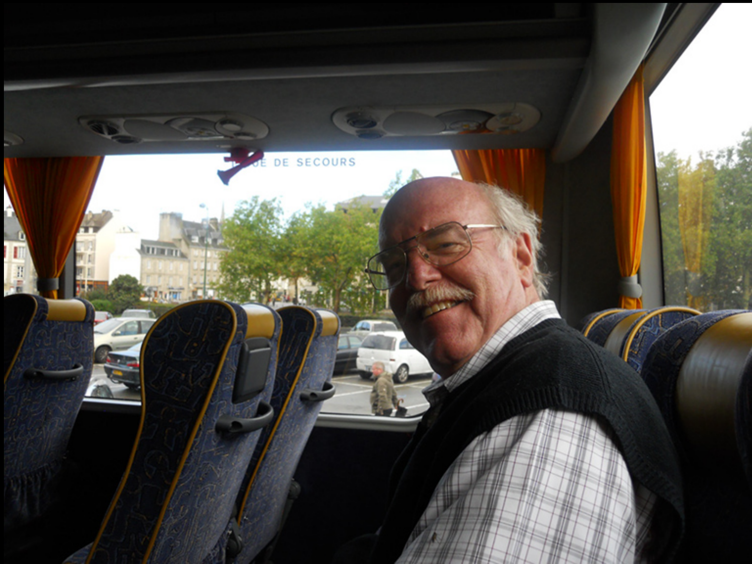
Trip to Quimper