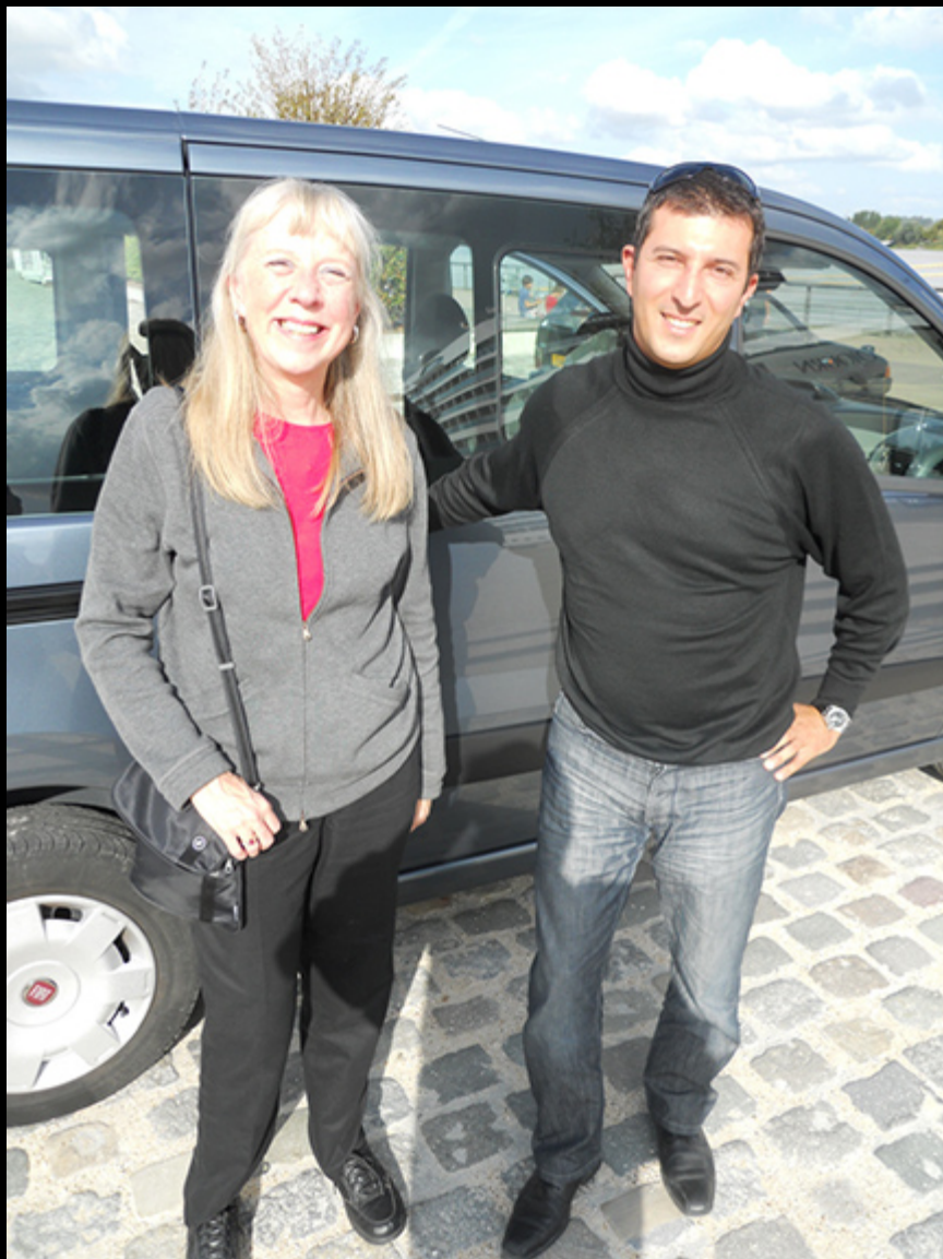
Driver in Bordeaux