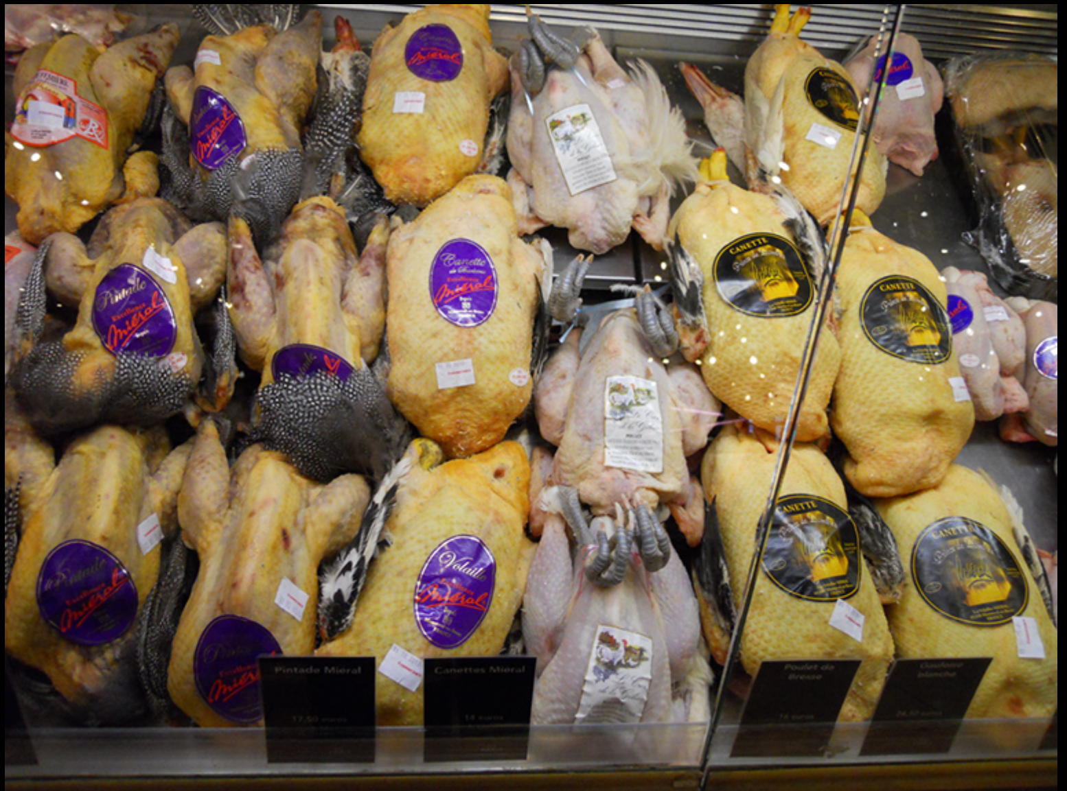
Poultry at Le Mon March