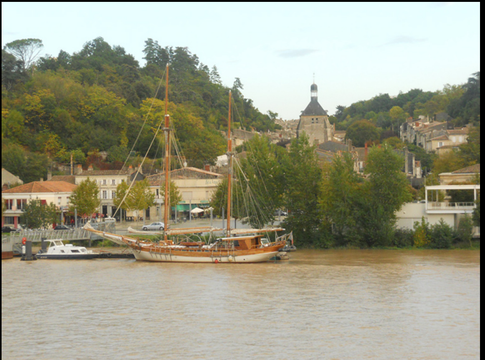
Mouth of Gironde river