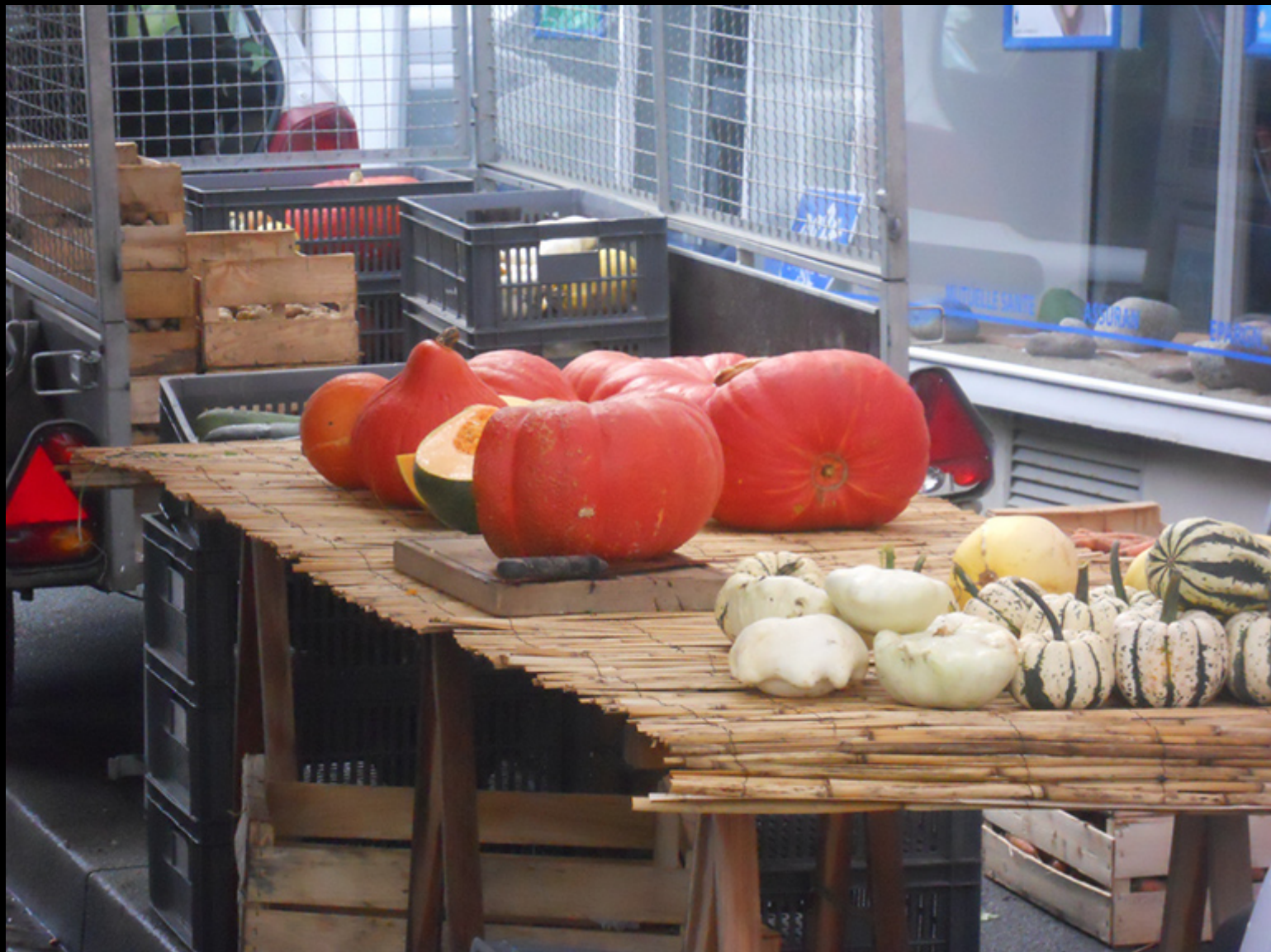
Pumpkins in Brest