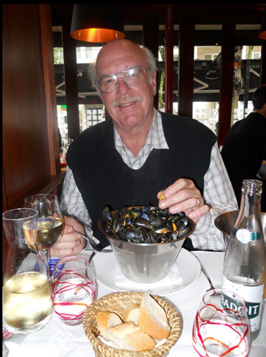
Moule in Lorient