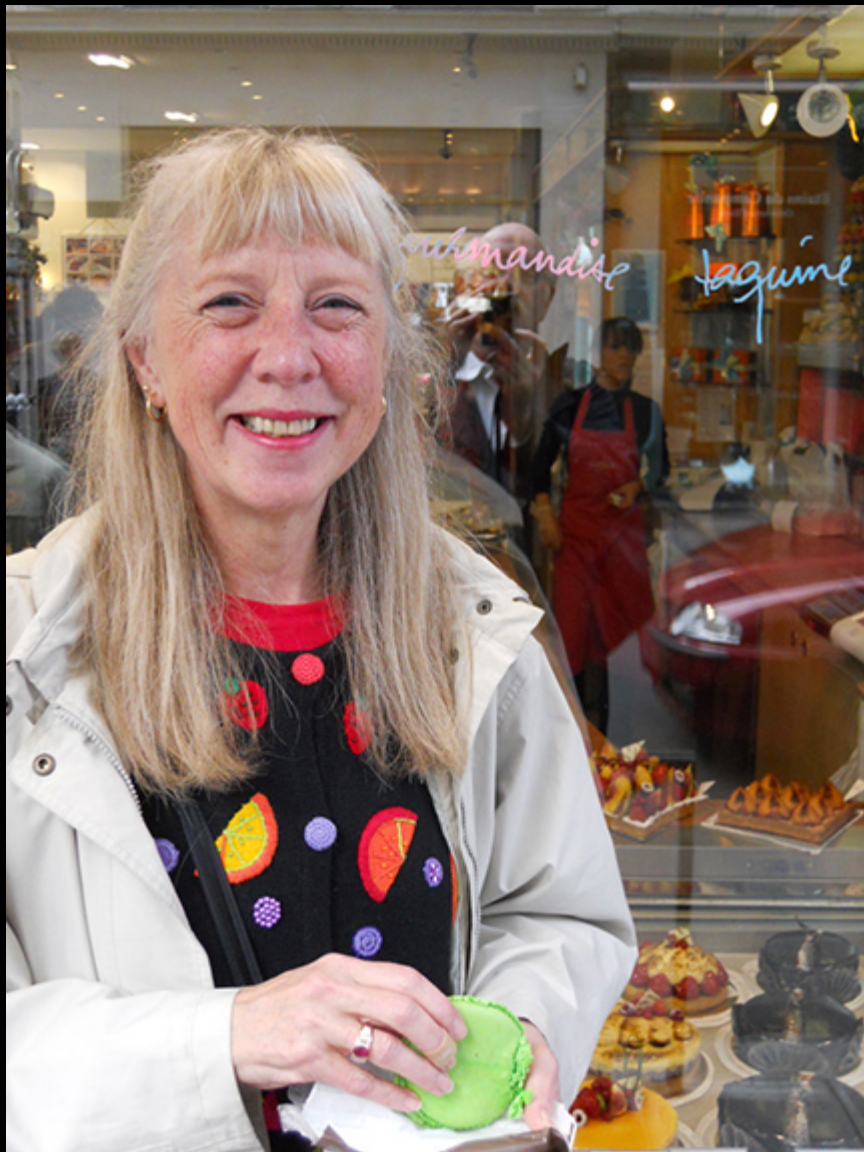
Tasty treats in Paris