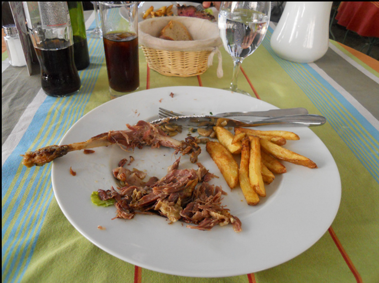
Good Lunch in Bordeaux