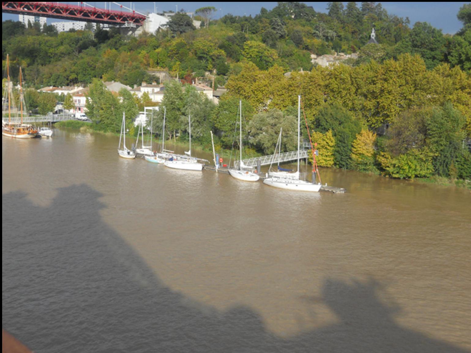
Gironde River 2