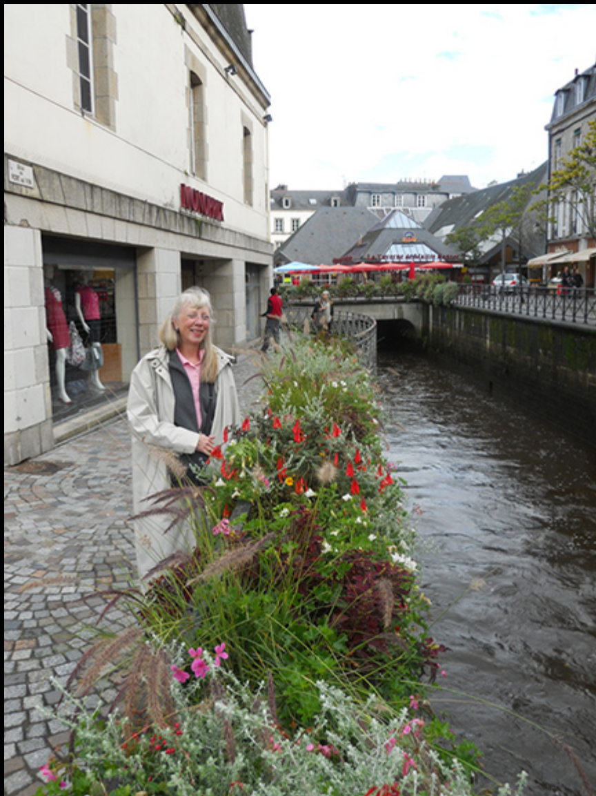
River through Quimper France