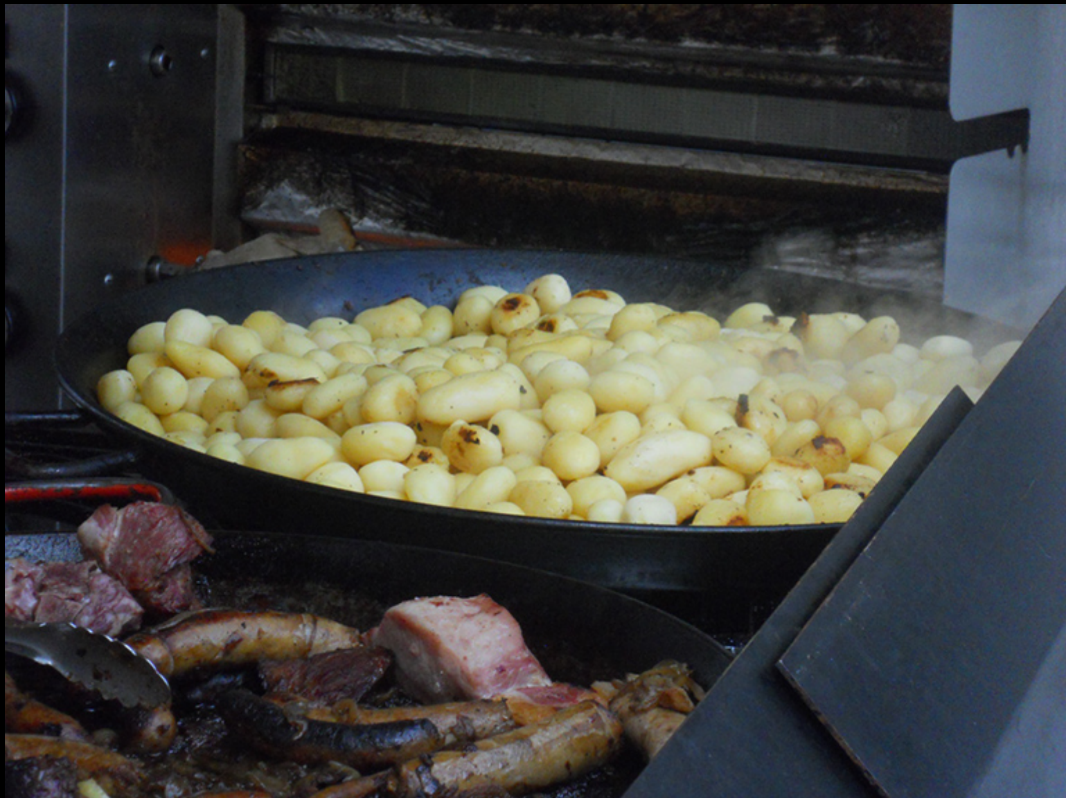
Potatoes in Brest