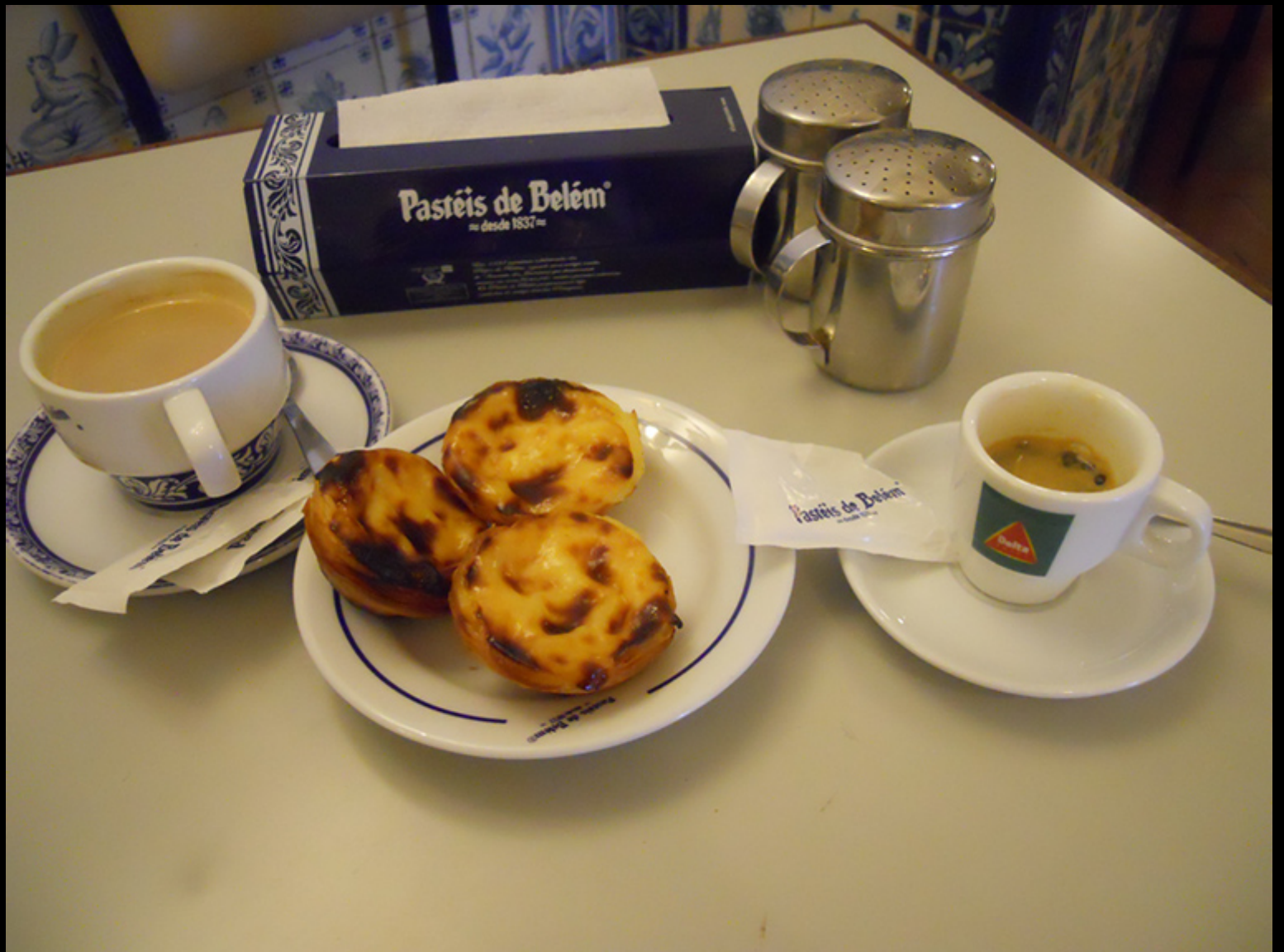
Pateis de Belem treats Lisbon