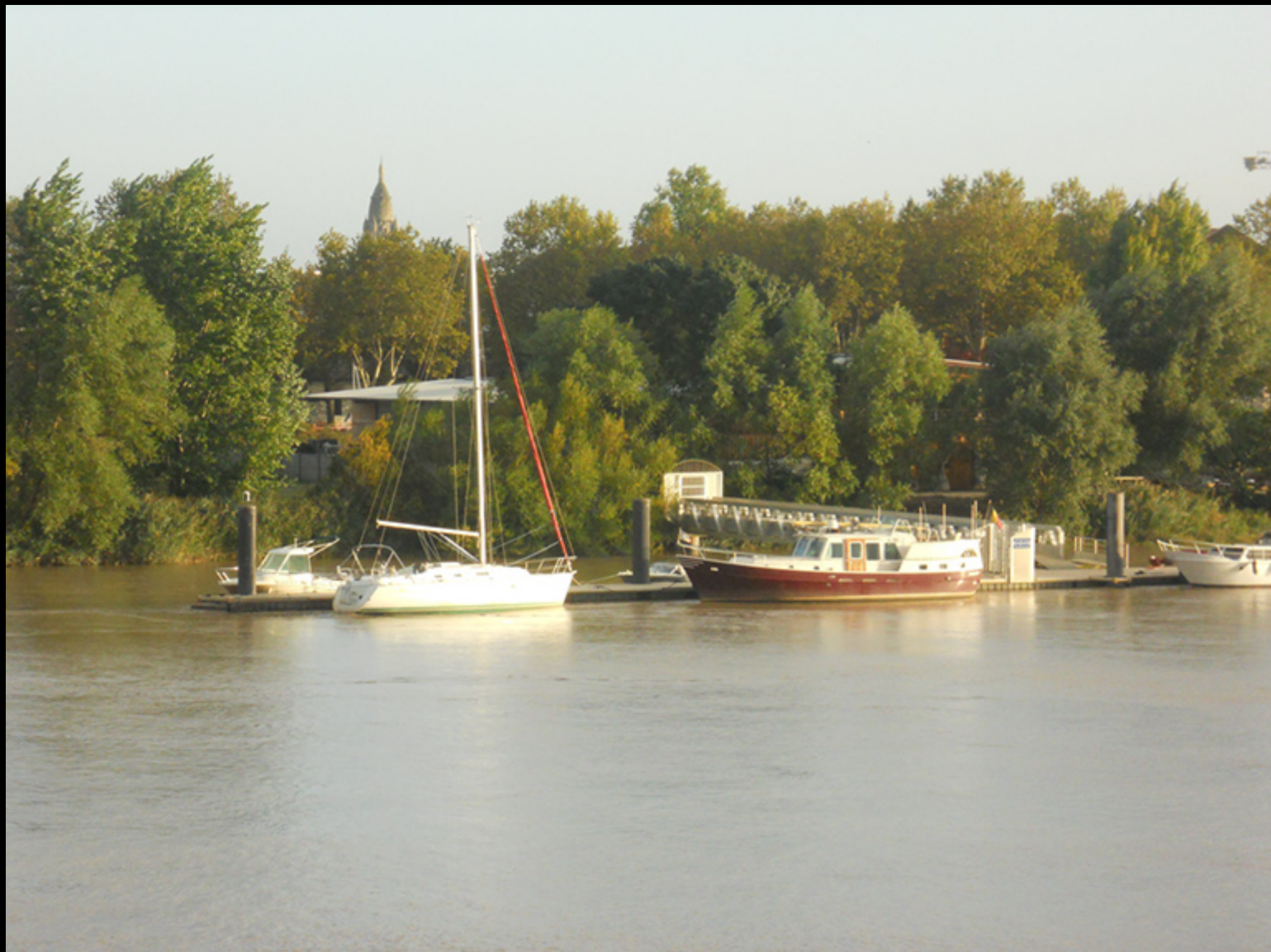
Gironde River 1