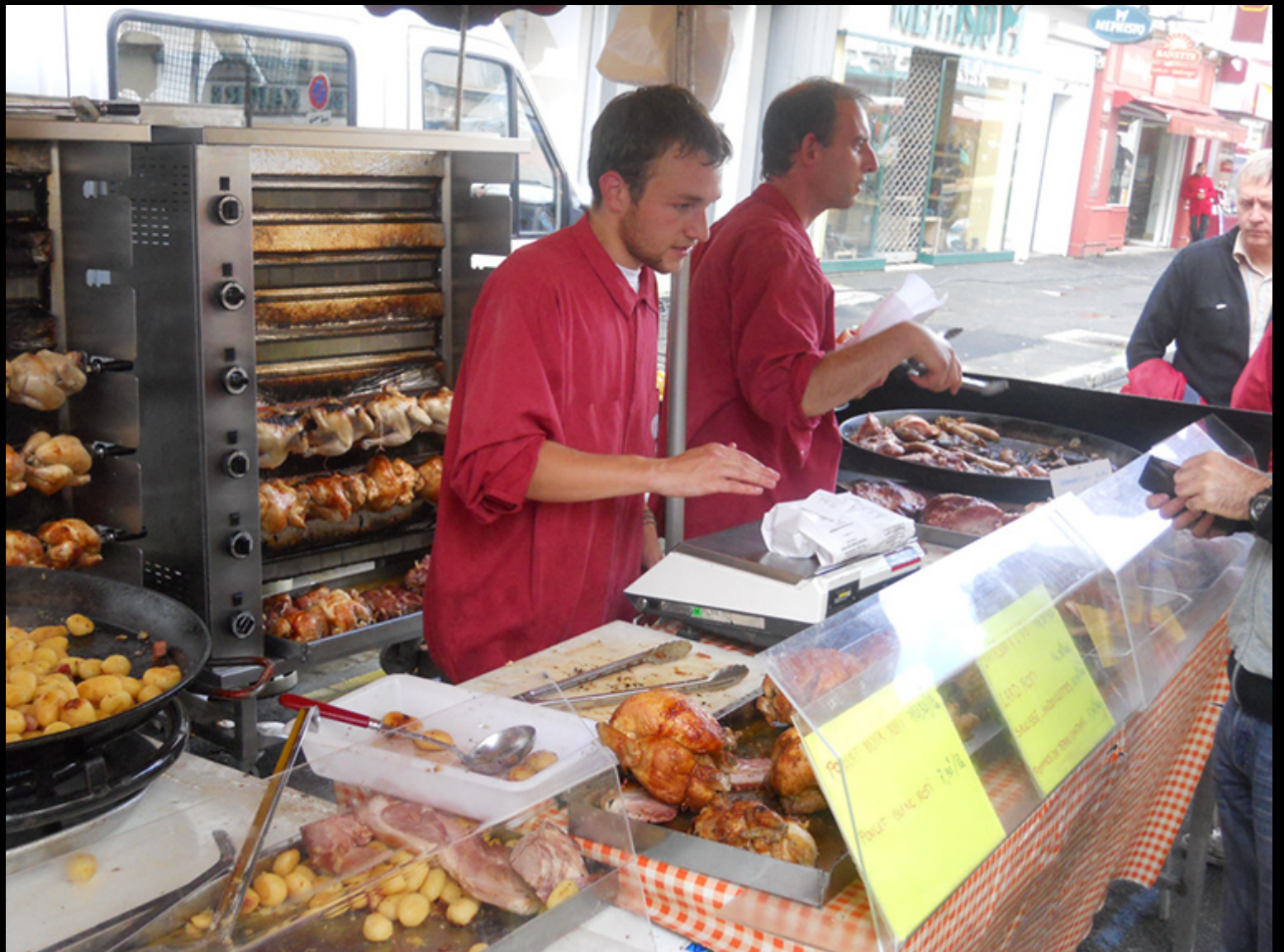
Roast Chicken vender in Brest France