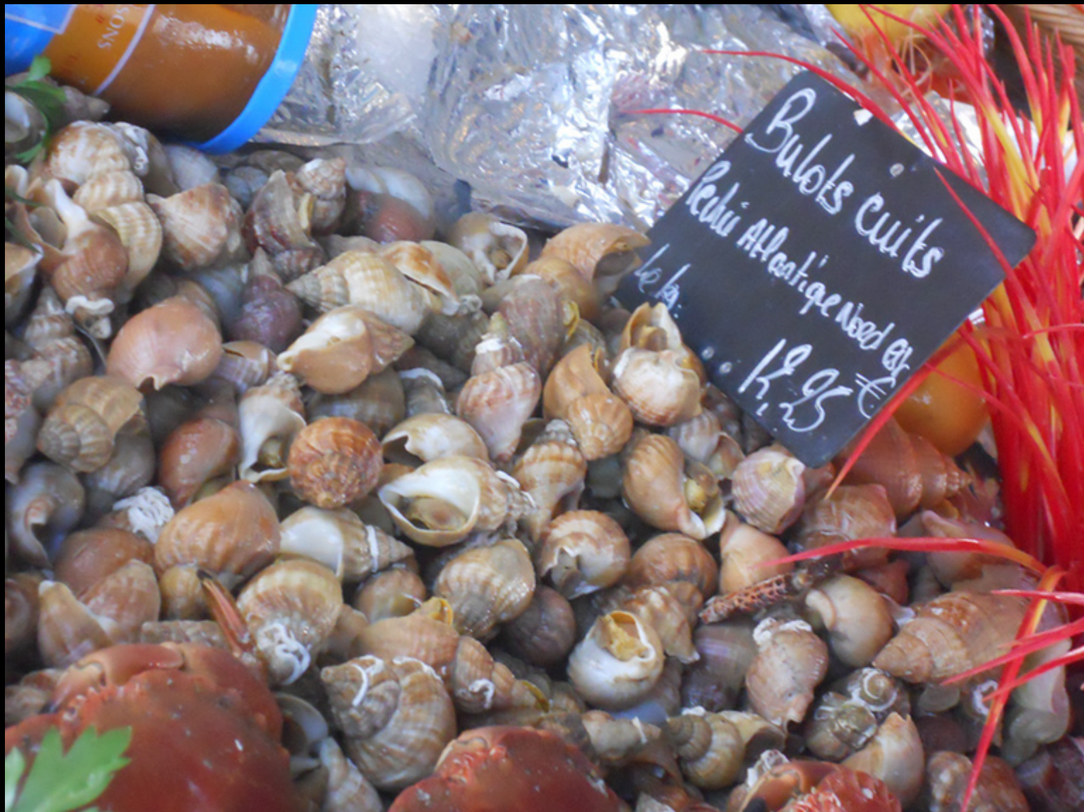
Seafood in Bordeaux