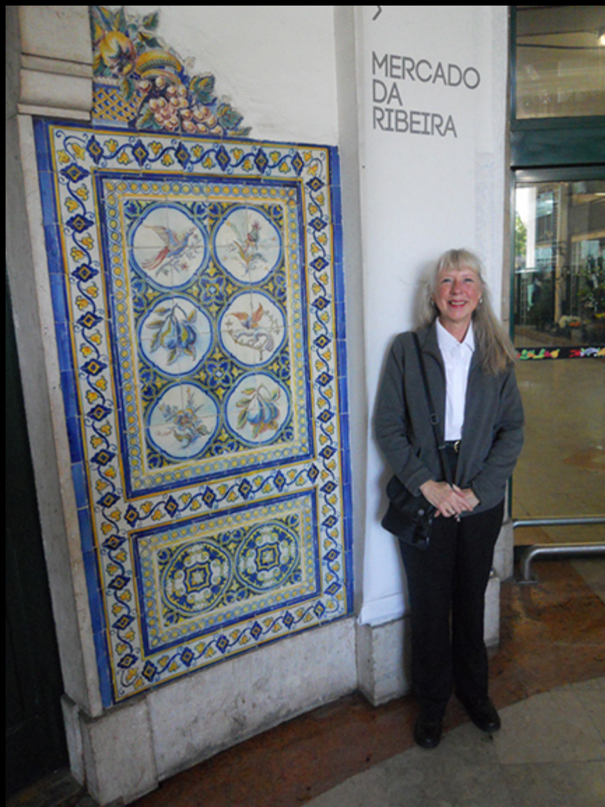
Cafe Pasteis de Belem - Lisbon