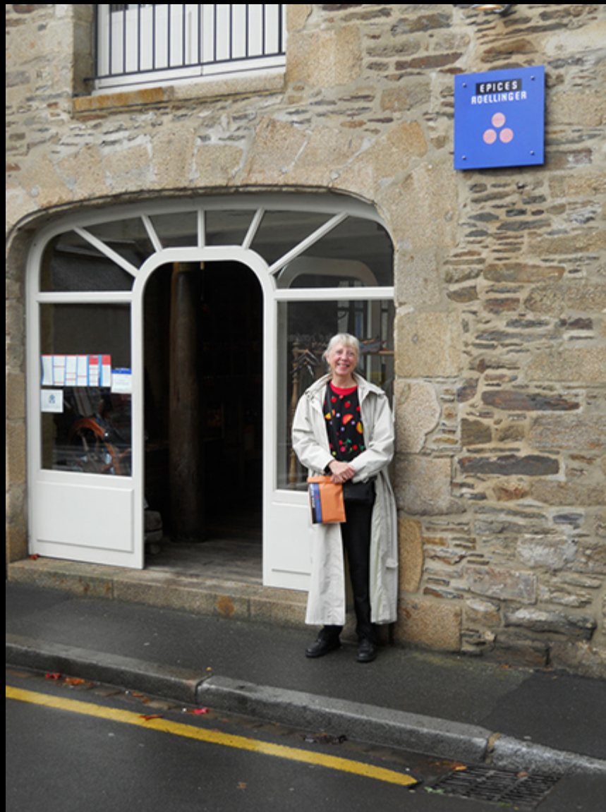
Entrepot Epices-Roellinger - Concale France