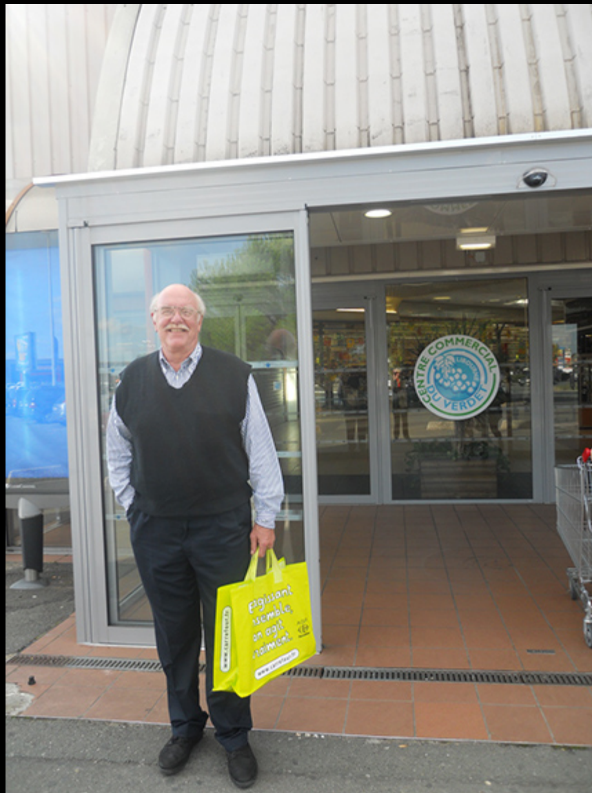
Hypermarket in Liborne