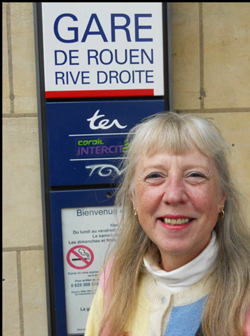
Rouen Train Station