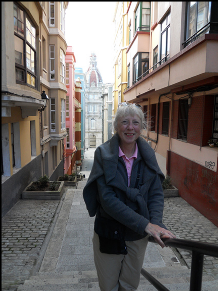
Street in La Coruna Spain