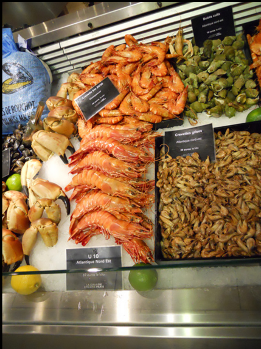
Le Bon March