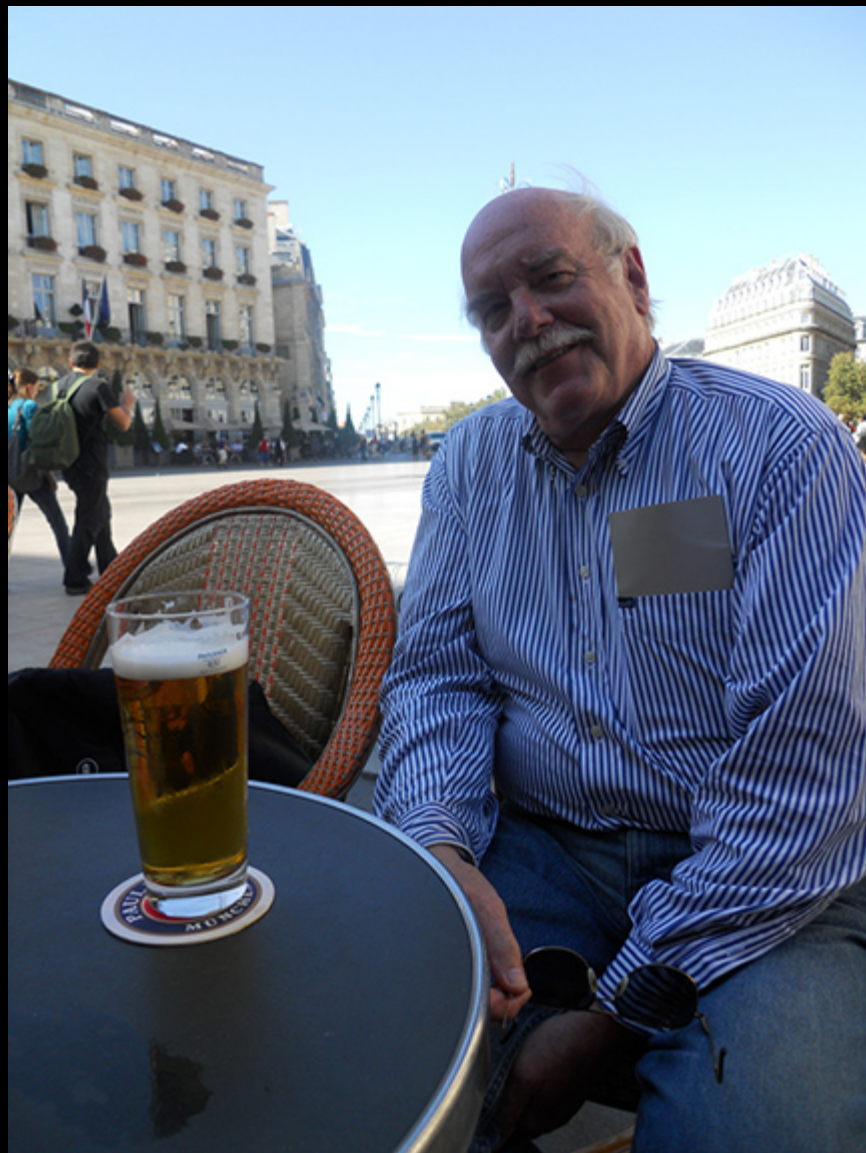
Resting in Bordeaux