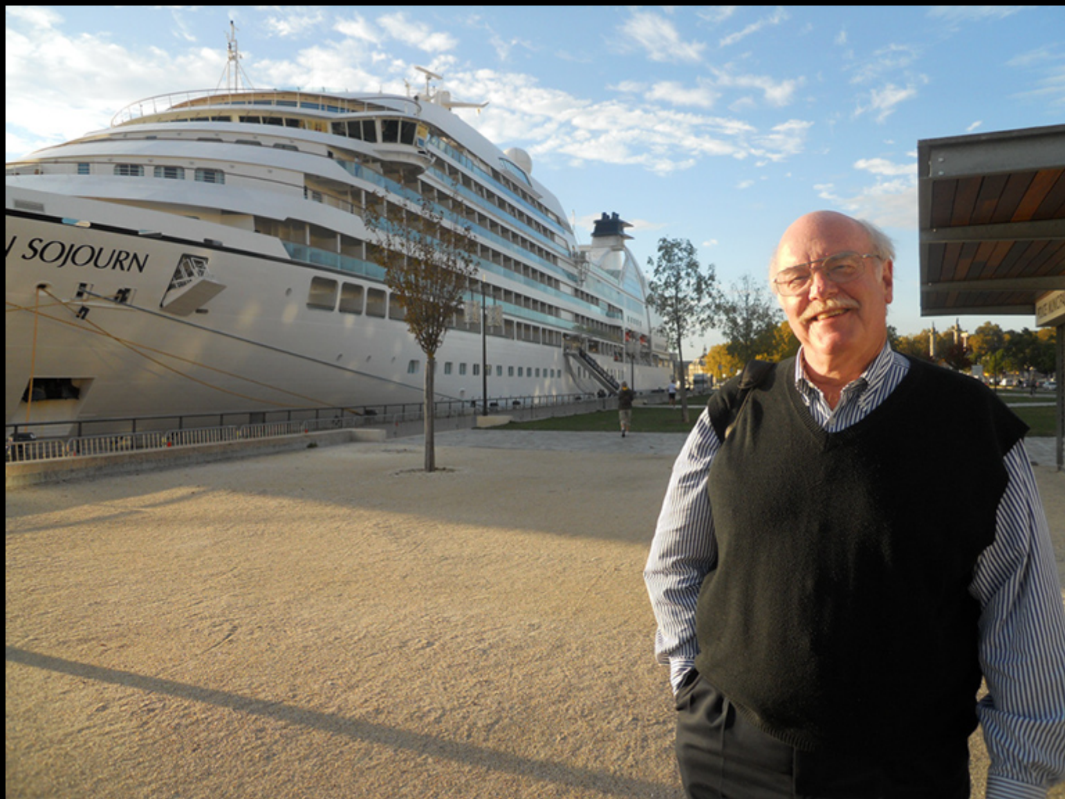
docked in Brest