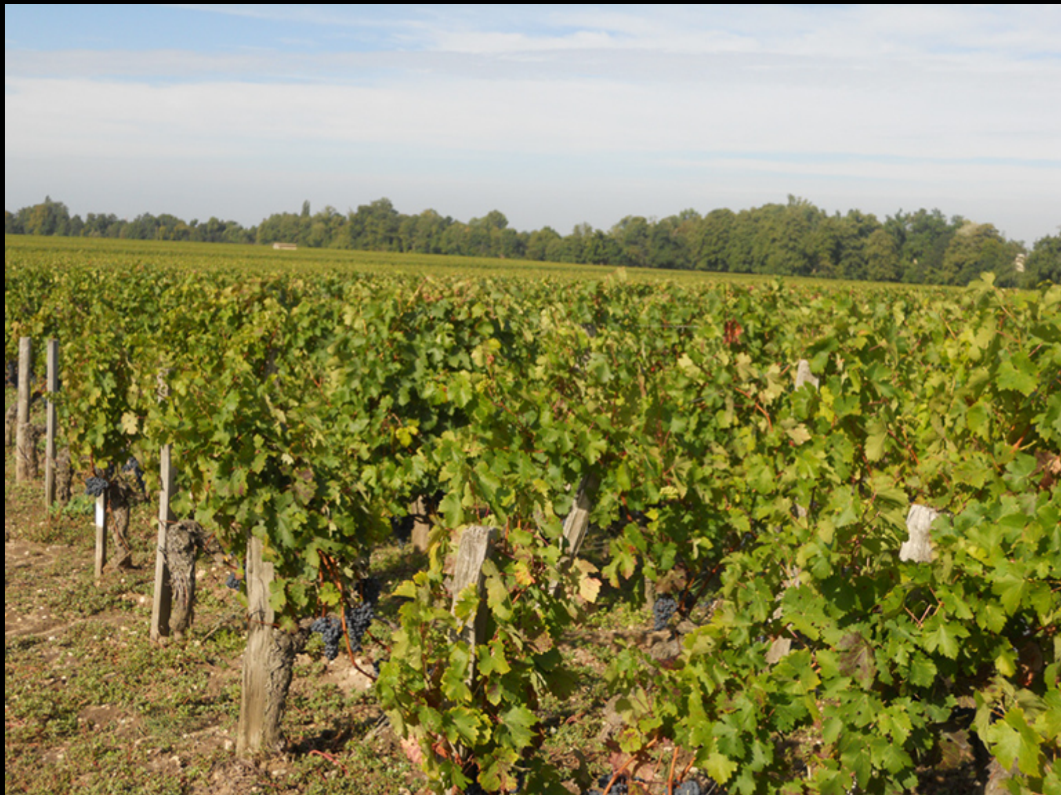
Crush in Bordeaux