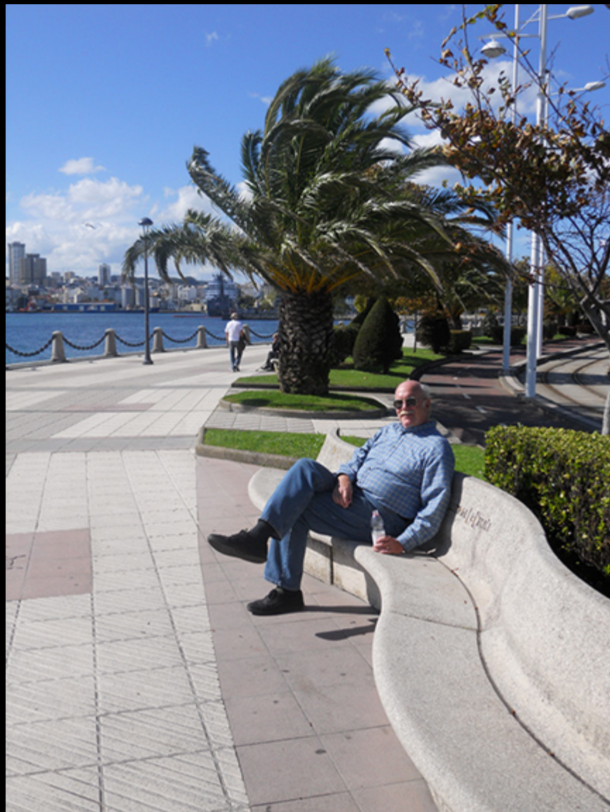
Seaside - La Coruna Spain