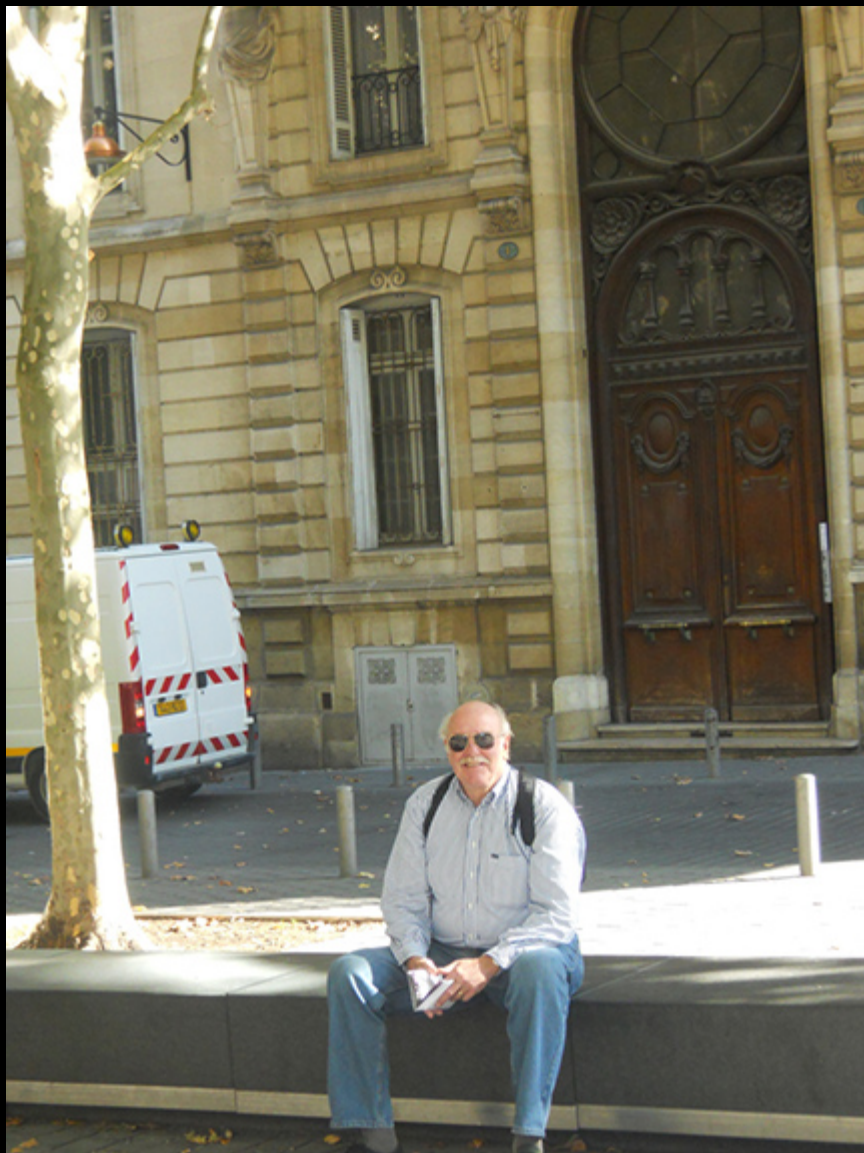
checking map in Bordeaux