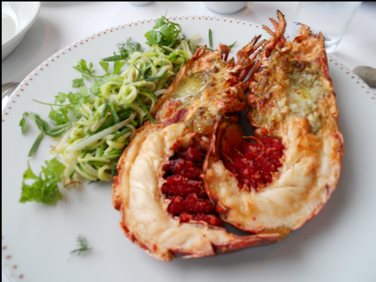
Best Lobster ever