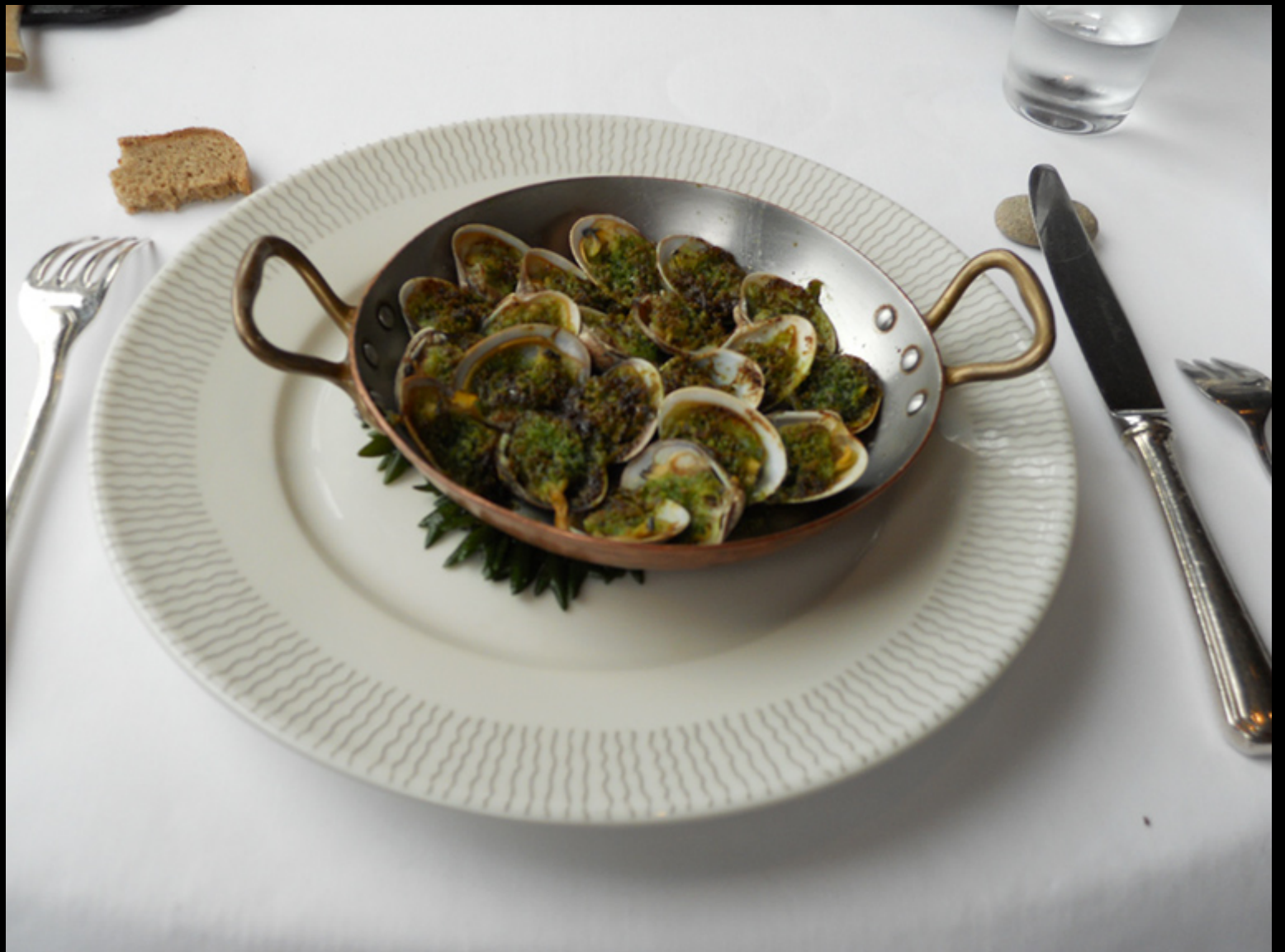
Kyles 1st course Le Coquillage