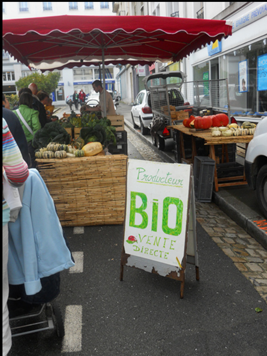
Brest organic stall