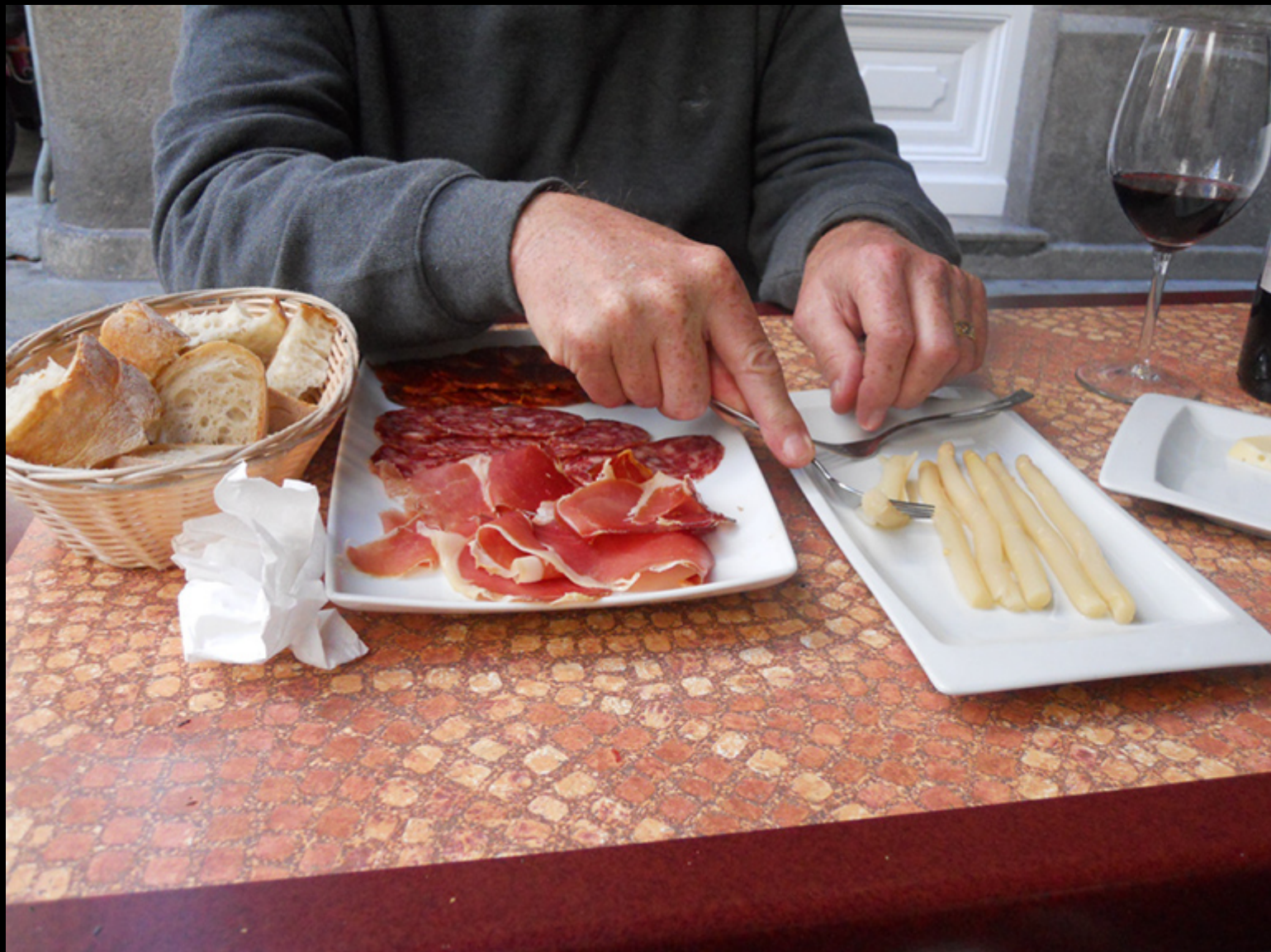
Best Lunch in La Coruna