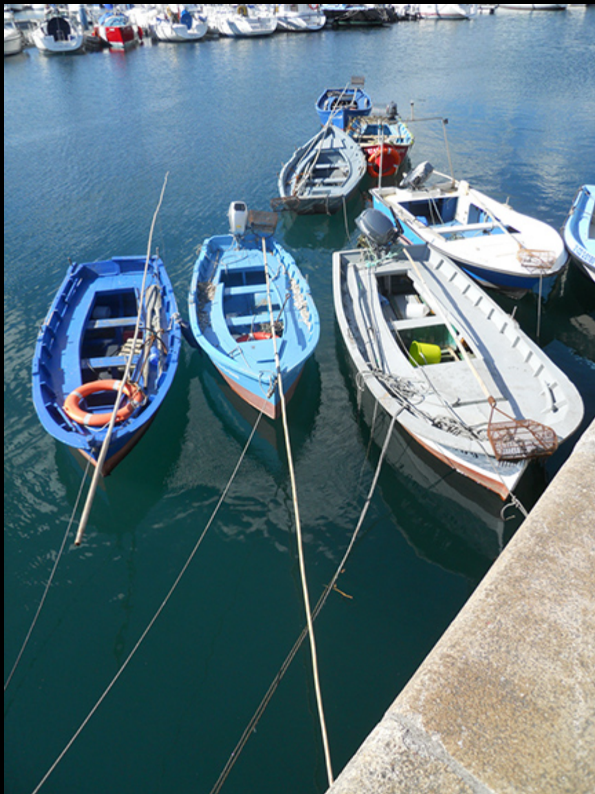
La Coruna Habor