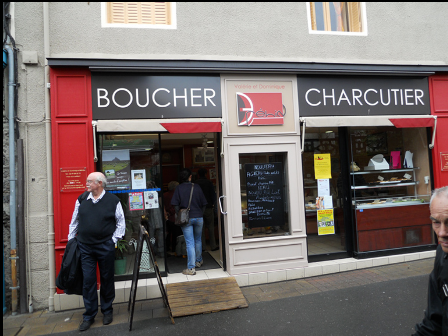
Butcher in Concale