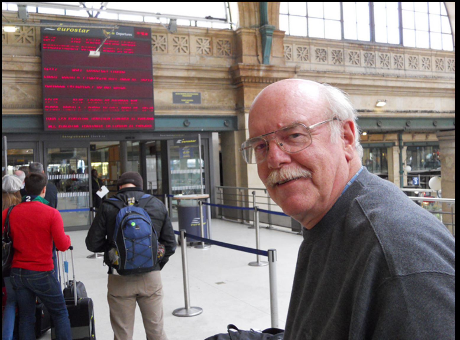
Gare du Nord Paris