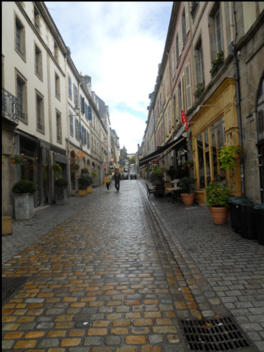
walking in Quimper Fance