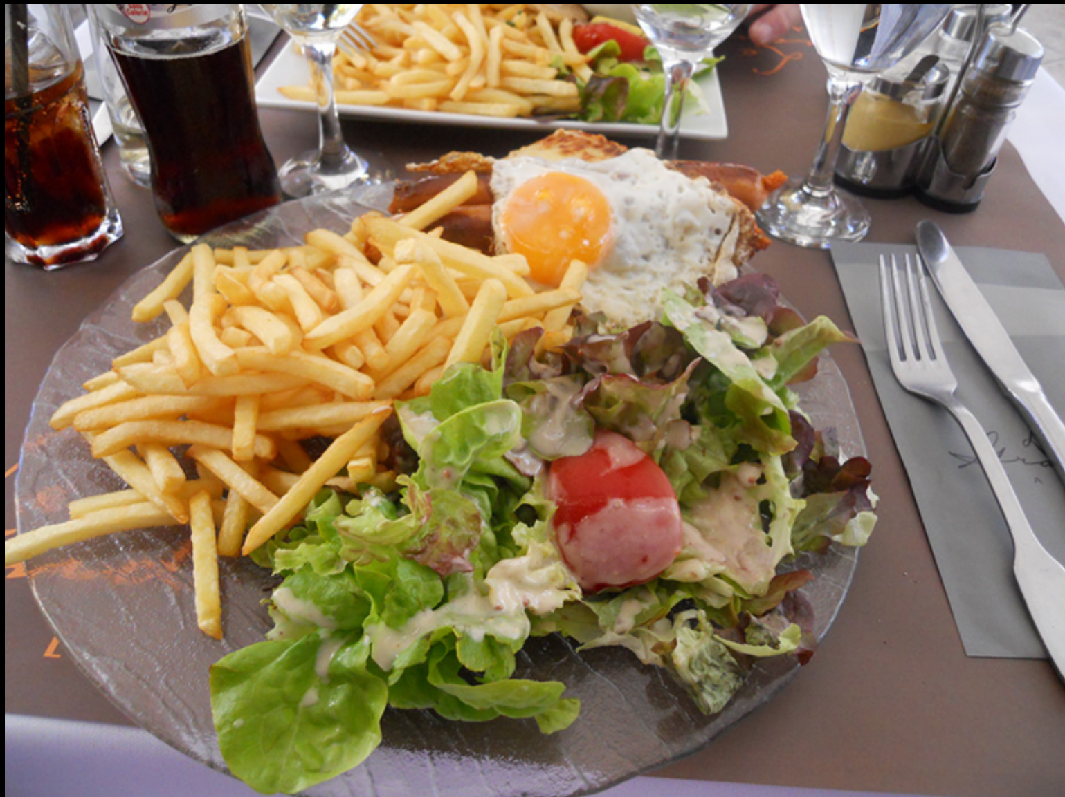
Croque Madame in Bordeaux