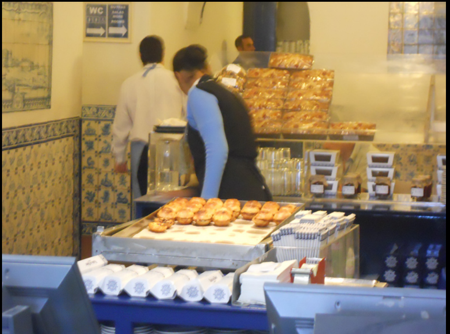
Cafe Pateis de Belem - Lisbon