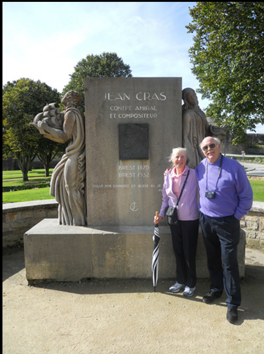
End of day in Brest France