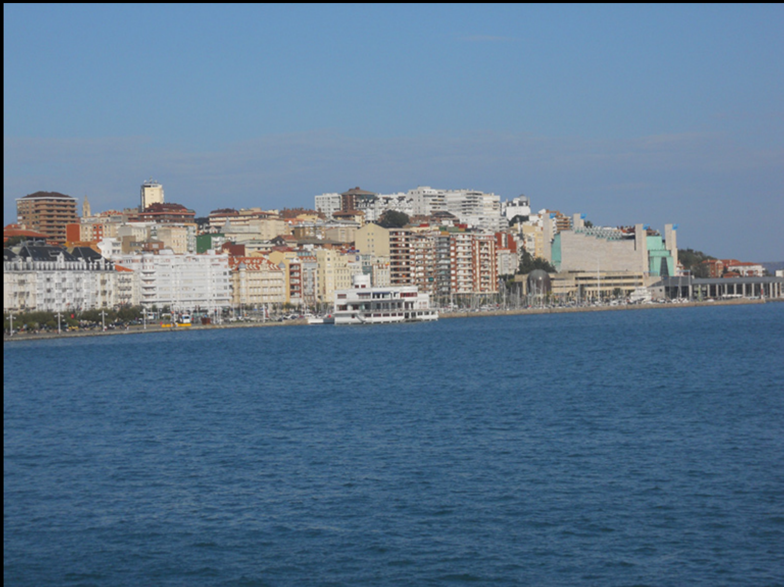
Arriving Santander Spain