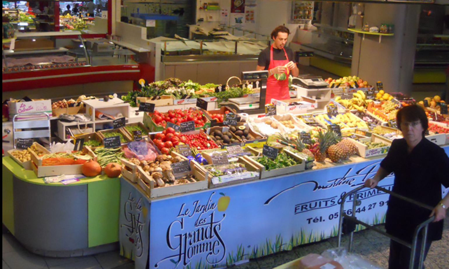
Market in Bordeaux