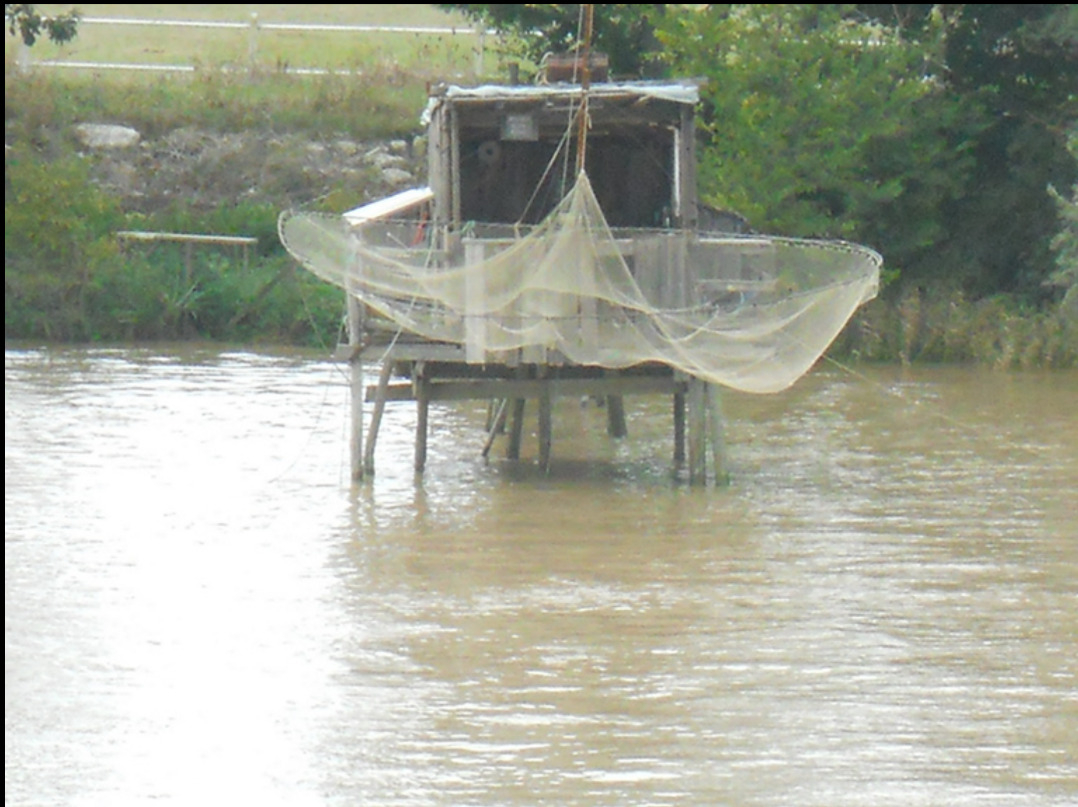
Gironde River 4