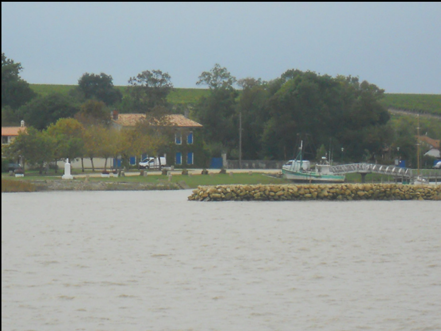
Traveling down Gironde river