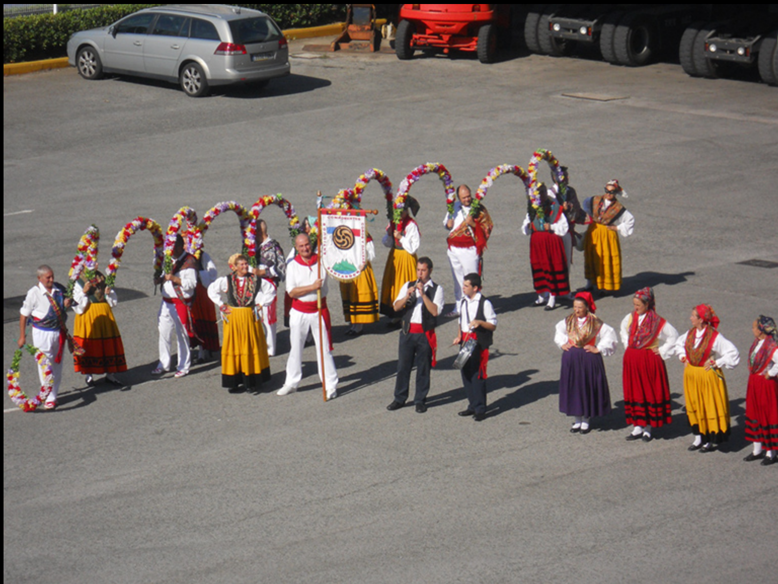
Dancers farewell Santander Spain