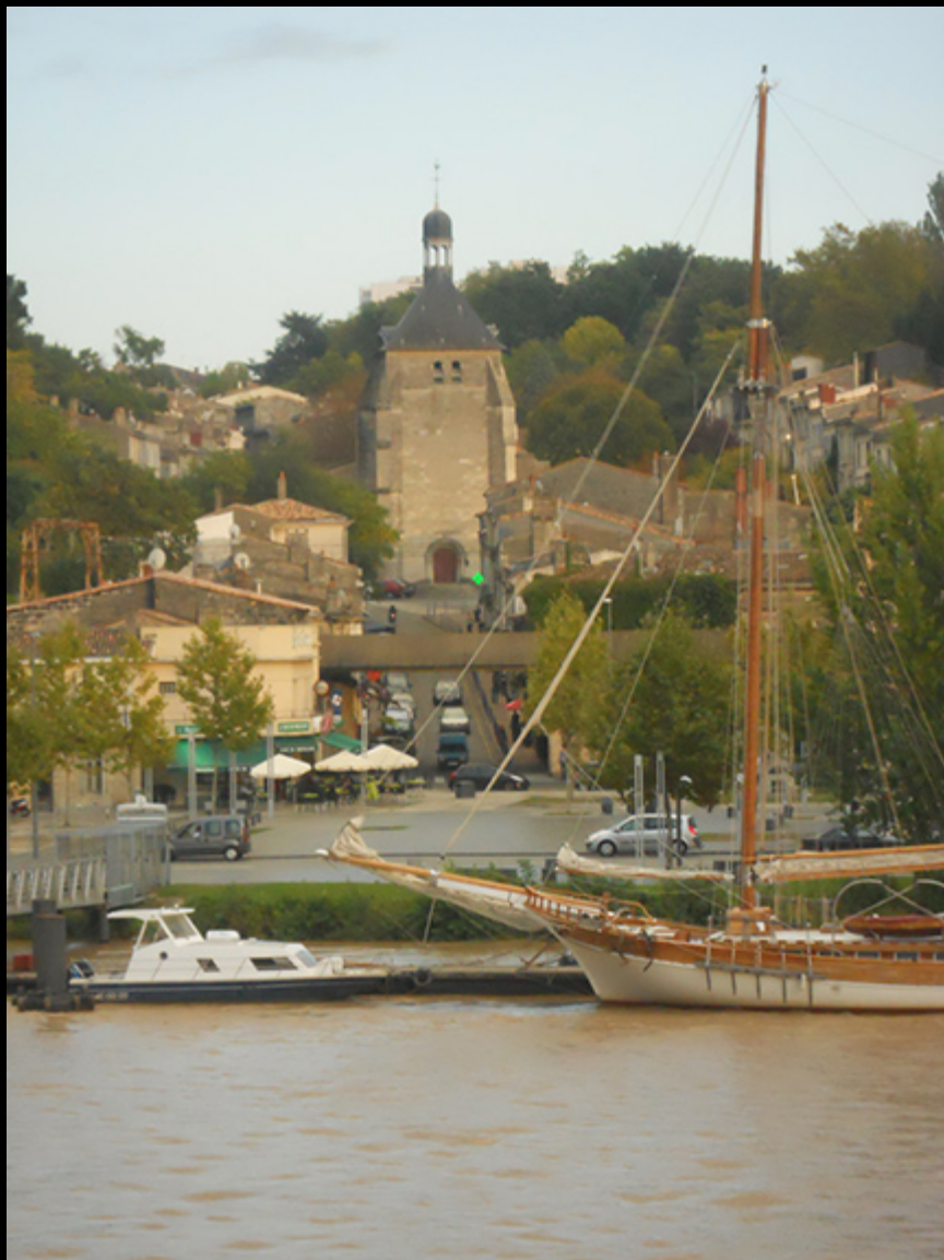
End of Gironde river