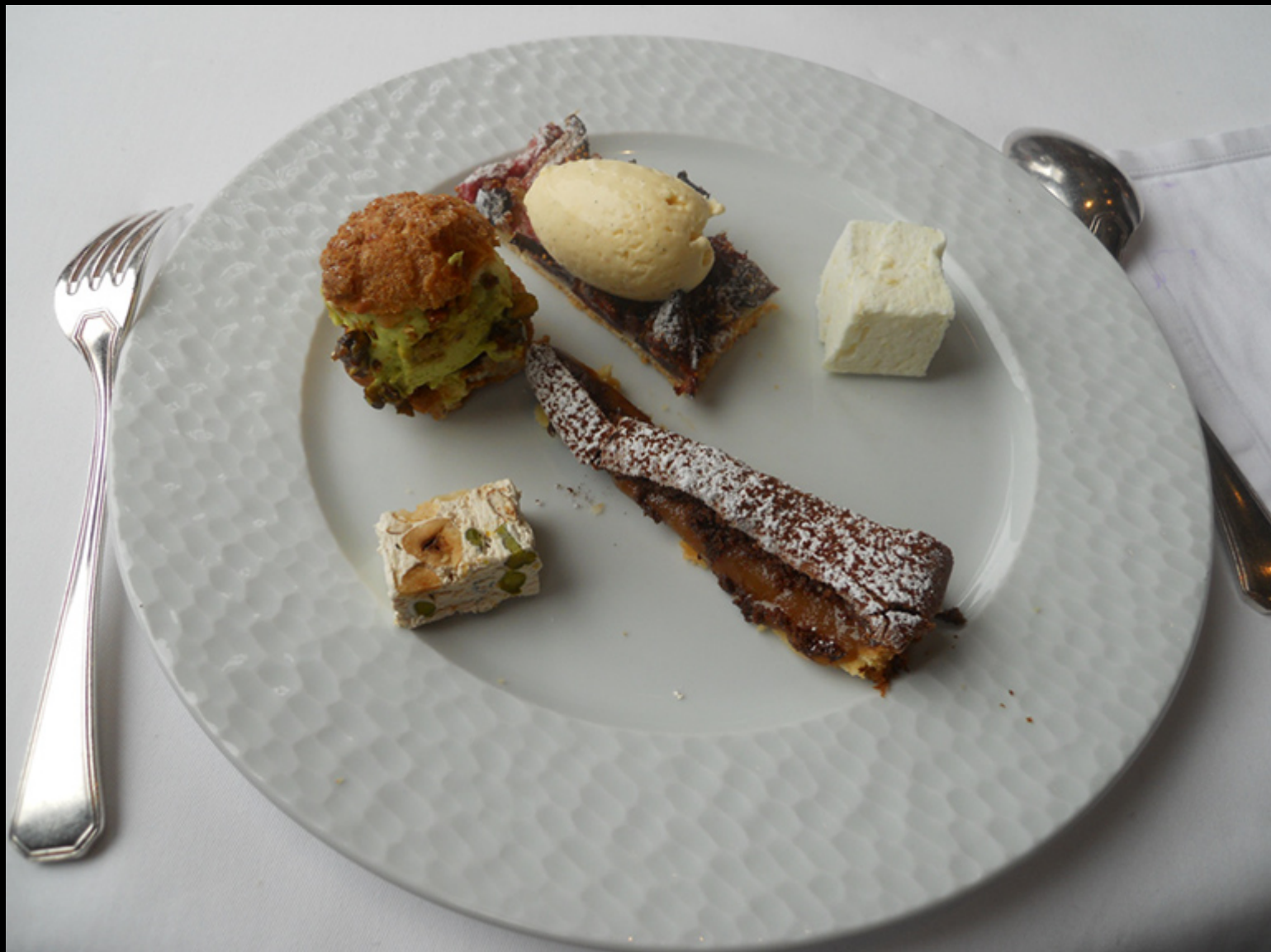
Dessert le Coquillage