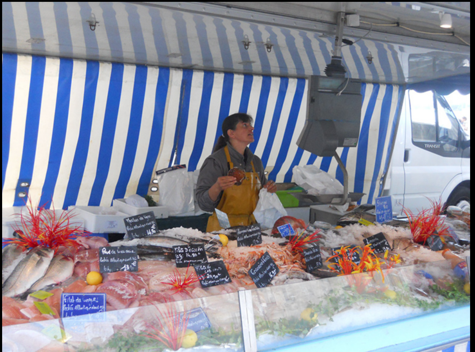
Organic Market Bordeaux