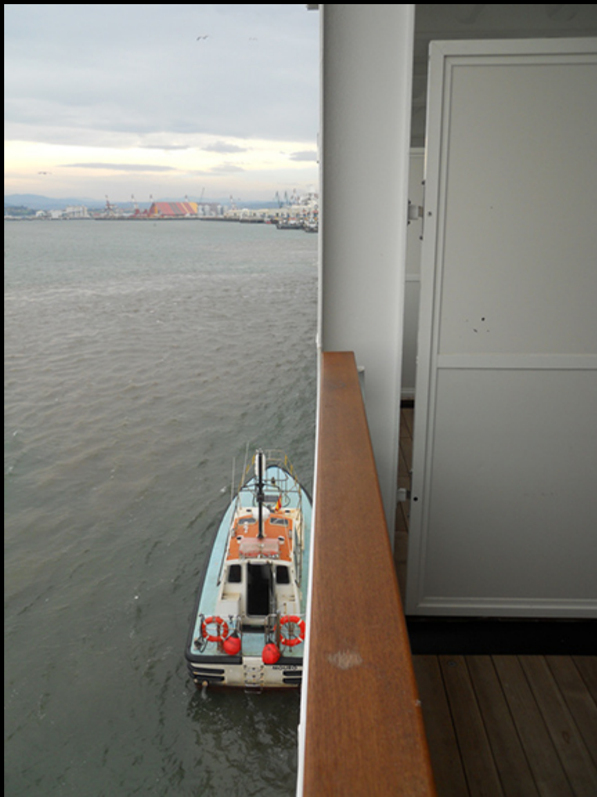
Pilot leaving ship