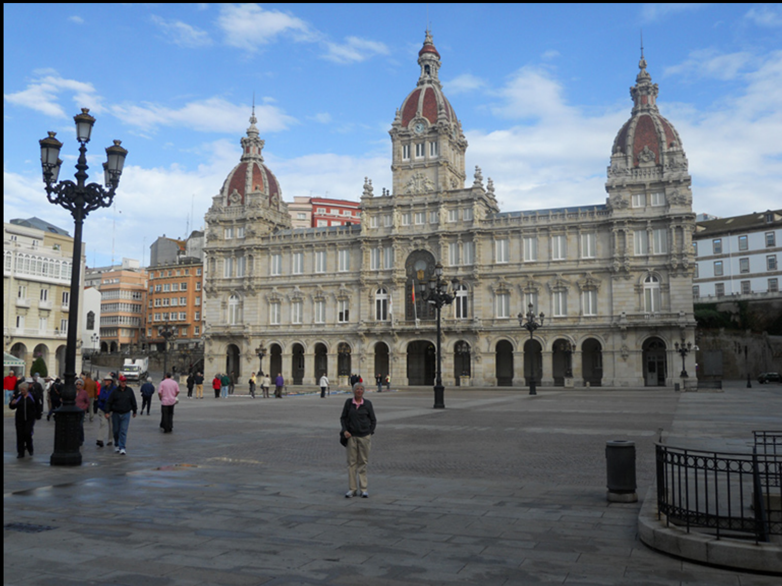
Liborne France square