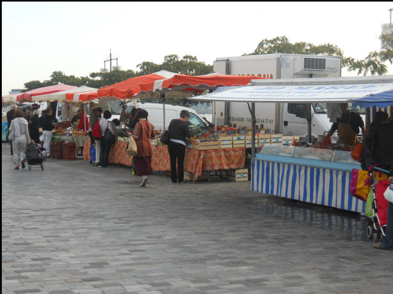
Organic Market day Bordeaux