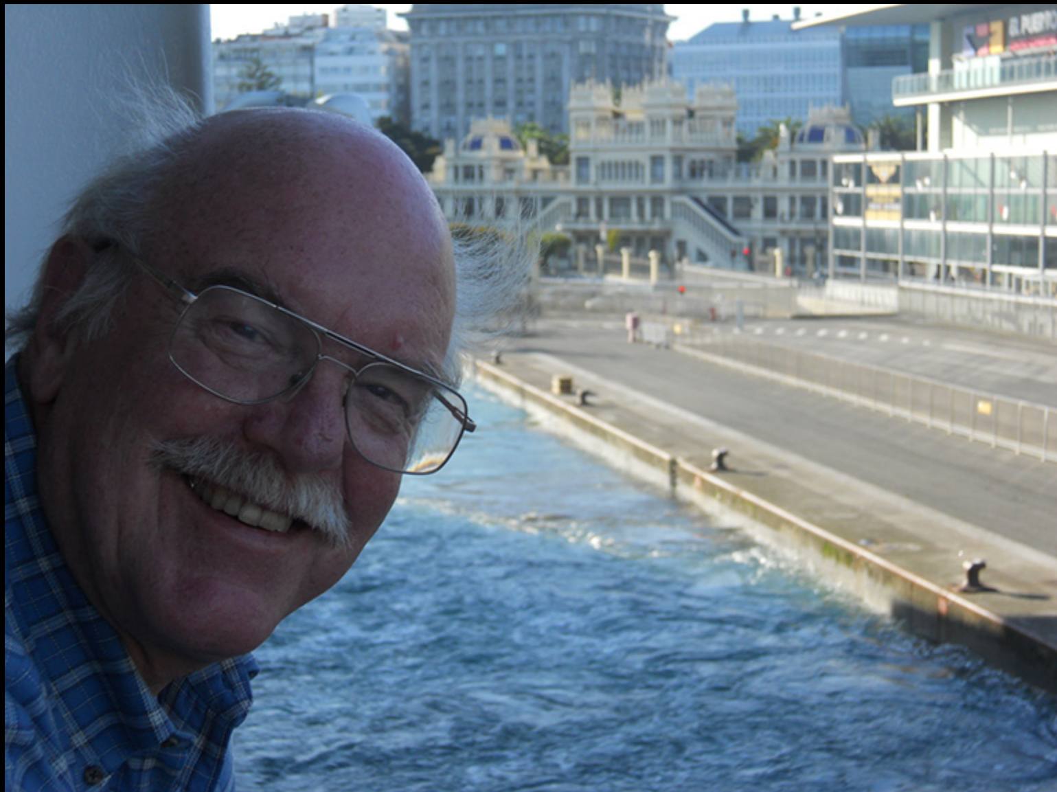
Leaving La Coruna Spain