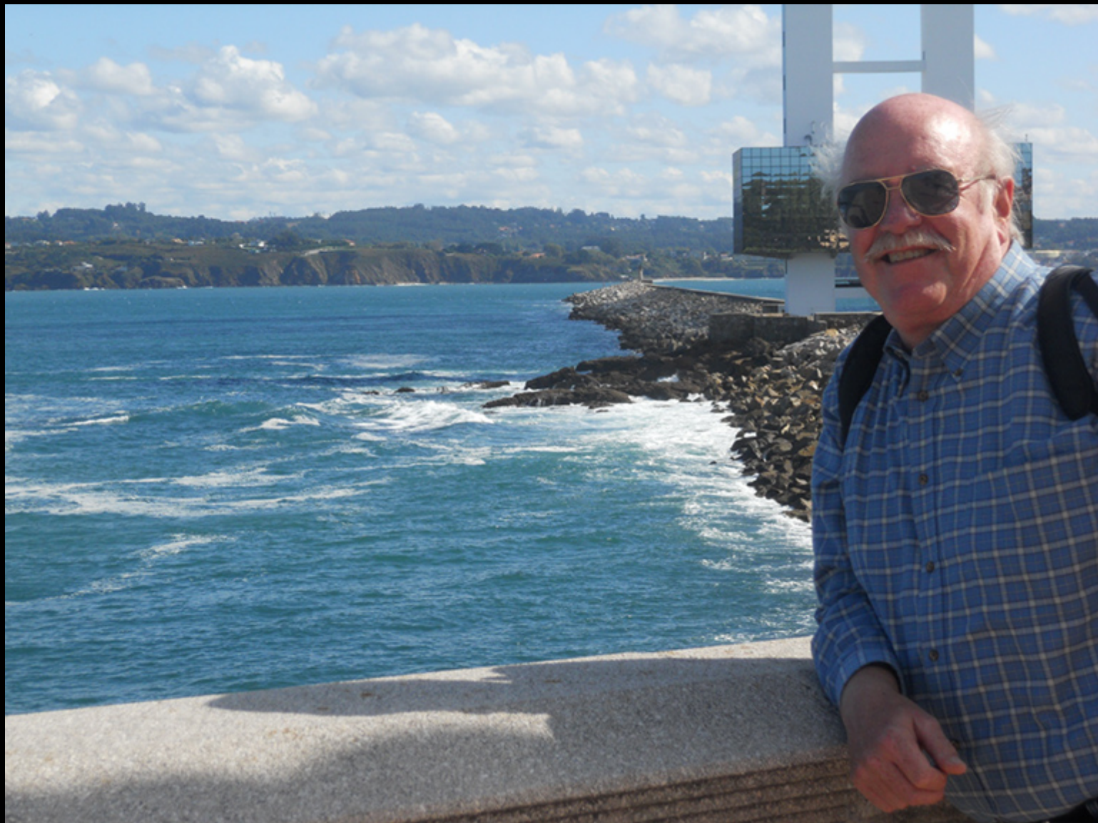
Walk in La Coruna Spain