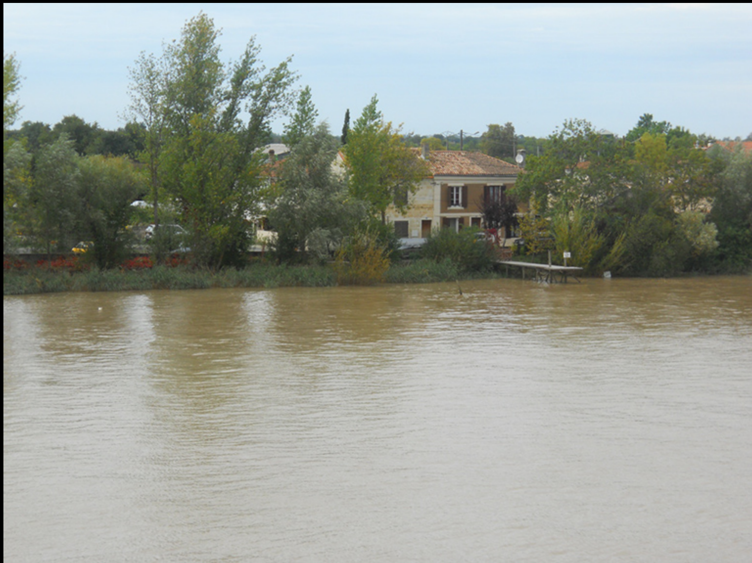
Gironde River 3